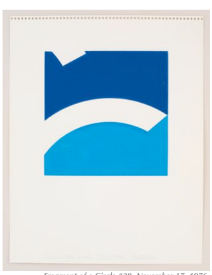
Fragment of a Circle #29, November 17, 1976 colored pencil on paper, 14 x 11 inches