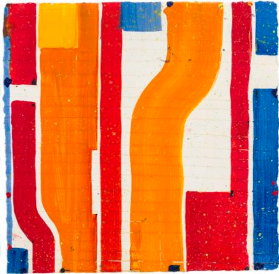
Pietrasanta P13.74 , 2013, gouache on paper, 14 x 14 in