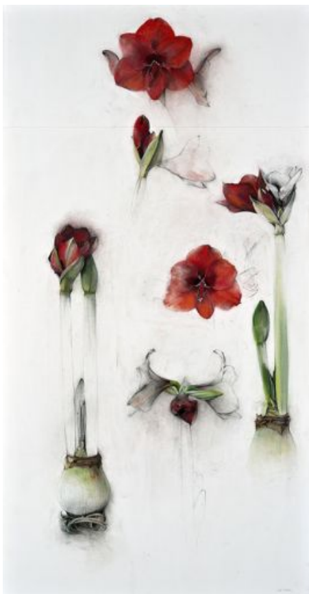
Red Amaryllis , 2014, pastel, charcoal and crayon on paper, 49 1/2 x 26 in