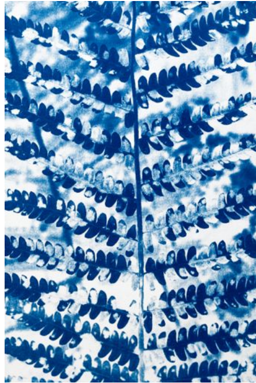
Sagg Fern Blue , 2015, archival pigment print, 34 1/2 x 24 in, Ed/5