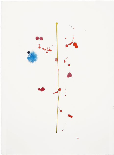
Composition, January 10, 2018