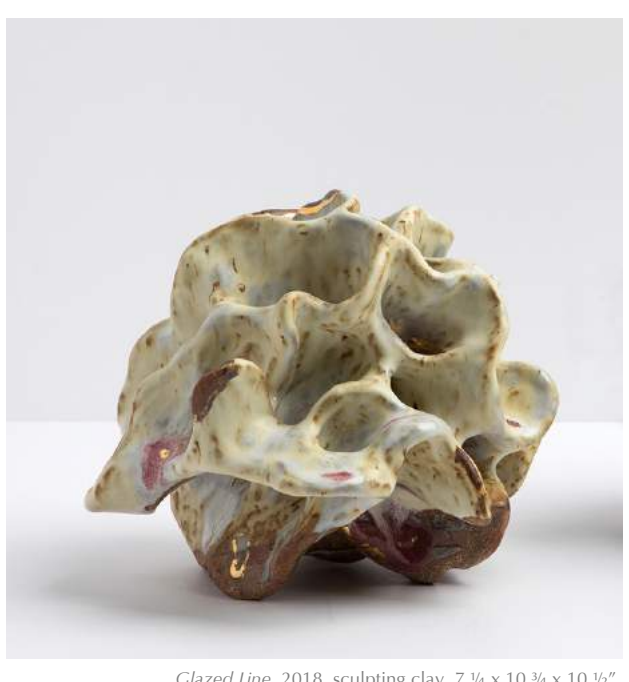
Glazed Line, 2018, sculpting clay, 7 1/4 x 10 3/4 x 10 1/2"