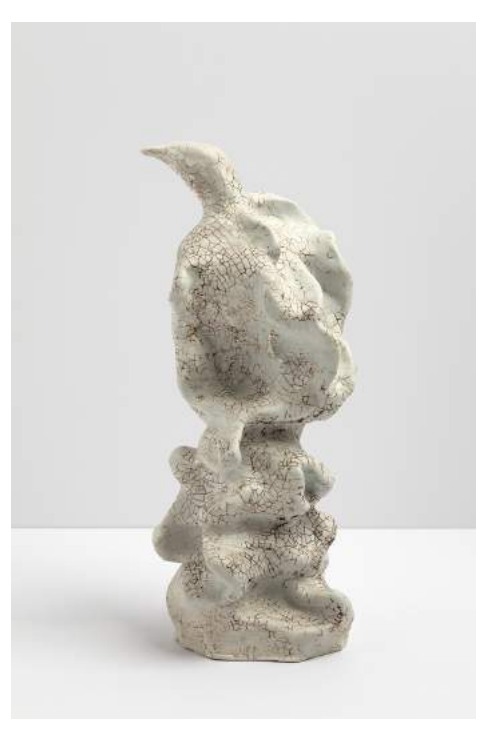
Porcelain Loose Bird, 2018 porcelain, 10 1/4 x 4 1/4 x 3 1/2'

On view from August 30 through September 30, The Drawing Room in East Hampton is pleased to present FIONA WATERSTREET: Sculpture. A separate press release is available for the concurrent exhibition, CHARLES JONES: Early 20th-Century Photographs.