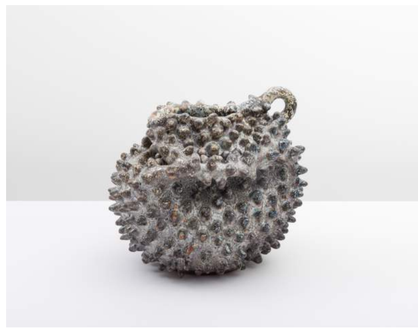
Multi Glazed Folly #1, 2018, sculpting clay, 8 ½ x 9 ½ x 8 ¼"

Pulling each shape out of its historic role and into painterly sculpture, Waterstreet has broken new ground in porcelain and clay. Each individually realized work seems to embody or pay homage to a distinct life force.