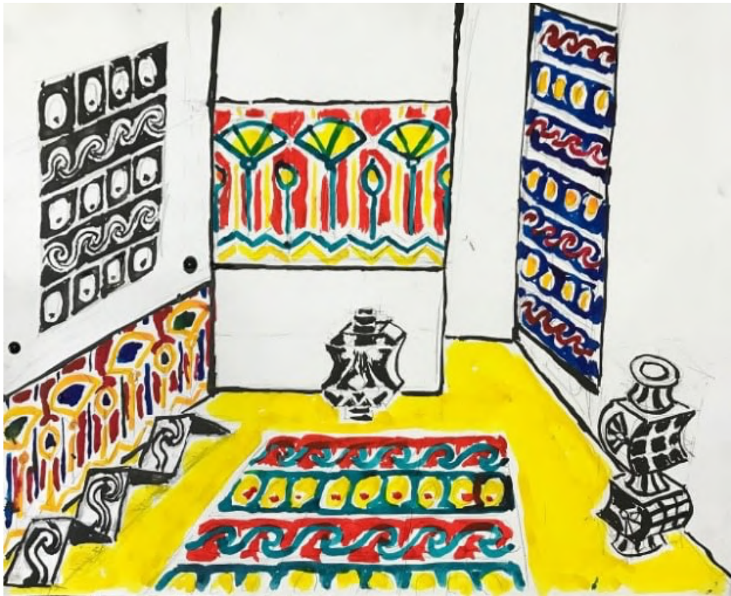
FW installation with Yellow Floor, 2020 watercolor, ink, and graphite on paper, 14 x 17 inches