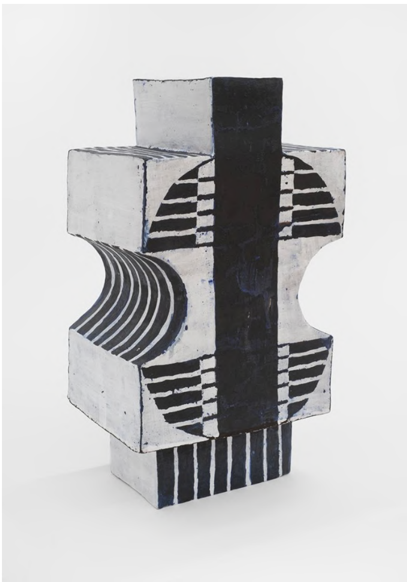
Vessel Interrupted by Emptiness, 2023 glazed earthenware, 26 1/2 × 14 × 10 1/2 inches