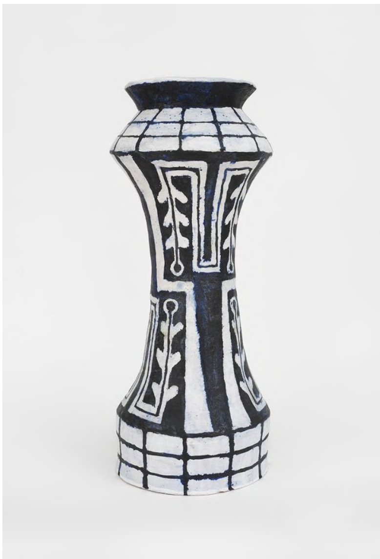
Albarelo with Sprigs, 2023 glazed earthenware, 22 x 9 x 9 inches