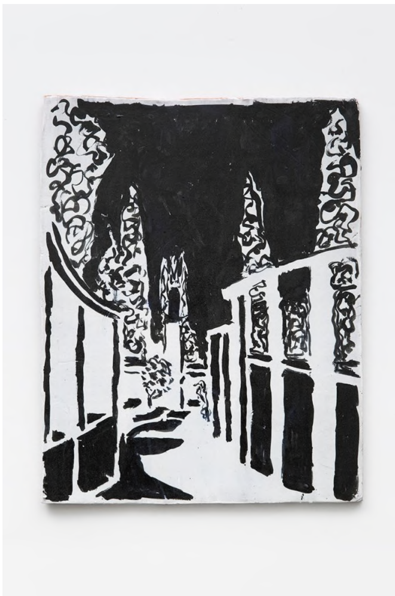
D'Annunzio's Path, 2018 glazed earthenware, 15 × 12 inches