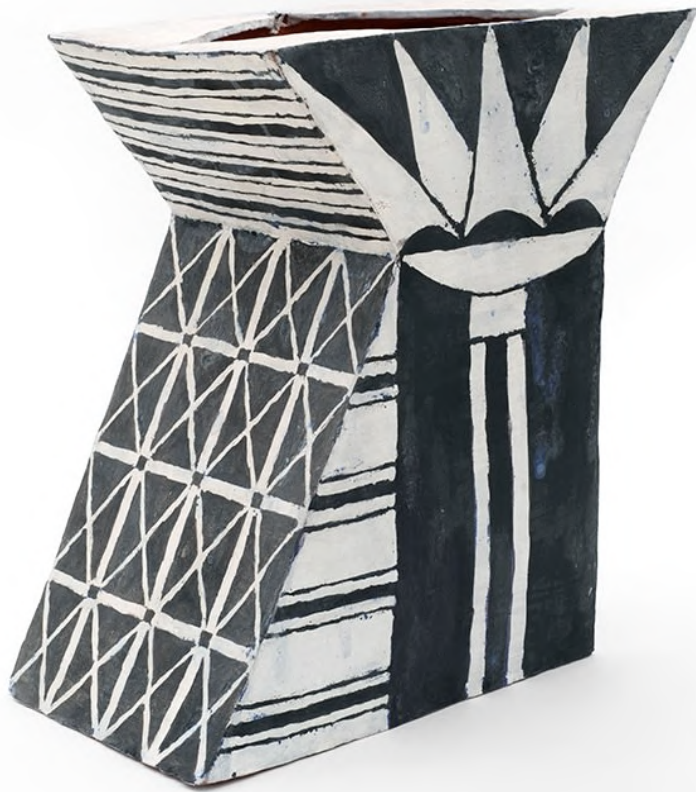
Lotus with Diagonal , 2021 glazed earthenware, 17 1/2 × 15 × 8 1/4 inches