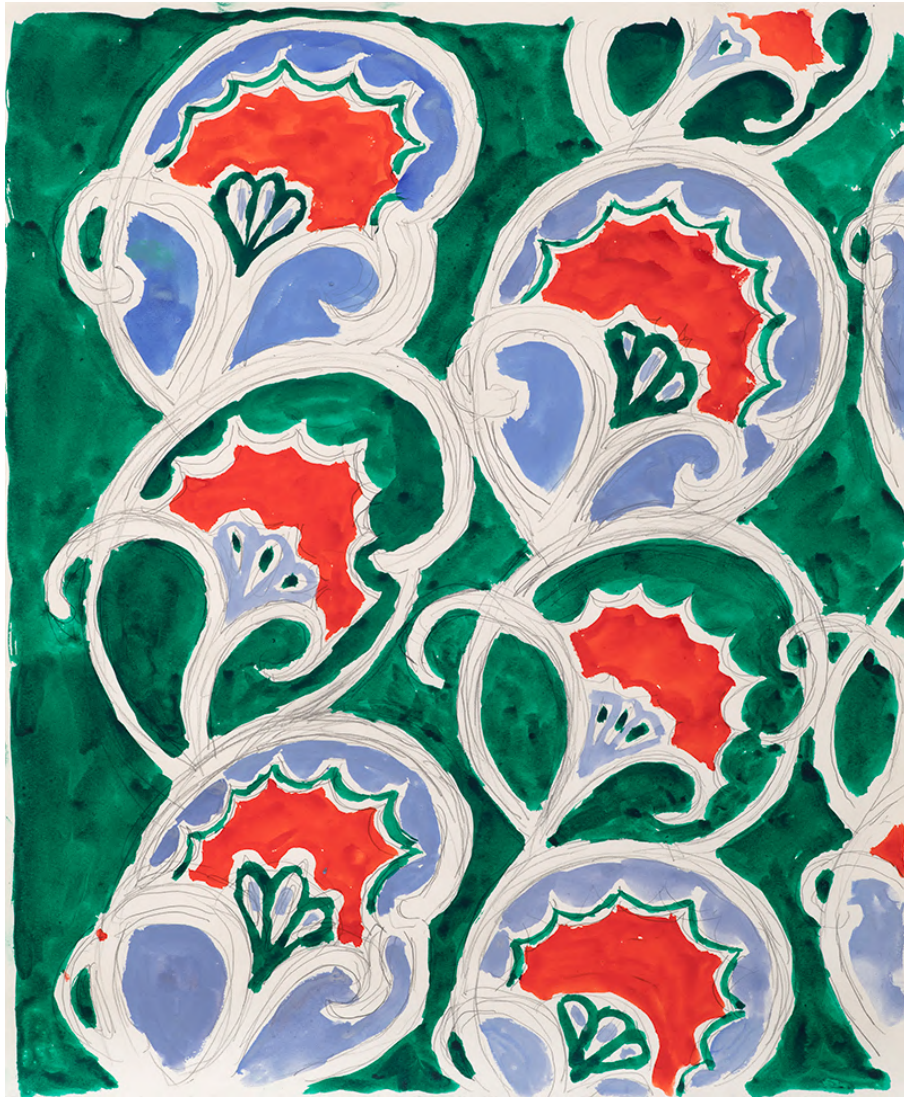
Red Fan Lotuses, Green Background, 2020 watercolor and graphite on paper, 17 × 14 inches