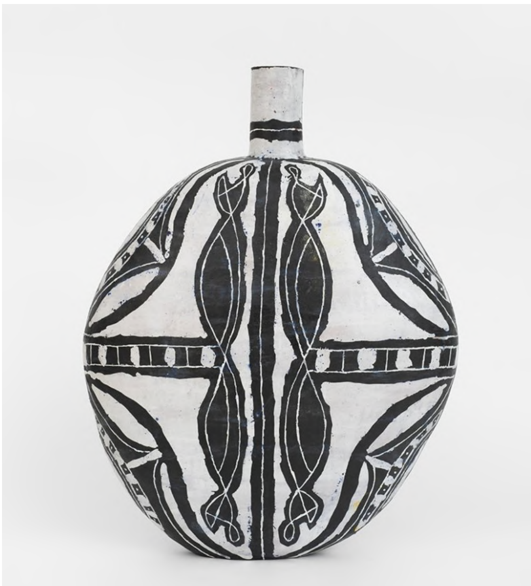
Large Parasol Flask, 2016 glazed earthenware, 24 x 18 x 7 inches