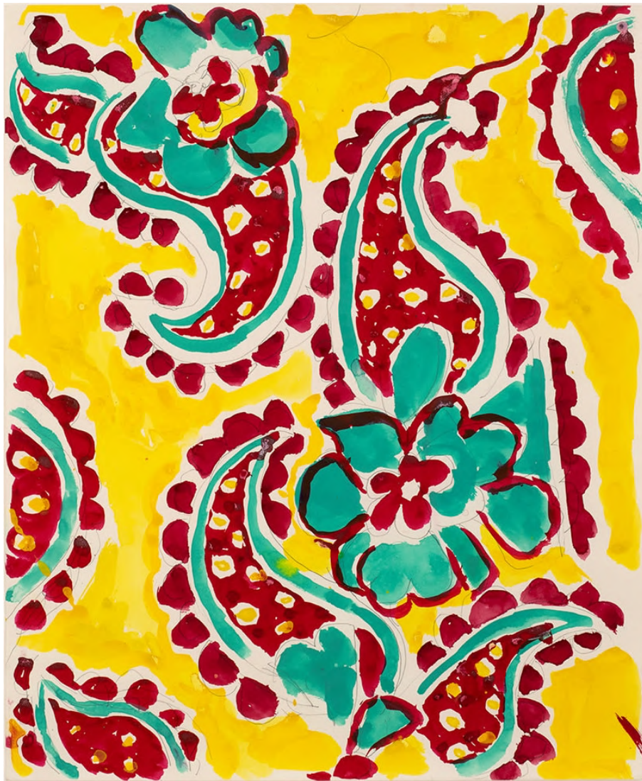
Paisley on Yellow, 2020 watercolor and graphite on paper, 17 x 14 inches