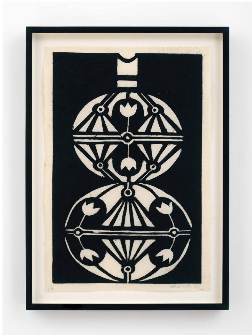
Hyoutan Bottle with Small Tulips, 2020 relief print on handmade Japanese paper, 19 1/4 × 13 inches, edition 1/4 + 1 AP