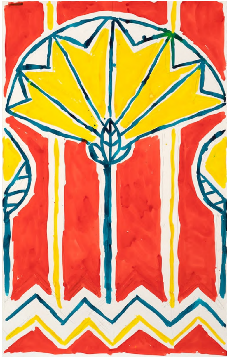
Large Red Benedictus Lotus, 2020 watercolor and graphite on paper, 48 x 30 inches