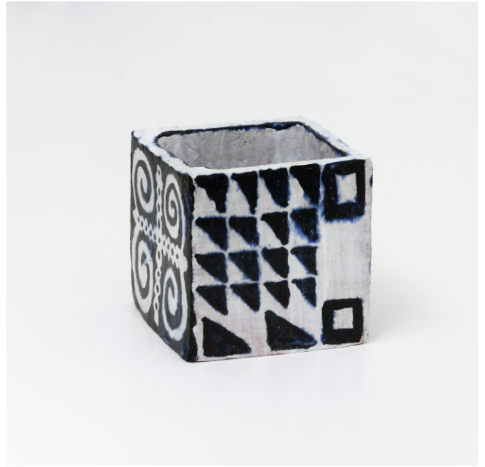
Small Planter with Curls, 2024 glazed earthenware, 4 1/2 x 4 3/4 x 4 1/2 inches