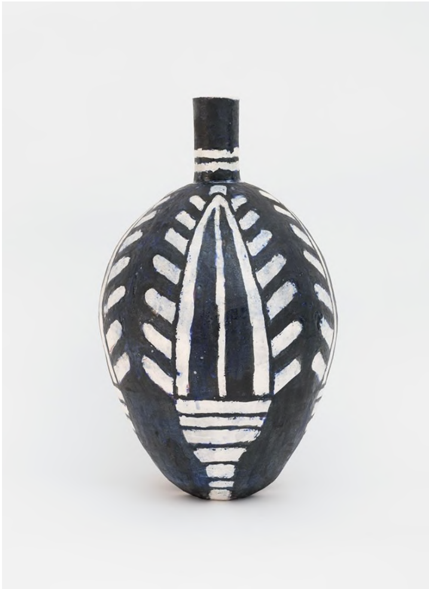
Simple Tree, 2023 glazed earthenware, 20 × 12 × 12 inches