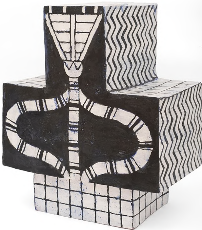
Lotus and Water , 2021 glazed earthenware, 21 × 17 × 11 inches