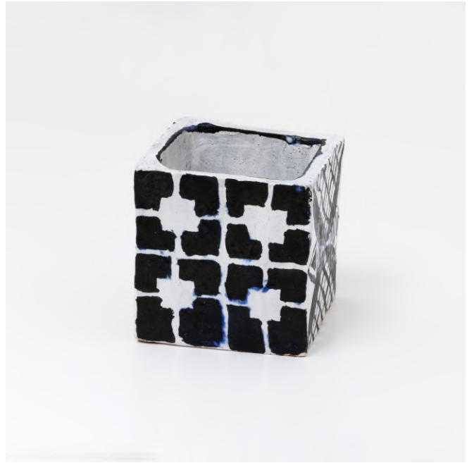
Small Planter with Crossed Petals and Arrows, 2024 glazed earthenware, 4 3/4 x 5 1/2 x 4 1/2 inches