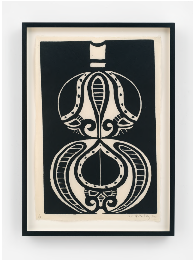
Hyoutan Bottle with Horizontal Lines , 2020 relief print on handmade Japanese paper, 19 1/4 × 13 inches, edition 1/4 + 1 AP