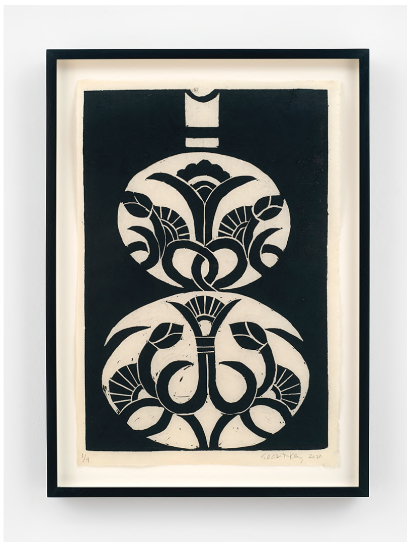
Hyoutan Bottle with Papyrus Flowers, 2020 relief print on handmade Japanese paper, 19 1/4 x 13 inches, edition 1/4 + 1 AP