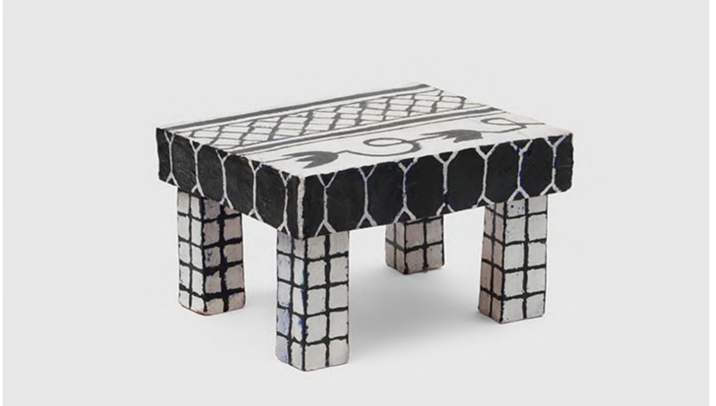
Small Egyptian Table, 2021 glazed earthenware, 12 1/2 x 10 1/4 x 7 1/2 inches