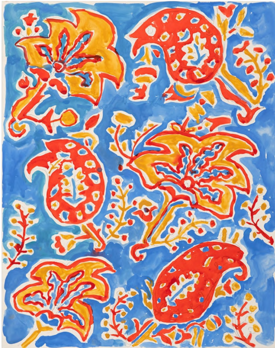
Blue Background, Red and Gold, Greek, 2020 watercolor and graphite on paper, 24 x 19 inches