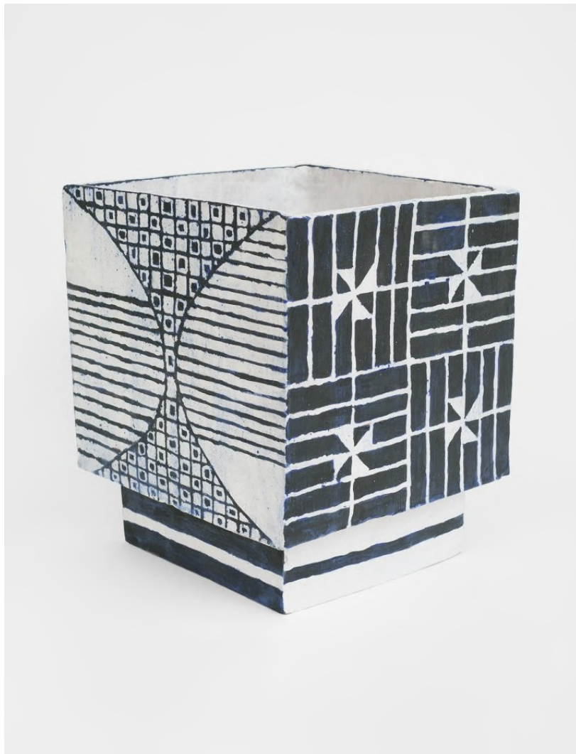
Planter with Stars, 2024 glazed earthenware, 15 1/2 x 13 x 12 3/4 inches