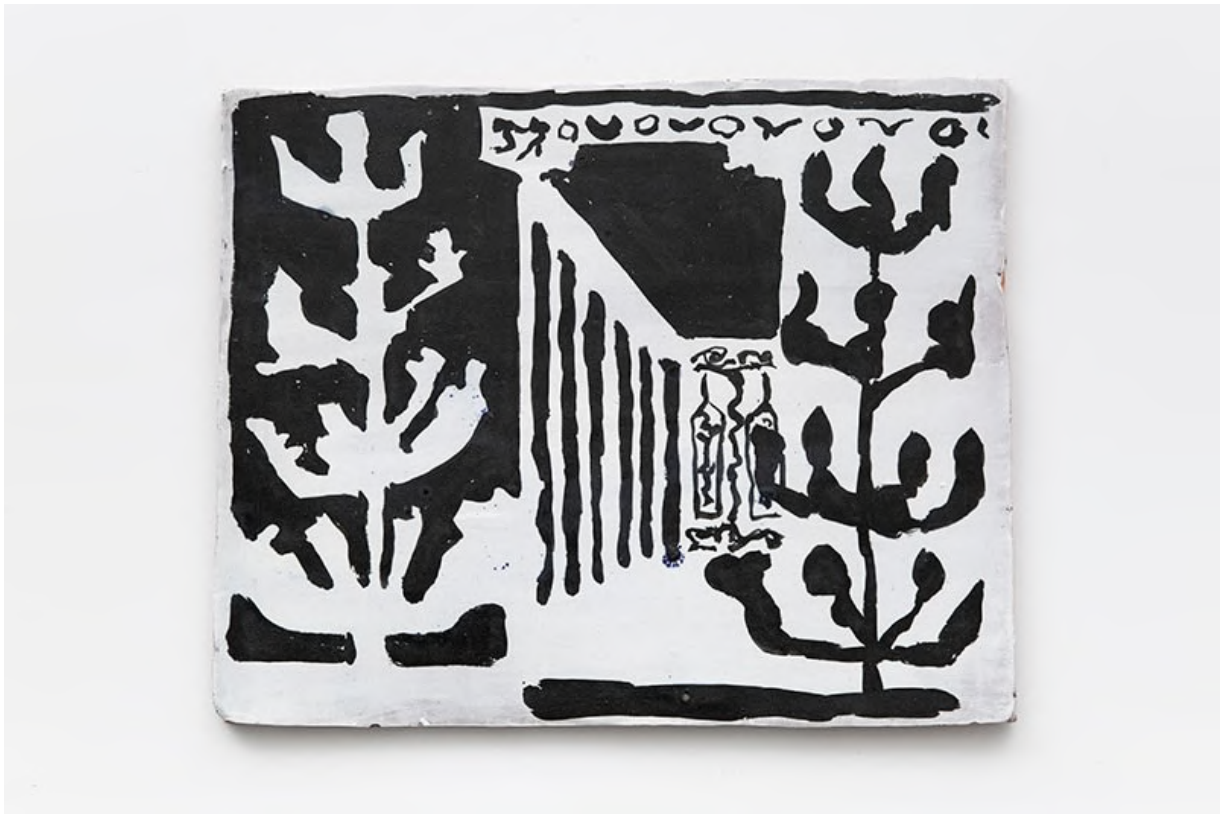
Trees in Uzbekistan, 2018 glazed earthenware, 12 x 15 inches