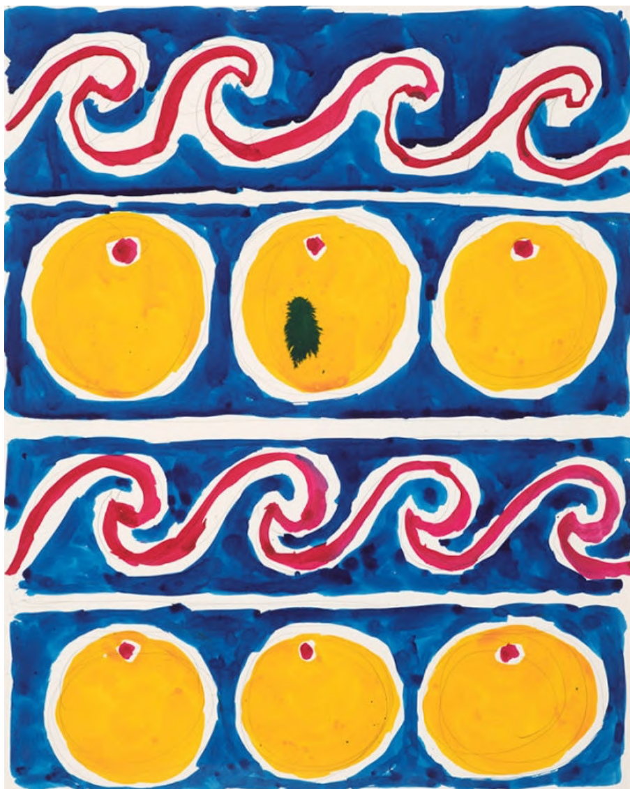
After Bakst, 2020 watercolor and graphite on paper, 24 x 19 inches