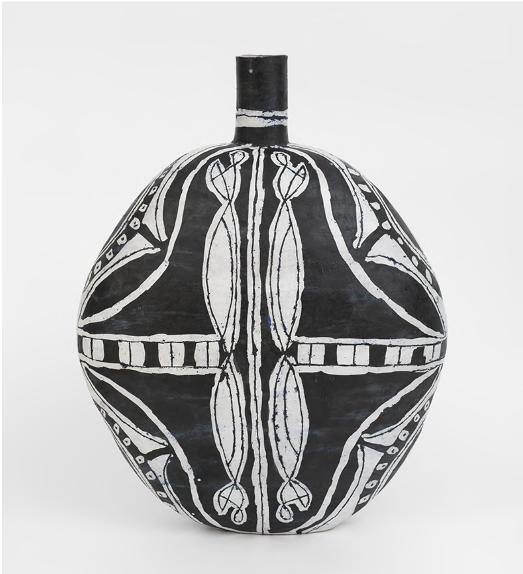
(view 2) Large Parasol Flask , 2016 glazed earthenware, 24 x 18 x 7 inches