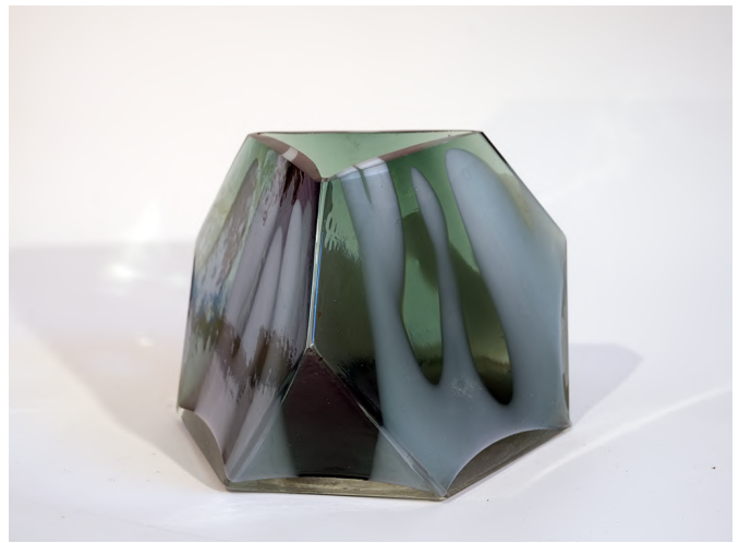
Truncated Tetrahedron-Smokey Green , 2010, mold blown glass 9 x 11 x 11 in.

Please note our current gallery hours are Friday through Monday 11 to 5, and midweek by appointment.