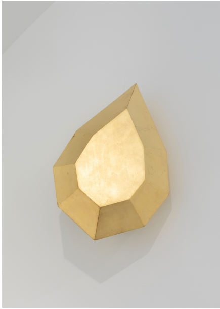
A Gold Tear for the Wall , 1996-2022 gold leaf on plywood, 22 x 11 9 1/2 inches

Reflecting recently on his fascination with astronomical concepts, the artist noted, "Dots led me to the gems. The gems led me to the stars. The stars led me to galaxies and the Universe."