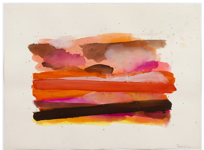
Horizontal Stripes - Reds , 1969, acrylic, pencil on paper, 22 ½ x 30 in.

In a series of horizontal abstractions made shortly after his Montauk stay, broad swathes of color suggest the lingering influence of the region's sweeping horizons and dramatic skies. Dotted over the brushwork, reflective pencil marks transcend any inference of landscape, while inevitably shimmering like stars. Nearby, two bold compositions feature hard-edged shapes softened by curvilinear contours, Torreano's early experiments with the potential of a two-dimensional picture plane to convey bulging form.