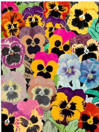
Flowers , 1970, collage

Joe Brainard is celebrated for his small-scale collages and works on paper. Although most closely identified with the New York School of painters and poets, he also knew Andy Warhol well and considered him – along with Willem de Kooning – among his favorite artists. Brainard's works are often witty, and in contrast to the cool detachment of much of the Pop art of the period, many of his collages convey an endearing tenderness. His work combines technical mastery and a natural gift for composition with endless invention and imagination.