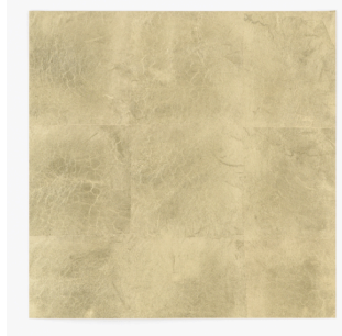
Stephen Antonakos, Field C , 2011 German gold leaf on mylar 20 7/8 x 17 7/8 in