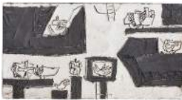
A26 , c. 1962 graffitos 14 1/8 x 26 3/4 x 5/8 inches (CN9164)