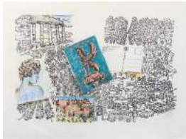
Delphi, Greece, 1978 ink and pastel on paper 21 7/8 x 29 7/8 inches authenticated by RN verso (CN9004)