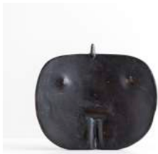
P65 , c. 1982 - 84 bronze 6 1/8 x 1 1/2 x 6 7/8 inches Ed. 1/2 unsigned (CN6589.1)