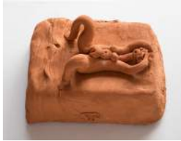
D275A , 1973 clay 5 x 7 1/4 x 9 inches signed and dated right side "Nivola 73" (CN9117)