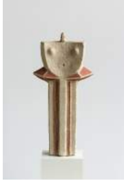
M.01 , 1969 concrete, paint 19 x 9 1/2 x 3 3/4 inches signed and dated (CN7147)