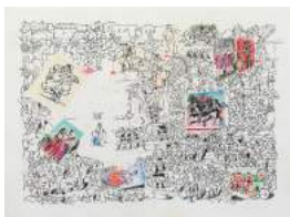
Sardinia , 1978 ink and pastel on paper 21 7/8 x 30 inches (CN9008)