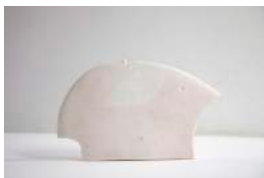
N54, 1982 marble 6 3/4 x 11 1/4 x 1 1/8 inches signed and dated verso at lower right "Nivola 1982" (CN3539)