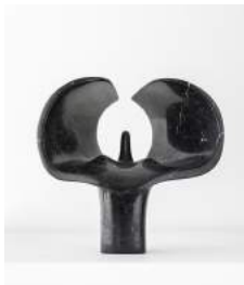
N27, 1980 marble 5 3/4 x 6 x 3 5/8 inches signed and dated lower right "Nivola 80" (CN3535)