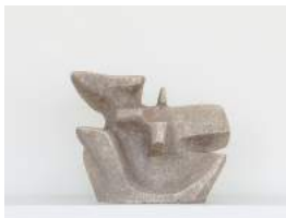
M33 , c. 1950s concrete 16 5/8 x 14 3/16 x 10 9/16 inches unsigned (CN5981)