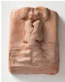
D74 , 1971 clay 5 x 9 x 8 inches signed and dated "Nivola 1971" (CN9116)