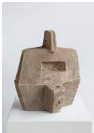
M41 , c. 1950s concrete 16 1/2 x 15 x 11 inches no signature (CN5977)