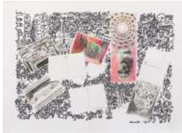
Rome, Italy, 1978 ink and pastel on paper 21 7/8 x 30 inches signed & dated (CN9007)