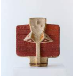
M.02 , 1965 concrete, paint 13 3/4 x 12 x 7 inches signed and dated (CN7419)