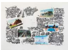
Driving to Long Island , 1978 ink and pastel on paper 21 7/8 x 30 inches (CN9005)