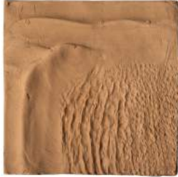
C23 , 1962 clay 16 7/8 x 17 x 1 5/8 inches 19 1/2 x 19 1/2 x 2 inches framed signed and dated lower right (CN7031)