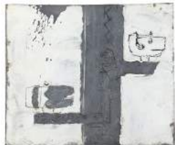
A6 , c. 1962 graffitos 20 1/8 x 24 1/4 x 3/4 inches (CN9159)