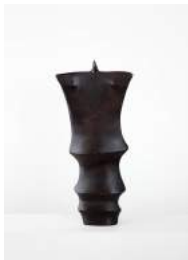
P68 , 1982 bronze 7 3/4 x 3 3/8 x 1 inches Ed. 1/7 signed and dated verso (CN9167.1)