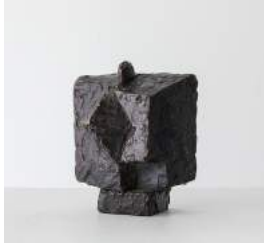
P31 (Architectures) , 1981 bronze 3 7/8 x 3 1/4 x 1 3/4 inches signed/dated verso lower right "Nivola 1911-81" (CN3153)