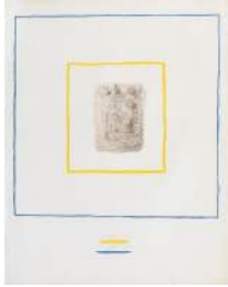
C7, 1963 lithograph 28 7/8 x 22 7/8 inches Ed. 19/127 signed, dated & editioned (CN9013.19)