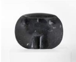
N31, 1980 marble 5 3/8 x 5 3/8 x 3 3/4 inches signed and dated lower back "Nivola 80" (CN3537)