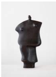
P67, 1982 bronze 8 3/4 x 4 3/8 x 1 1/8 inches Ed. 2/7 signed and dated verso (CN9166.2)