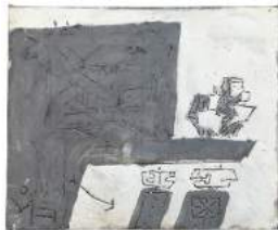
A7 , c. 1962 graffitos 20 1/8 x 24 1/4 x 3/4 inches (CN9160)