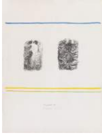
C2, 1963 lithograph 28 7/8 x 23 1/8 inches Ed. 19/125 signed & editioned (CN9012.19)