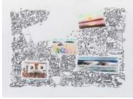
Long Island, New York, 1978 ink and pastel on paper 21 7/8 x 30 inches (CN9009)