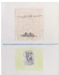
C3, 1963 lithograph 28 3/8 x 22 7/8 inches Ed. 19/116 signed & editioned (CN9011.19)