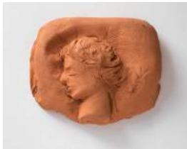
D135 , 1978 clay 3 x 7 x 6 inches signed and dated "Nivola 78" in front (CN9154)