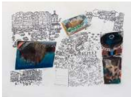
Milan, Italy, 1978 ink and pastel on paper 21 7/8 x 29 7/8 inches authenticated by RN verso (CN9006)