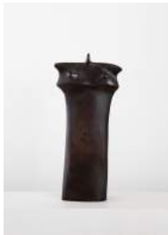
P66 , 1982 bronze 7 3/4 x 3 3/8 x 1 inches Ed. 1/7 signed and dated verso (CN9168.1)