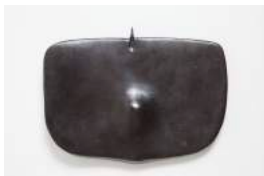
Bronze #4 , c. 1982 bronze 12 1/4 x 16 inches (CN5900)