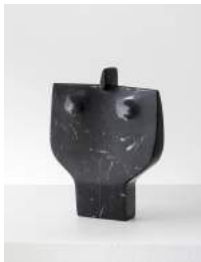
N30, 1980 marble 6 x 4 3/4 x 1 1/4 inches signed and dated lower right "Nivola 80" (CN3536)