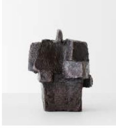
P29 (Architectures) , 1981 bronze 4 1/8 x 3 x 2 7/8 inches signed verso lower right "Nivola 1911-81" (CN3180)