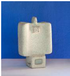
M25 , 1970 concrete 7 1/2 x 4 7/8 x 3 1/4 inches signed and dated lower left (CN9161)