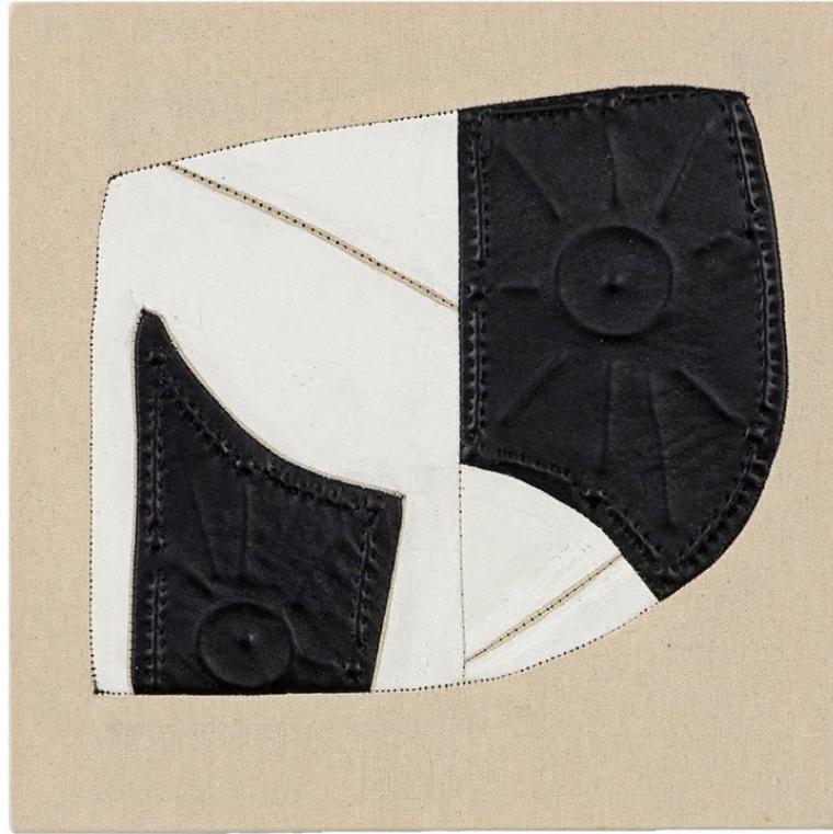
Emboss #2 , 2019, pattern parts of leather jacket, thread, string, lentils, canvas, gesso, 13 x 13 inches