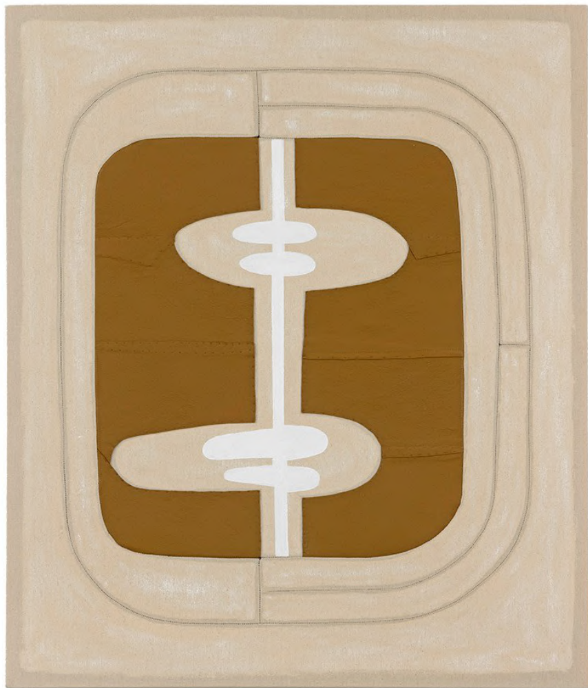
Double , 2024, altered pattern parts of leather pants, thread, canvas, gesso, 42 x 36 inches