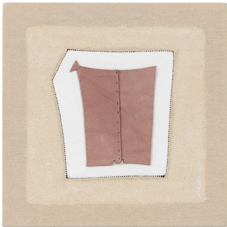
That Something Extra , 2023, remnant of leather garment, thread, canvas, gesso, 13 x 13 inches