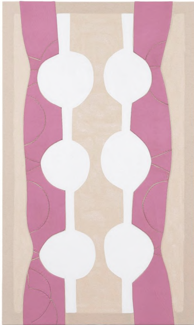
Pearlybones , 2023, pattern parts of leather dress, thread, canvas, gesso, 60 x 36 inches