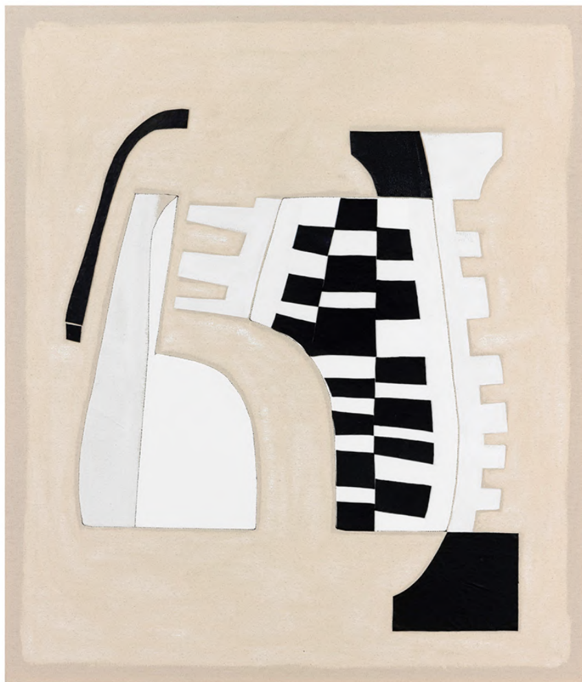
Filletted , 2023, pattern part of leather pants in 16 pieces, remnants, thread, canvas, gesso, 42 x 36 inches