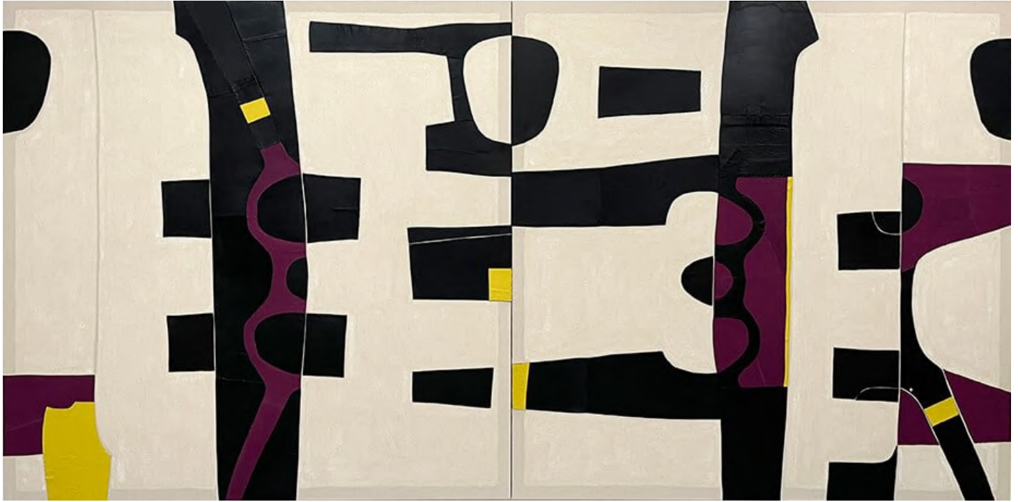
To the Bone Doctor , 2025, pattern parts and remnants of leather garments, thread, canvas, gesso, 72 x 144 x 1 ½ inches