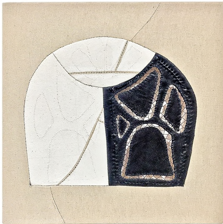
Insert , 2019, pattern part of leather jacket, thread, canvas, gesso, 13 x 13 inches