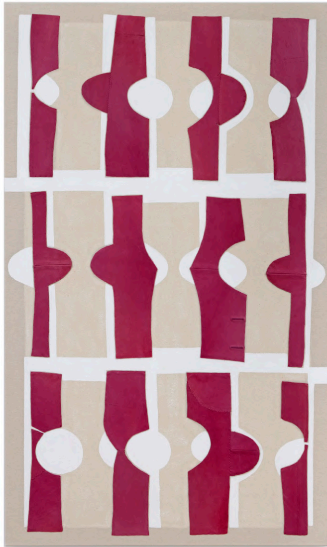
Betweened , 2023, altered pattern parts of leather jacket, thread, canvas, gesso, 60 x 36 inches