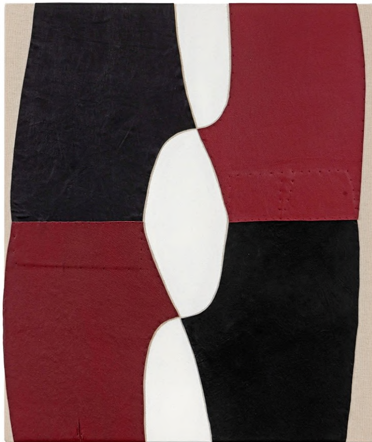
And So On , 2022, pattern parts of leather pants, thread, canvas, gesso, 24 x 20 inches