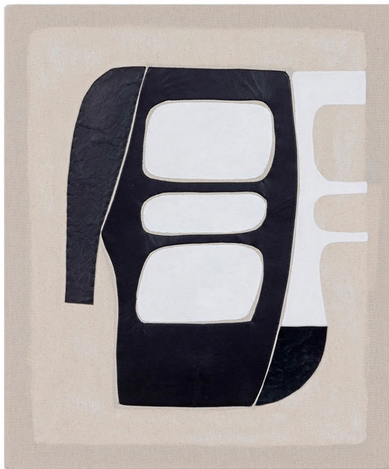
Bye Gone , 2019, altered pattern part of leather pants, remnants, thread, canvas, gesso, 24 x 20 inches