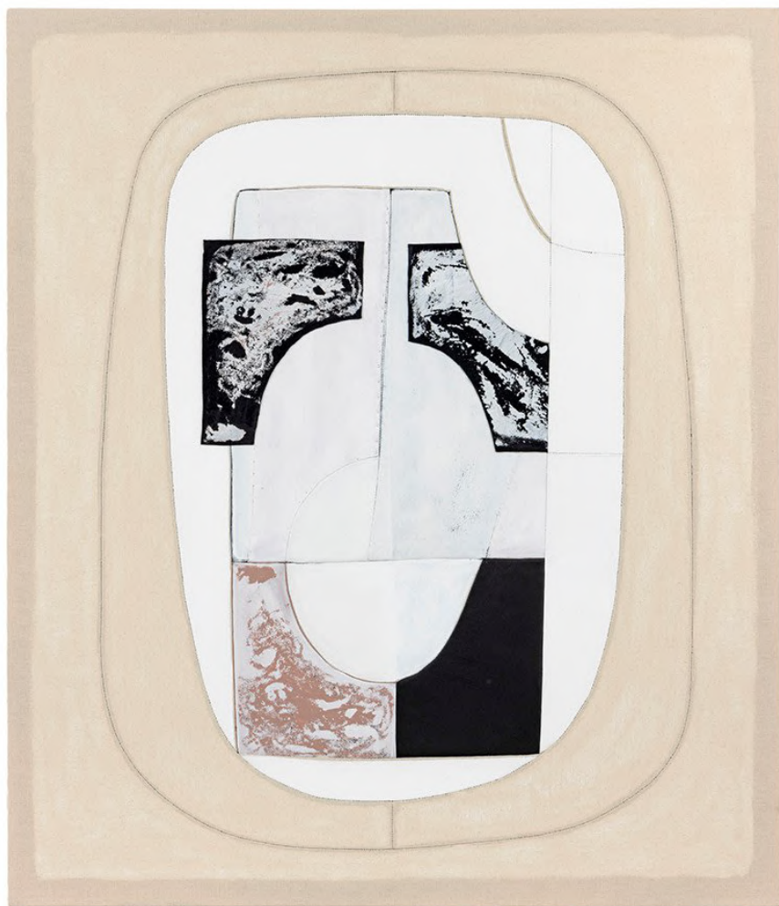
Outside Inside, 2023, altered pattern parts of leather pants, thread, canvas, gesso, 42 x 36 inches