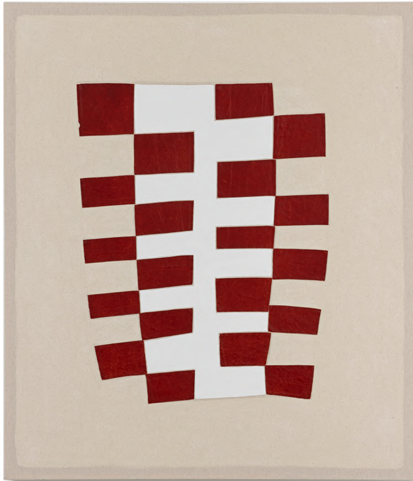
Divididee , 2022, leather skirt front in 20 pieces, thread, gesso, canvas, 42 x 36 inches