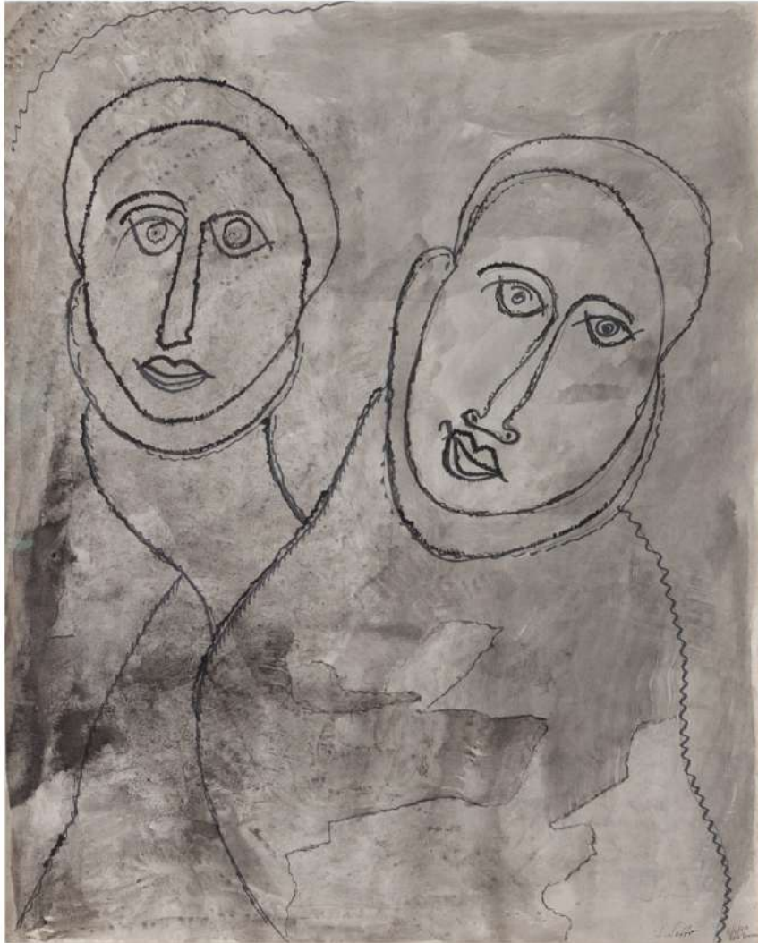
Lake Tacoma , 1983, ink and wash on paper, 29 x 23 inches