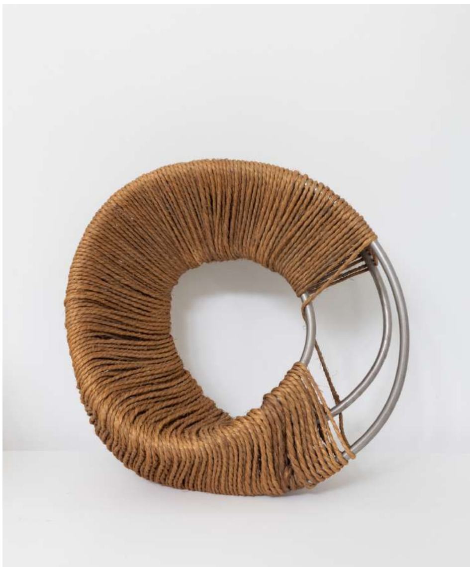
Ring Around a Rosie , 1968, stainless steel rod and rope, 17 x 17 x 5 inches