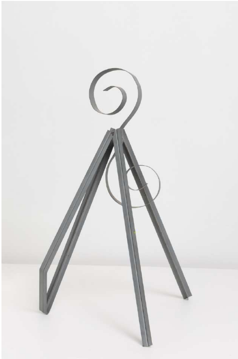
Dilly Dally (maquette), c. 1983, steel, 22 x 14 x 13 1/2 inches