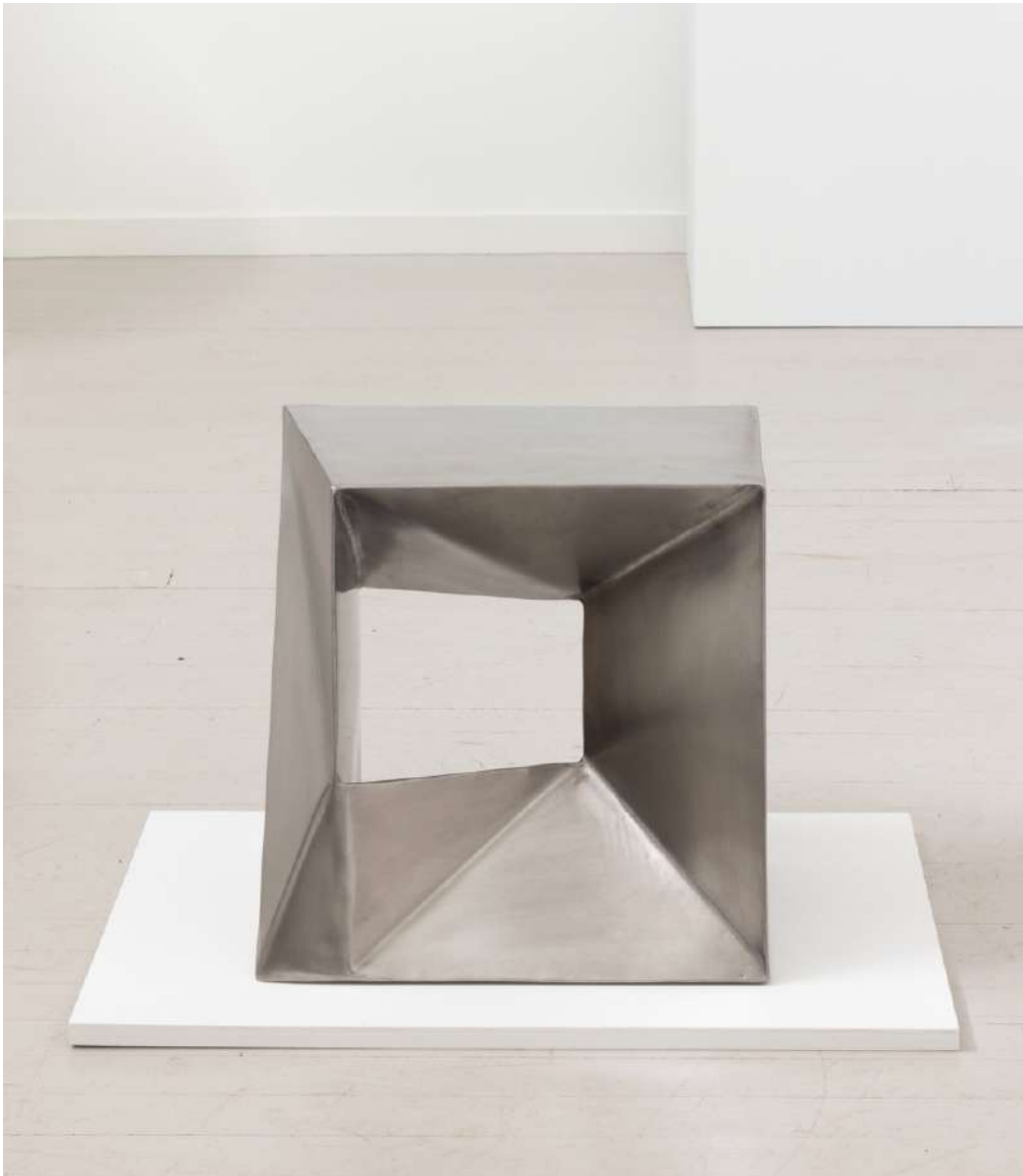
Untitled, 1971, stainless steel, 15 1/4 x 16 1/2 x 12 inches