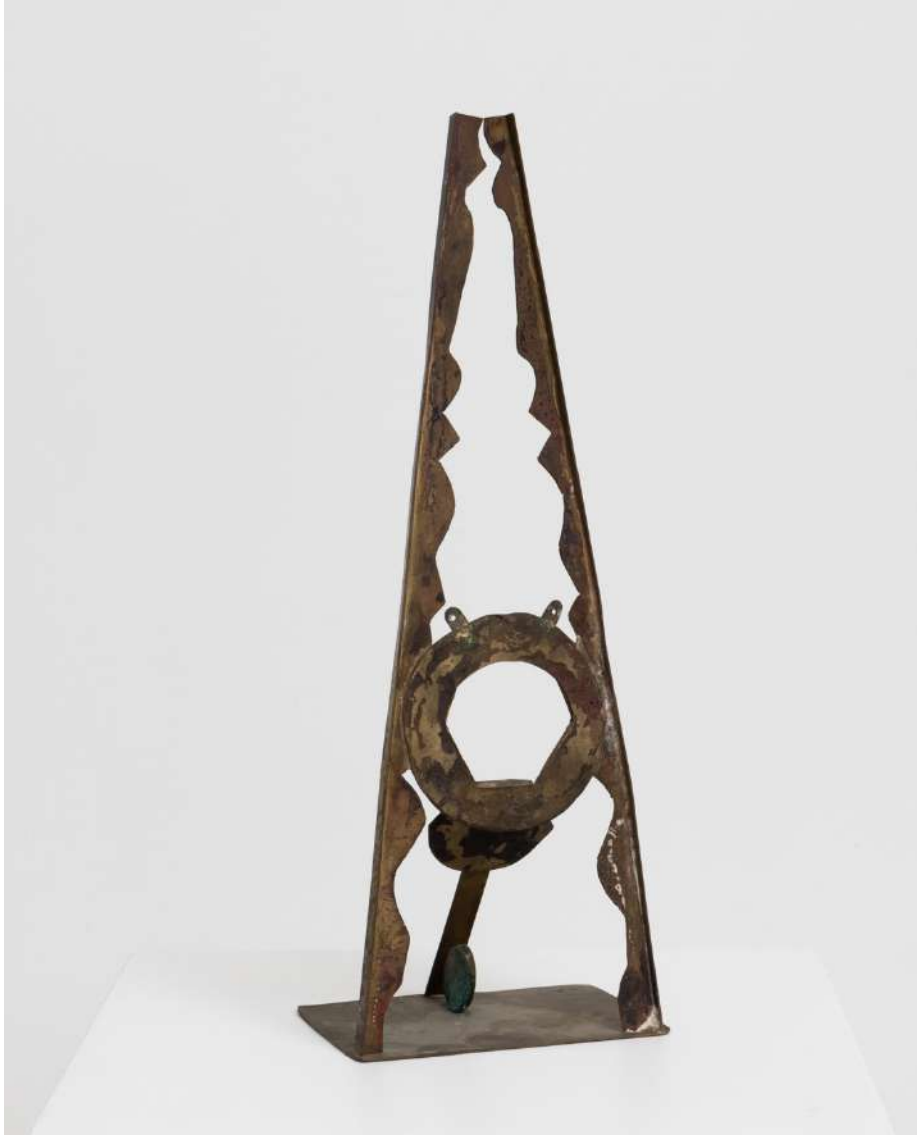
Miss Pie in the Sky (maquette) , c. 1984, brass, 11 3/4 x 4 1/4 x 3 inches