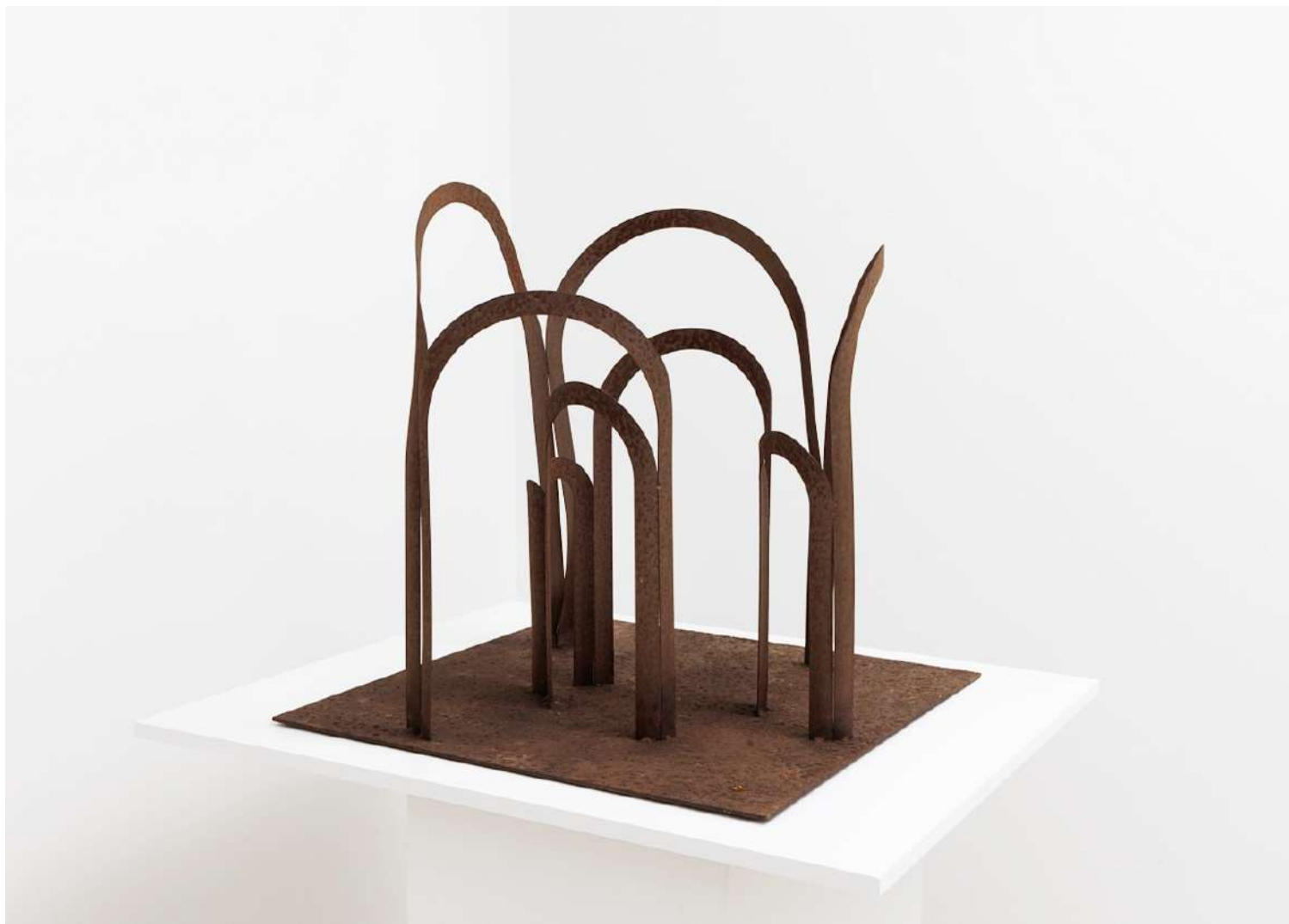
Eve (maquette) , steel, 24 x 24 x 24 inches