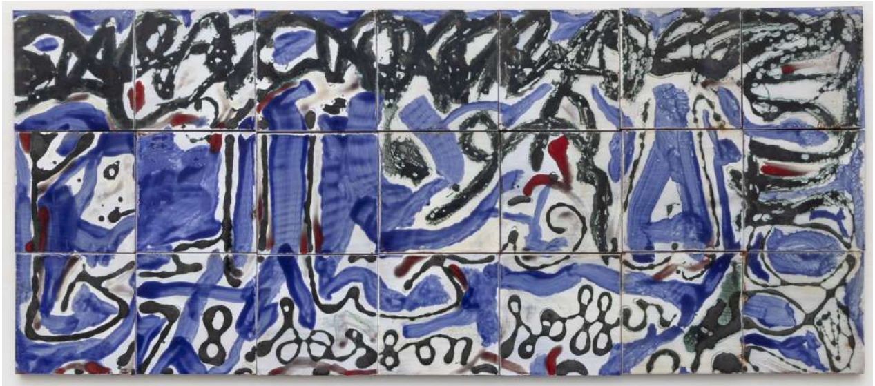
Section of tile wall, 1978, hand glazed terracotta tiles, 18 x 36 inches