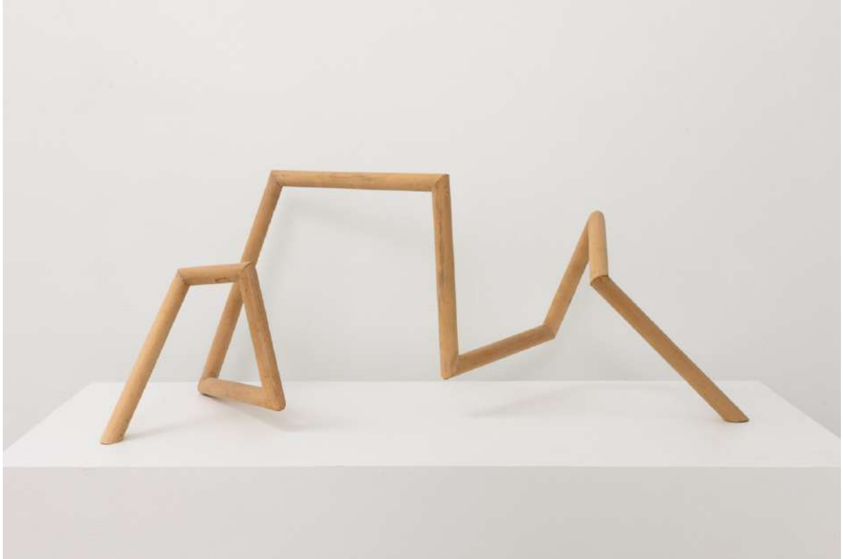
Untitled, c. 1985-88, wood, 11 1/4 x 28 1/2 x 11 1/2 inches