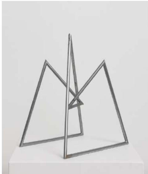
Immigrant (maquette) , c. 1979, stainless steel, 9 1/2 x 8 x 5 1/2 inches