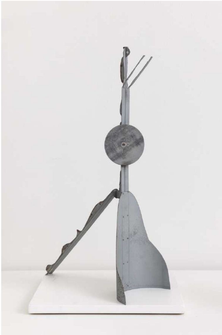
Don Quixote from the North (maquette), 1983, steel, 24 x 13 x 11 1/2 inches