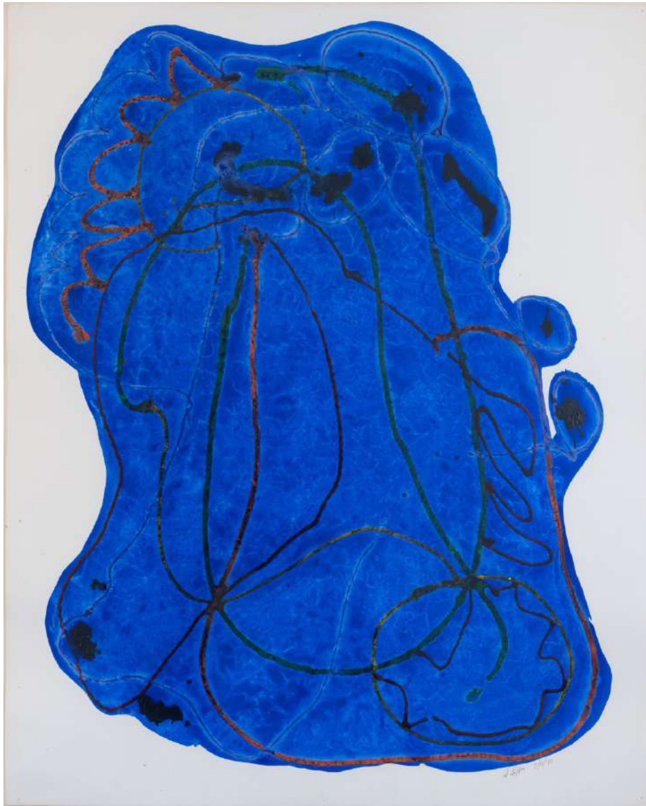
Untitled, 1980, encaustic and acrylic on paper, 39 1/2 x 32 inches