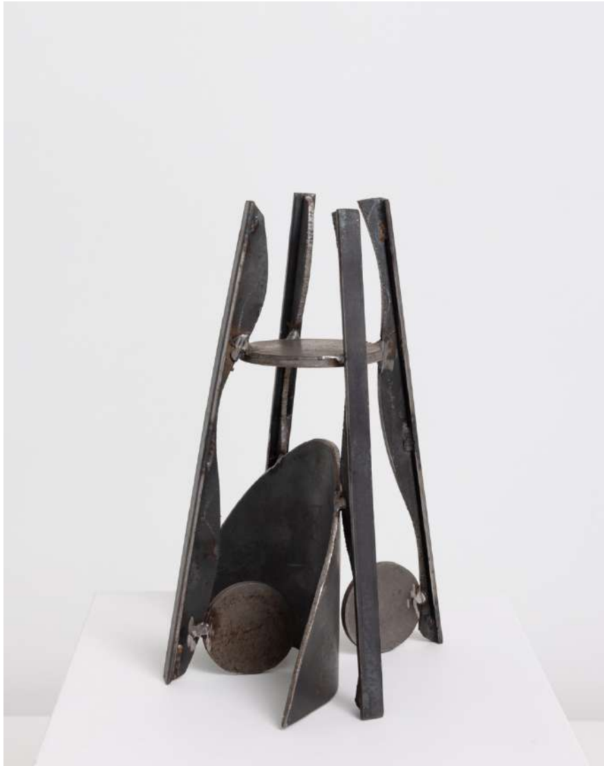
Untitled, 1970s, steel, 10 x 6 3/4 x 6 1/2 inches