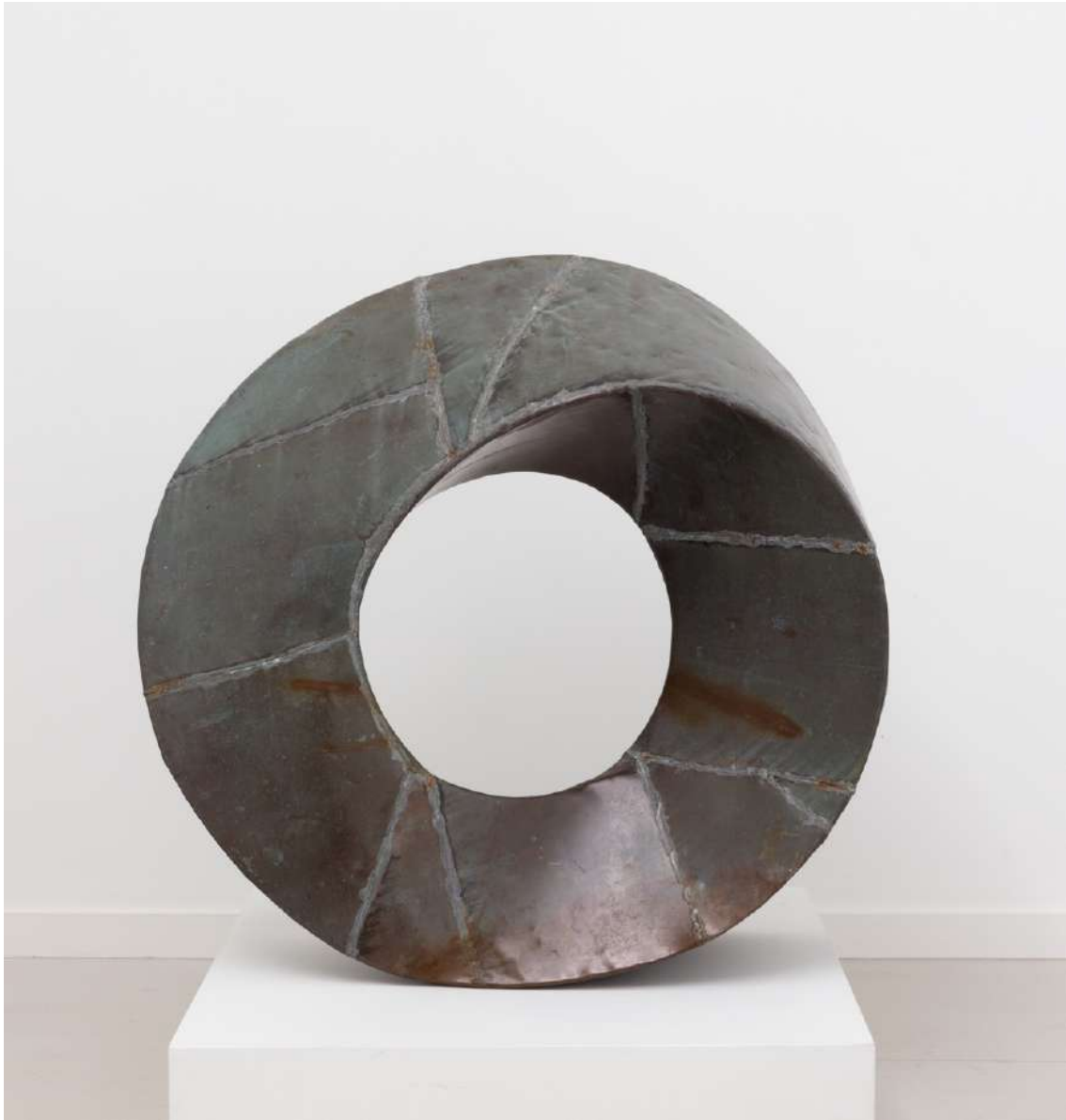
Offering (variation) , c. 1976, copper, 32 x 33 x 12 inches