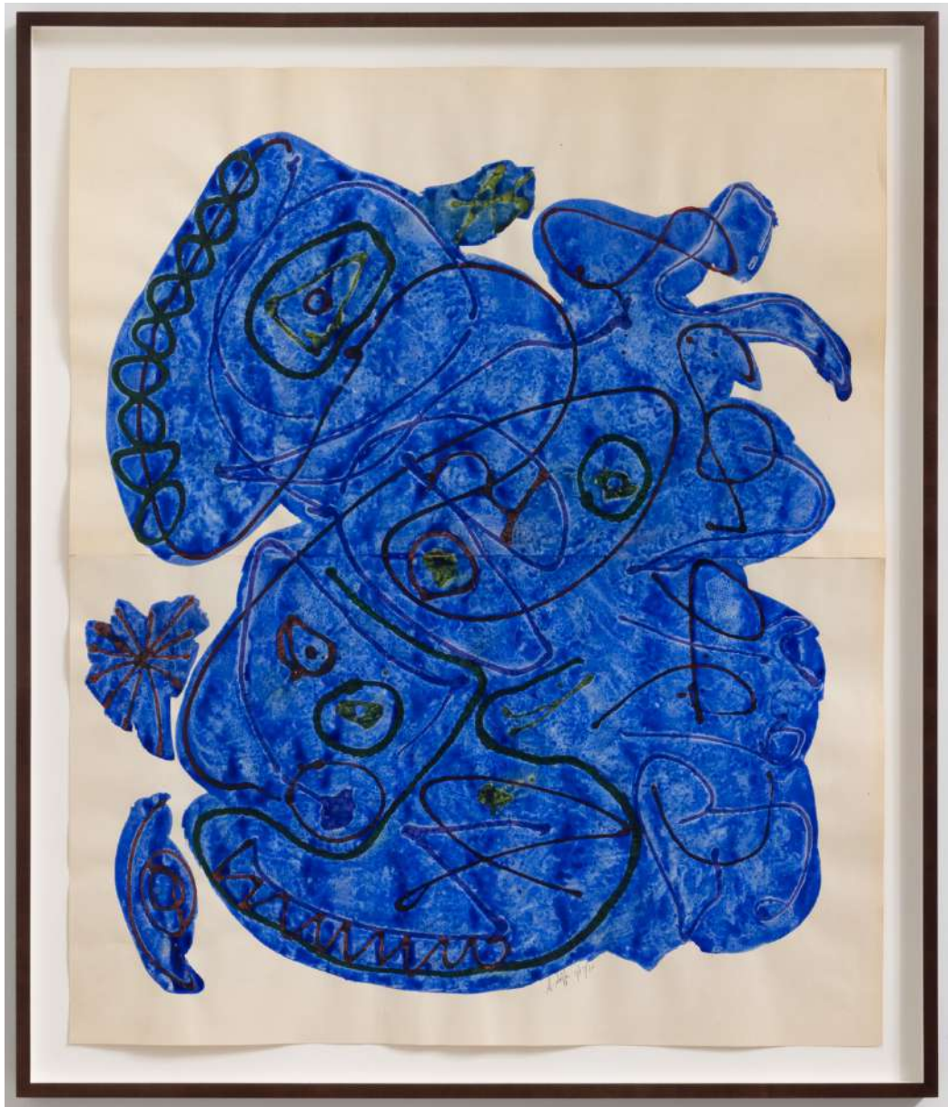
Untitled, 1980, encaustic and acrylic on paper, 42 x 35 inches