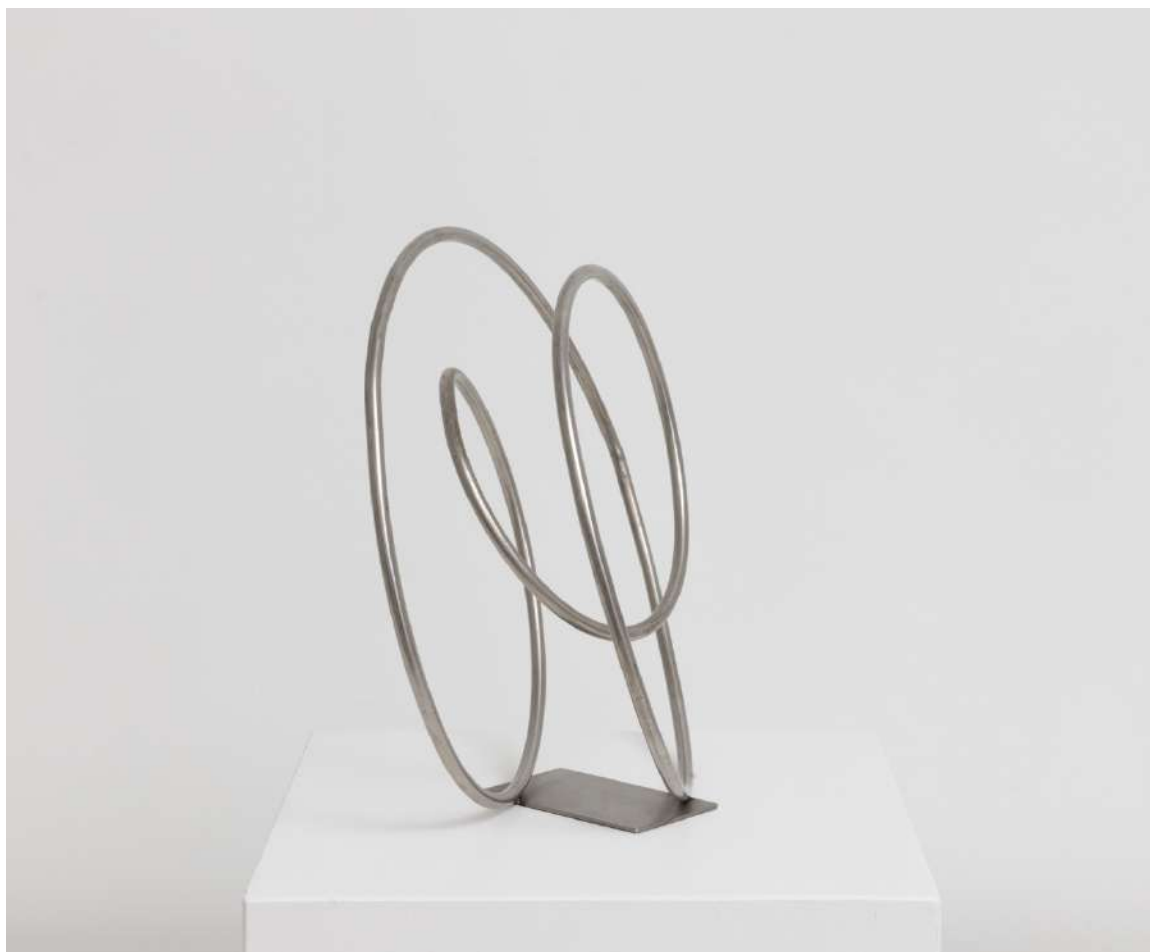
Indianapolis (maquette) , 1970, stainless steel, 9 x 9 1/2 x 4 1/2 inches