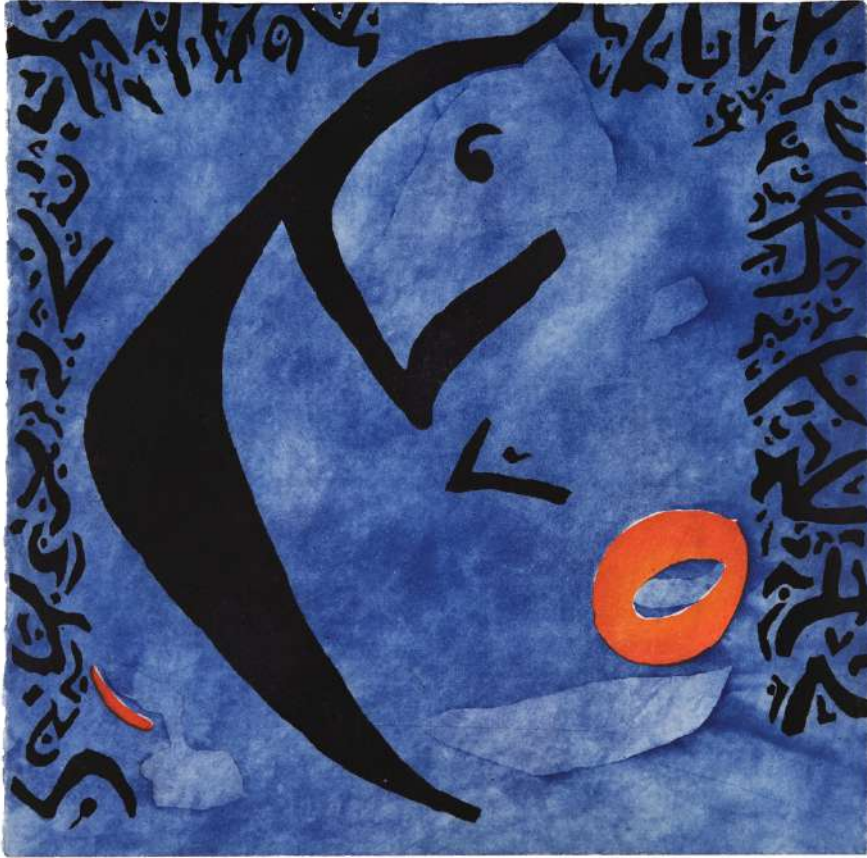
Untitled, 1980s, lithograph, 22 x 22 inches