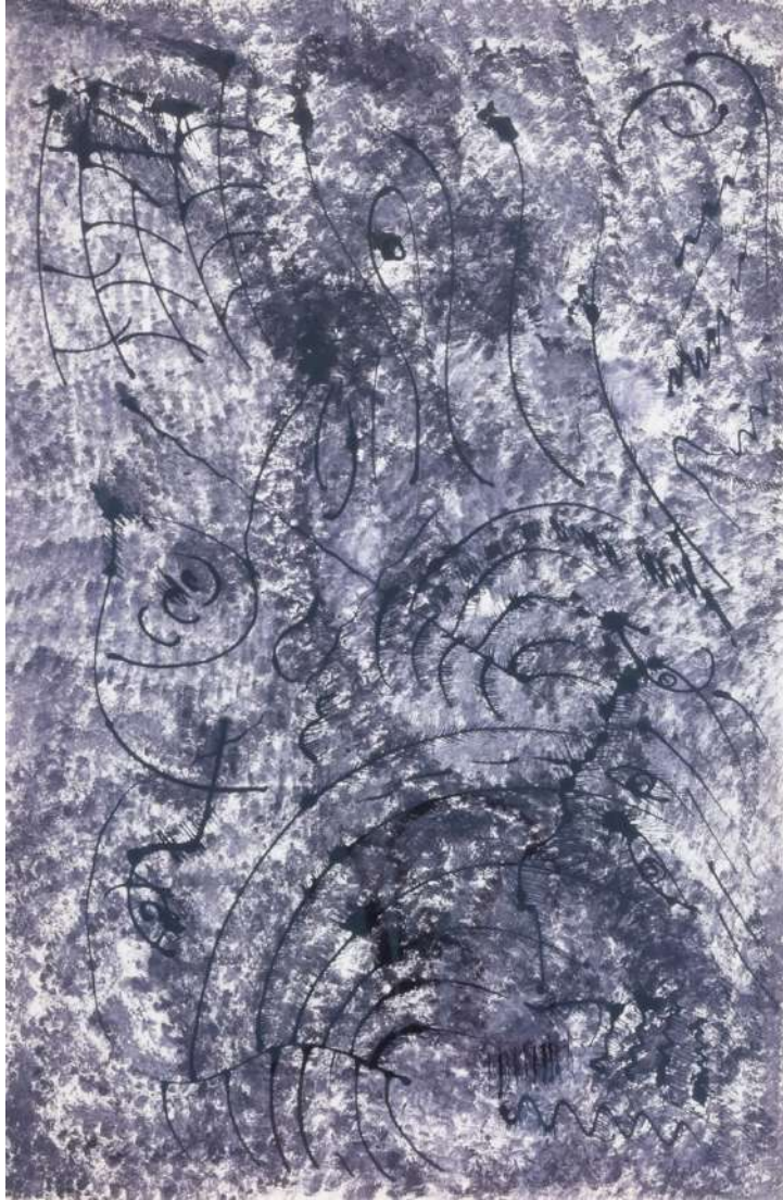
Untitled, 1978, ink and wash on paper, 34 x 23 1/2 inches