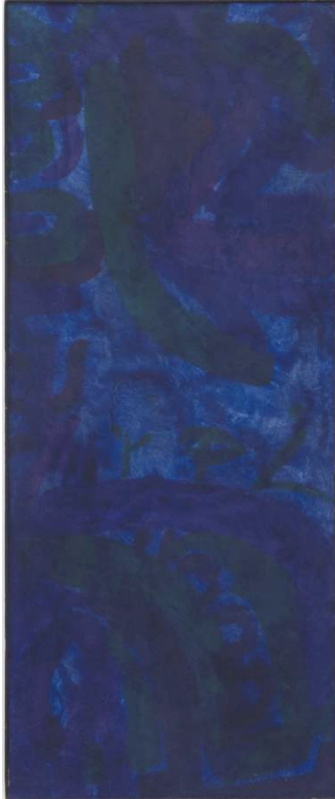
Untitled, 1961, encaustic on panel, 68 x 28 inches