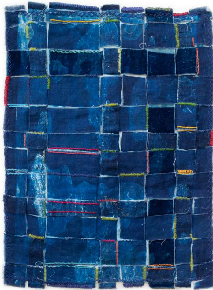
Blue Juniper, 2020 embroidered tapestry (cyanotype, linen) 15 1/2 x 11 1/2 inches $ 4,400