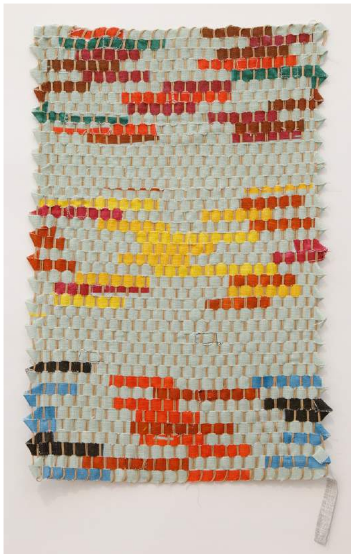
Untitled (Heilmann) , 2022 tapestry (archival pigment print, sisal, linen) 17 ½ x 11 ½ inches $ 3,800