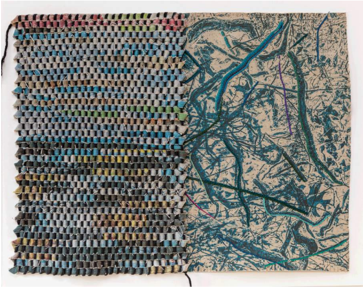
Retroactive, 2018 tapestry and embroidered archival pigment print, linen 16 1/4 x 21 1/8 inches $ 5,000