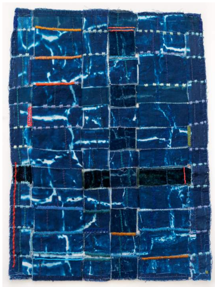
Blue Sycamore , 2020 embroidered tapestry (cyanotype, linen) 16 1/8 x 11 7/8 inches $ 4,400