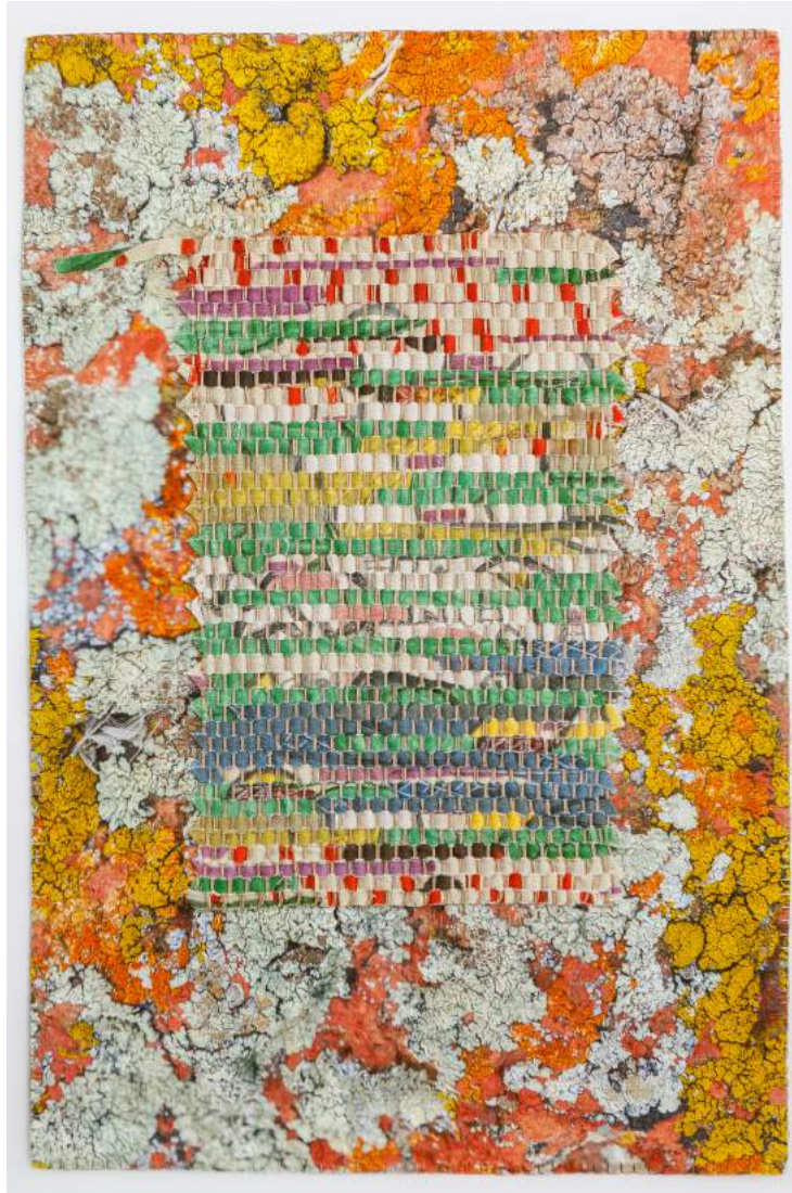
Landscape/Painting (Wyoming-Picasso) , 2022 tapestry (archival pigment print, sisal, linen) 30 x 20 inches $ 8,500