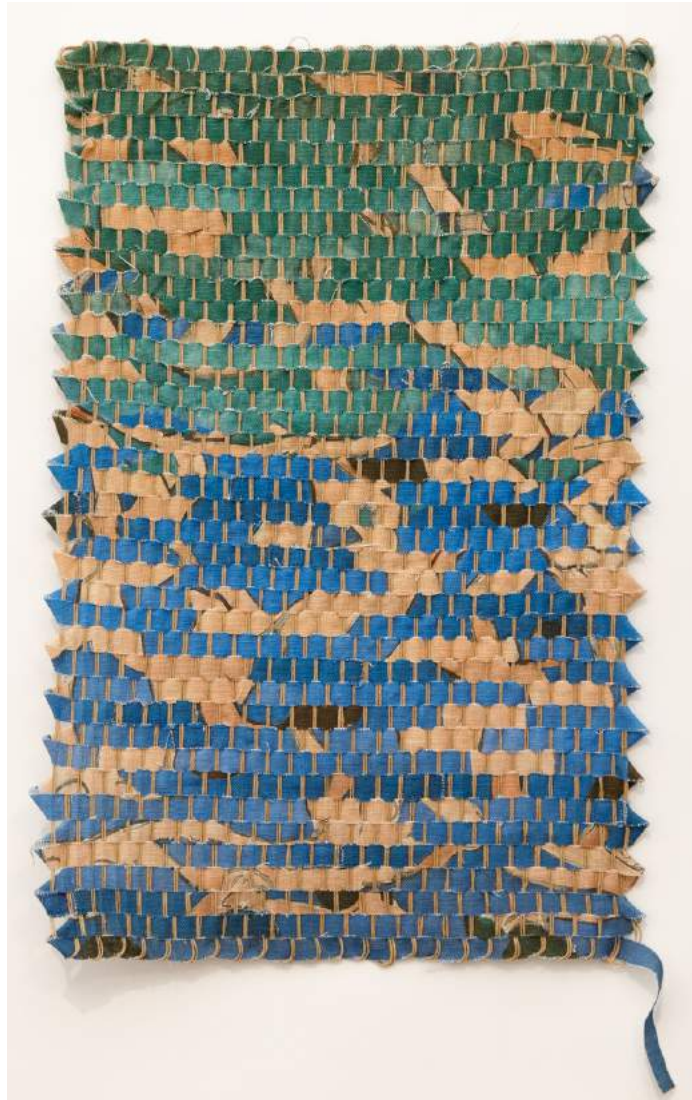
Untitled (Matisse), 2022 tapestry (archival pigment print, sisal, linen) 17 ½ x 11 ½ inches $ 3,800