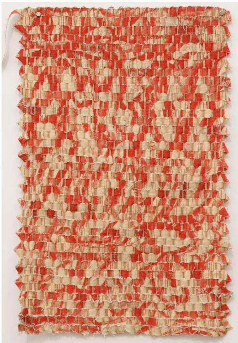
Untitled (Twombly) , 2022 tapestry (archival pigment print, sisal, linen) 17 ½ x 11 ½ inches $ 3,800