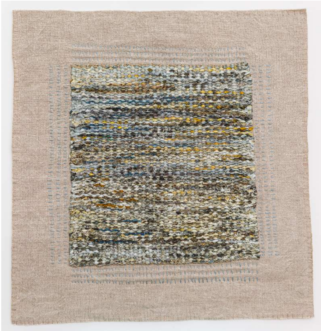
Tree Bark - 1, 2021 embroidered tapestry (archival pigment print, wool, sisal, linen) 17 x 16 1/4 inches $ 6,000