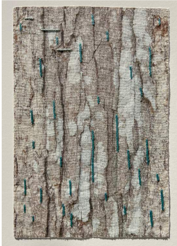
Bark/Cloth: Sag Harbor (aqua), 2016 embroidered archival pigment print on linen 17 3/4 X 12 1/2 inches $ 4,200