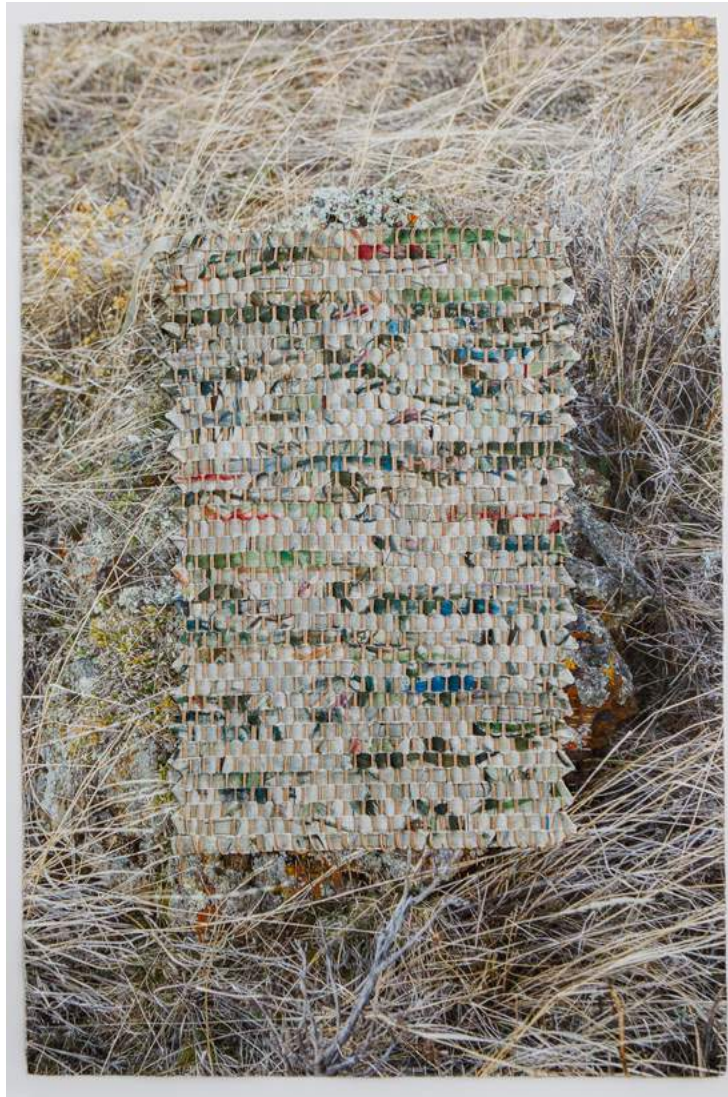
Landscape/Painting (Wyoming-Joan Mitchell), 2022 tapestry (archival pigment print, sisal, linen) 30 1/4 x 20 inches $ 8,500