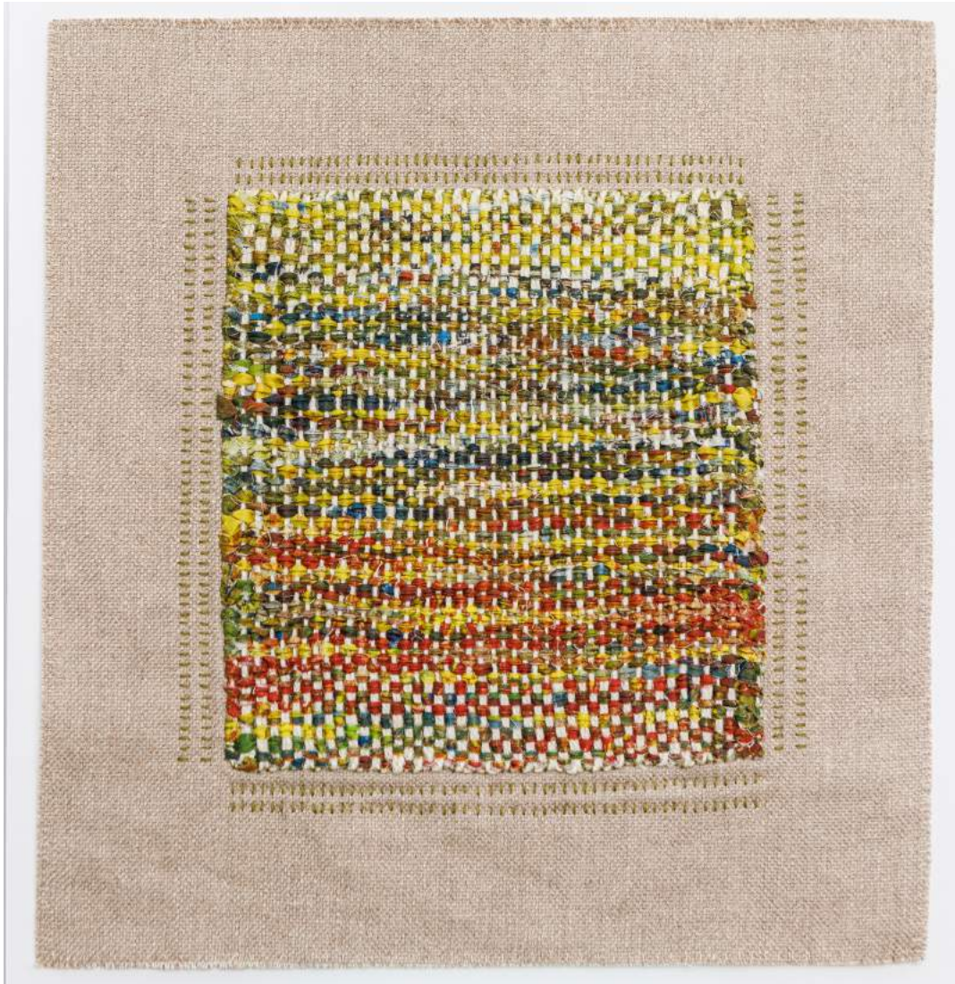
G.R./Painting, 2022 embroidered tapestry (archival pigment print, sisal, linen) 18 1/2 x 17 1/4 inches $ 6,000