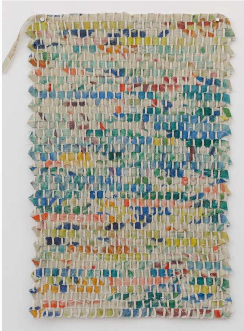
Untitled (Matisse) , 2017 tapestry (archival pigment print, cotton, linen) 17 1/2 x 11 1/2 inches $ 3,800