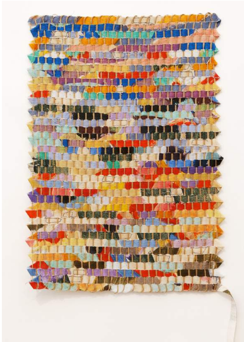
Untitled (Delaunay), 2022 tapestry (archival pigment print, sisal, linen) 17 ½ x 11 ½ inches $ 3,800