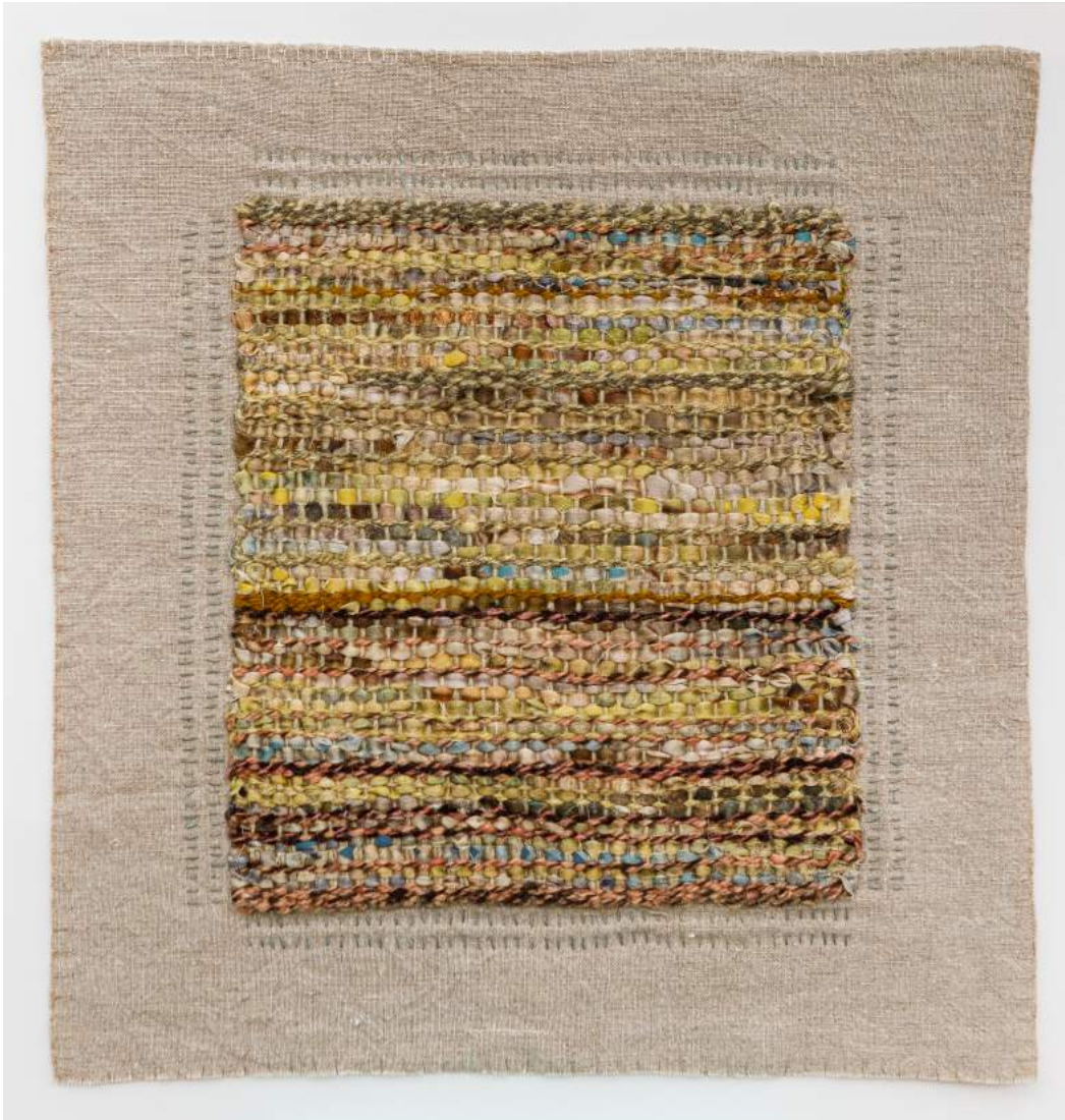
Tree Bark - 2, 2021 embroidered tapestry (archival pigment print, wool, linen) 17 x 16 1/2 inches $ 6,000