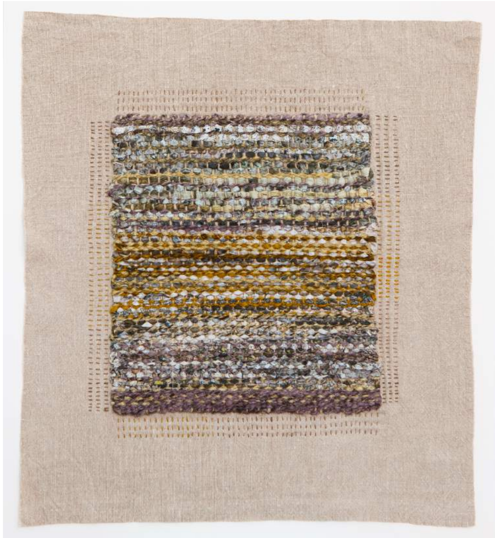
Tree Bark - 3, 2021 embroidered tapestry (archival pigment print, wool, sisal, linen) 20 x 18 inches $ 6,000