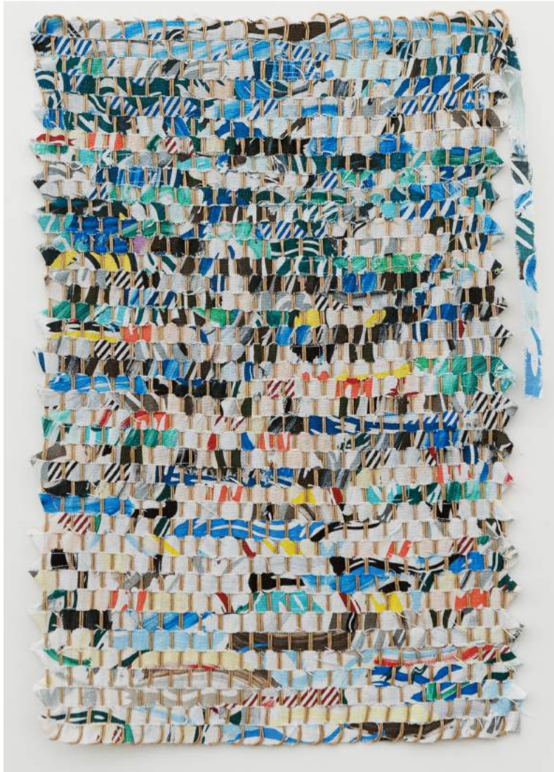
Untitled (Lichtenstein) , 2017 tapestry (archival pigment print, cotton, linen) 17 1/2 x 11 1/2 inches $ 3,800