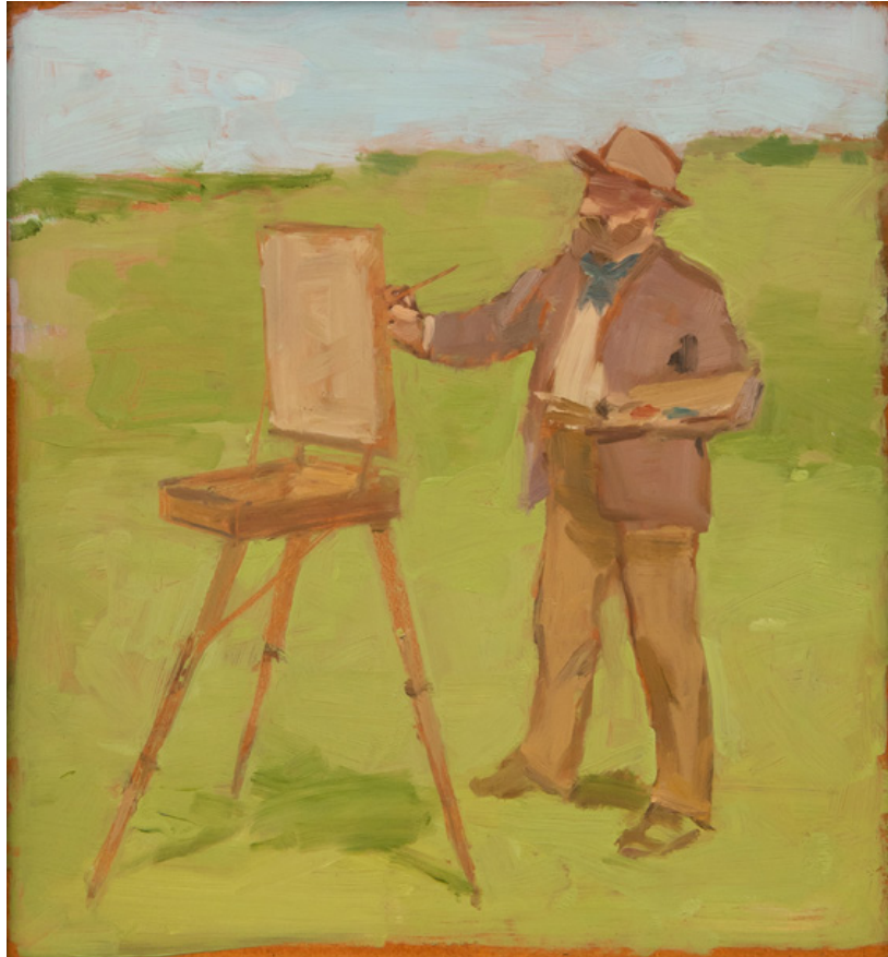
ALBERT YORK, Artist at Easel in Landscape , 1980, oil on Masonite, 12 \frac{3}{4} x 11 \frac{3}{4} inches (above)