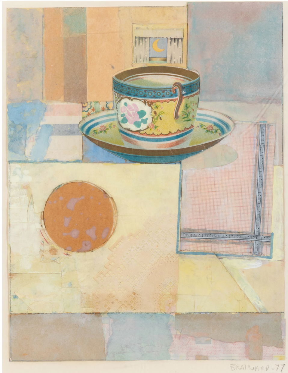
Untitled (tea cup), 1977, 14 x 11 inches