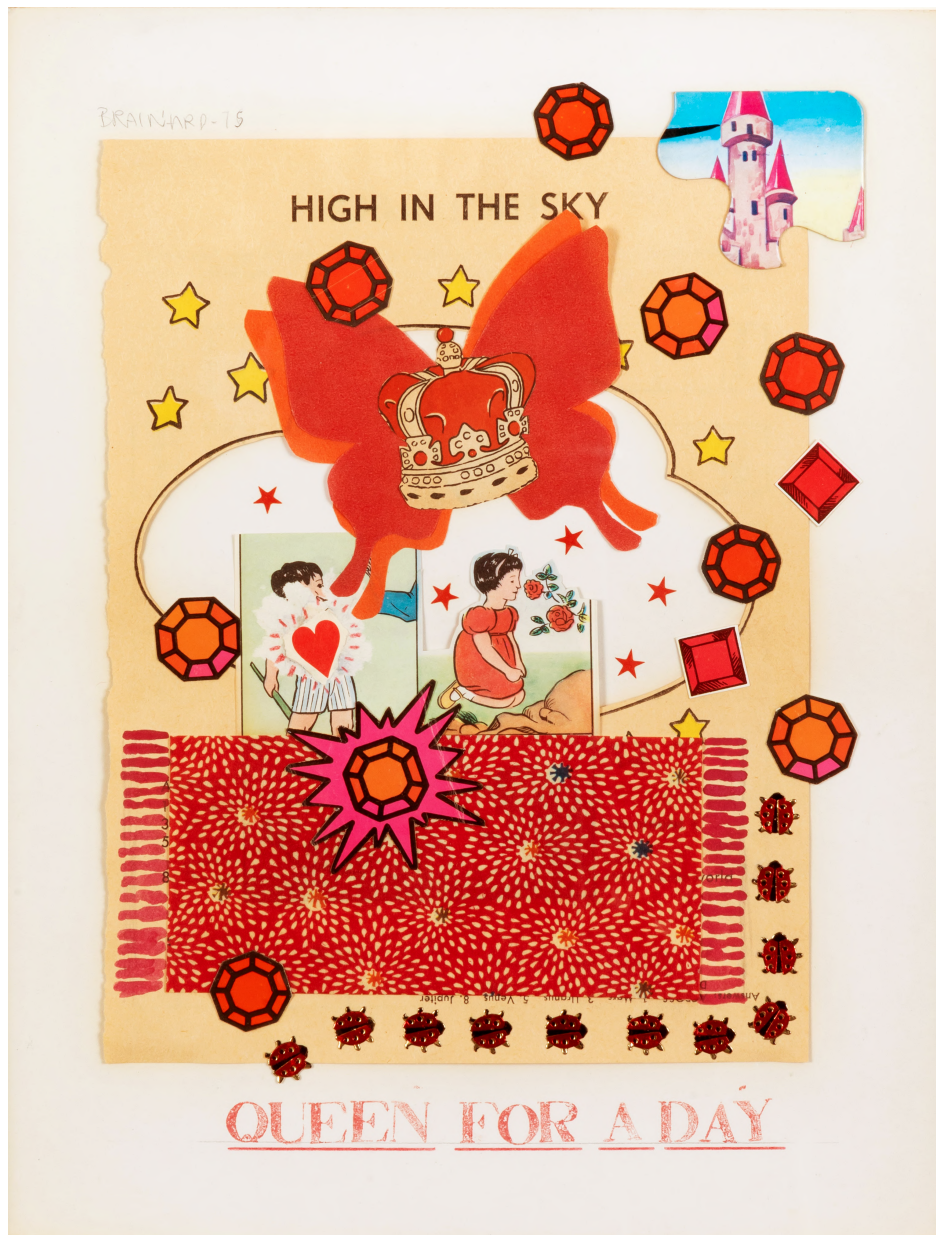
Untitled ( Queen for a Day ), 1975 13½ x 10½ inches