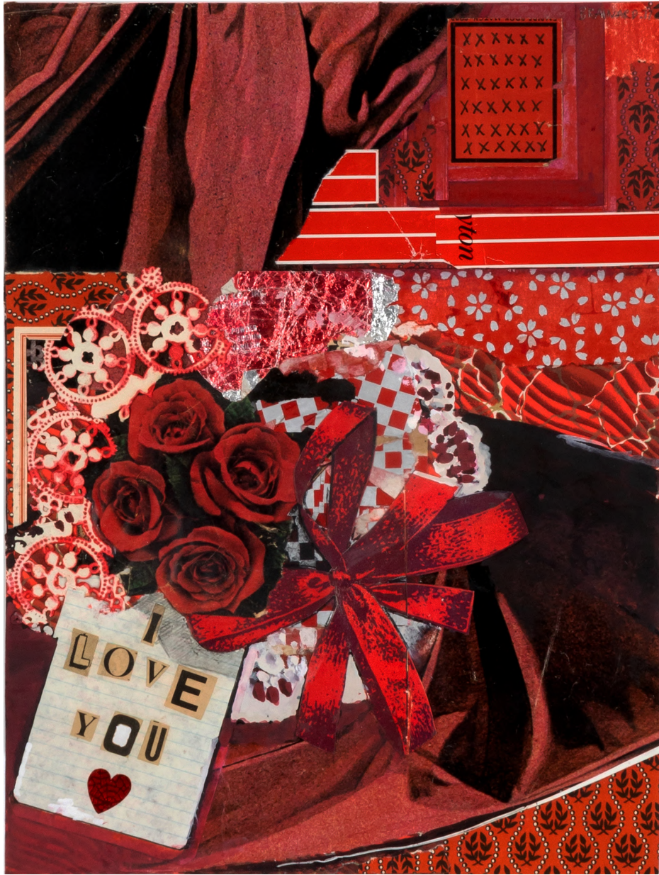
Untitled (I Love You) , 1977, 14 x 11 inches