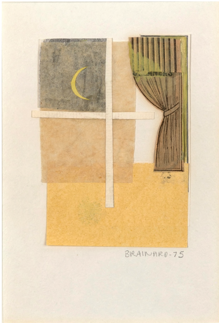
Untitled (Window with a Crescent Moon), 1975, 4 x 3 inches