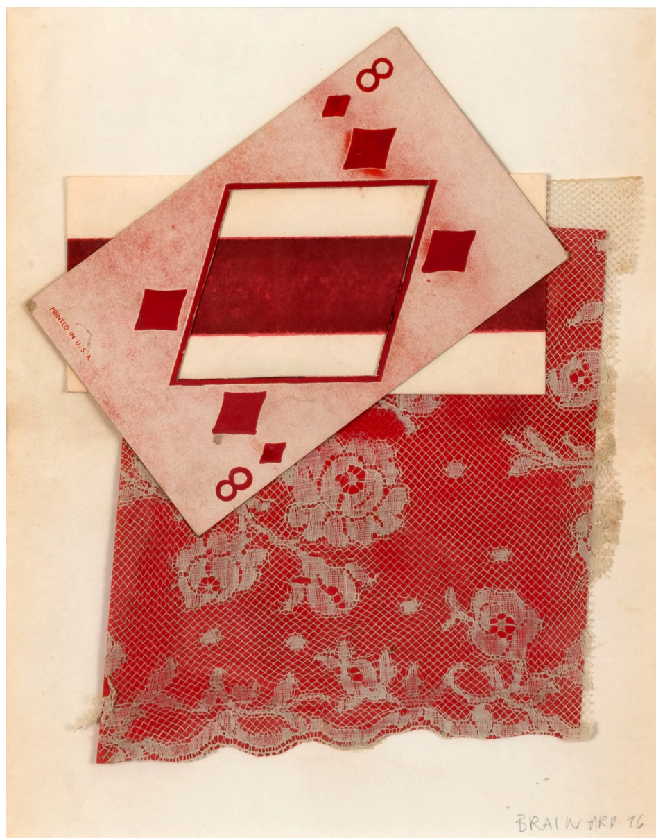
Untitled (Eight of Diamonds), 1976, 9 ½ x 7 ¾ inches