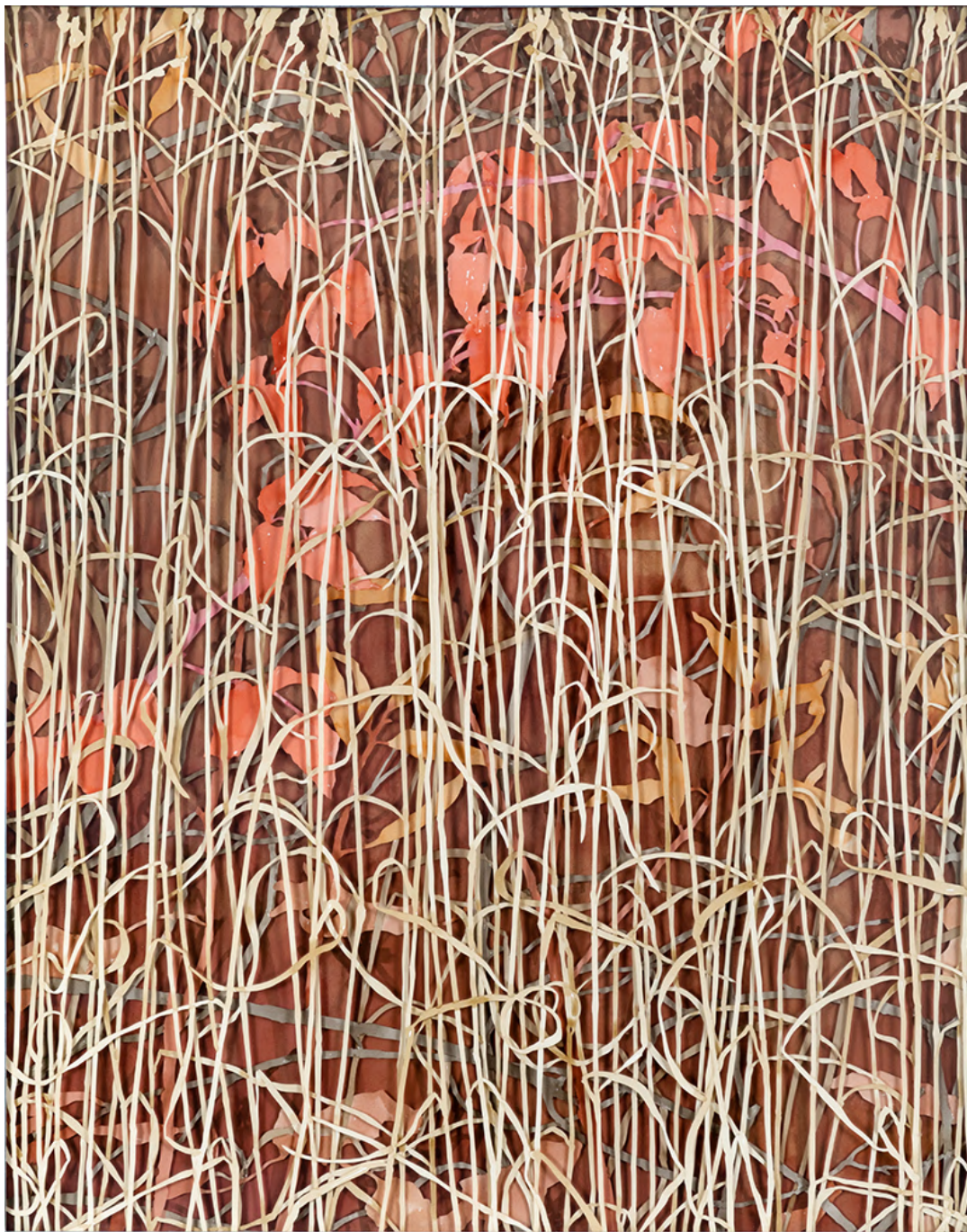
Untitled, 1970, 29 x 23 ¾ inches