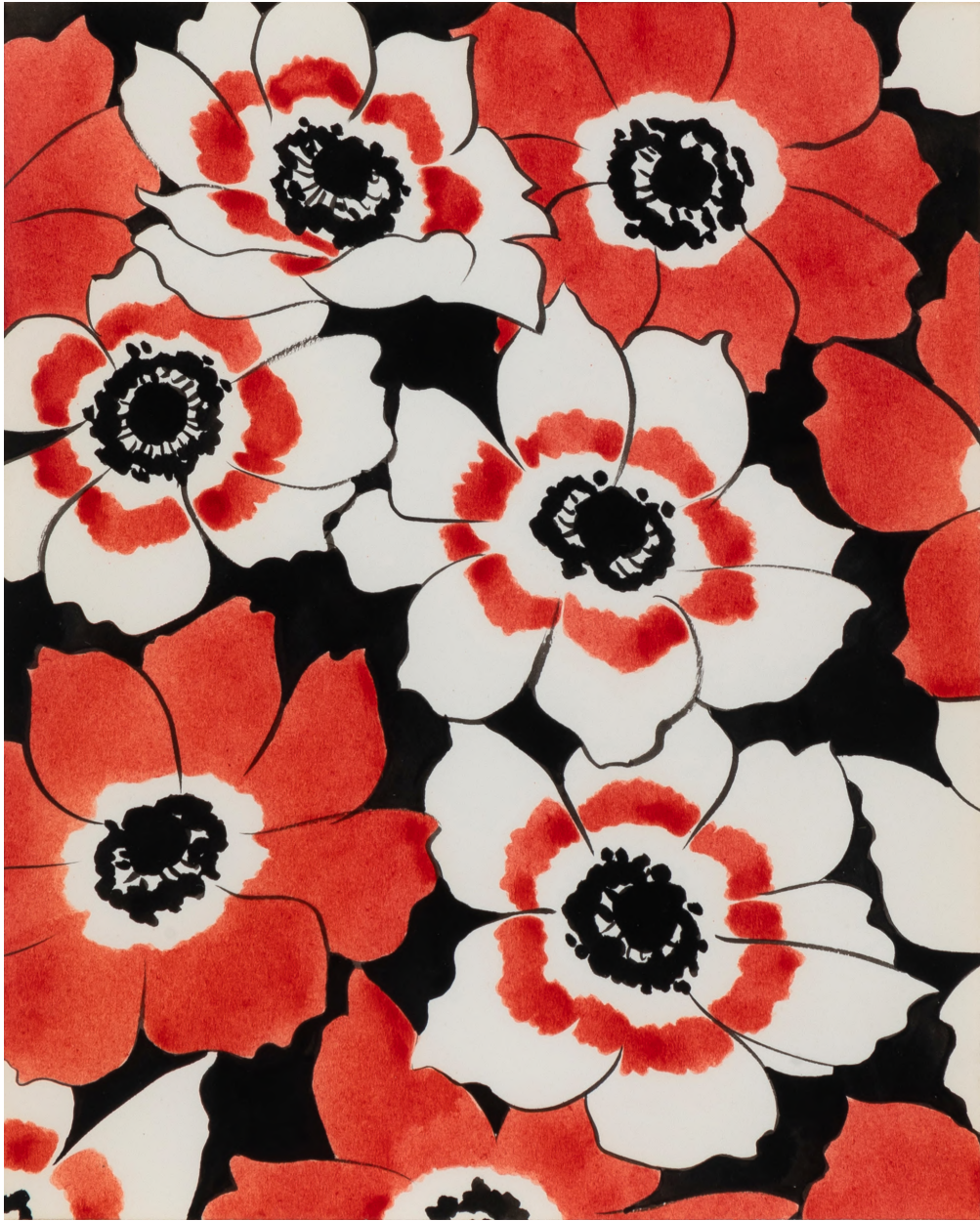
Flowers , 1968, watercolor on paper, 10 x 8 inches