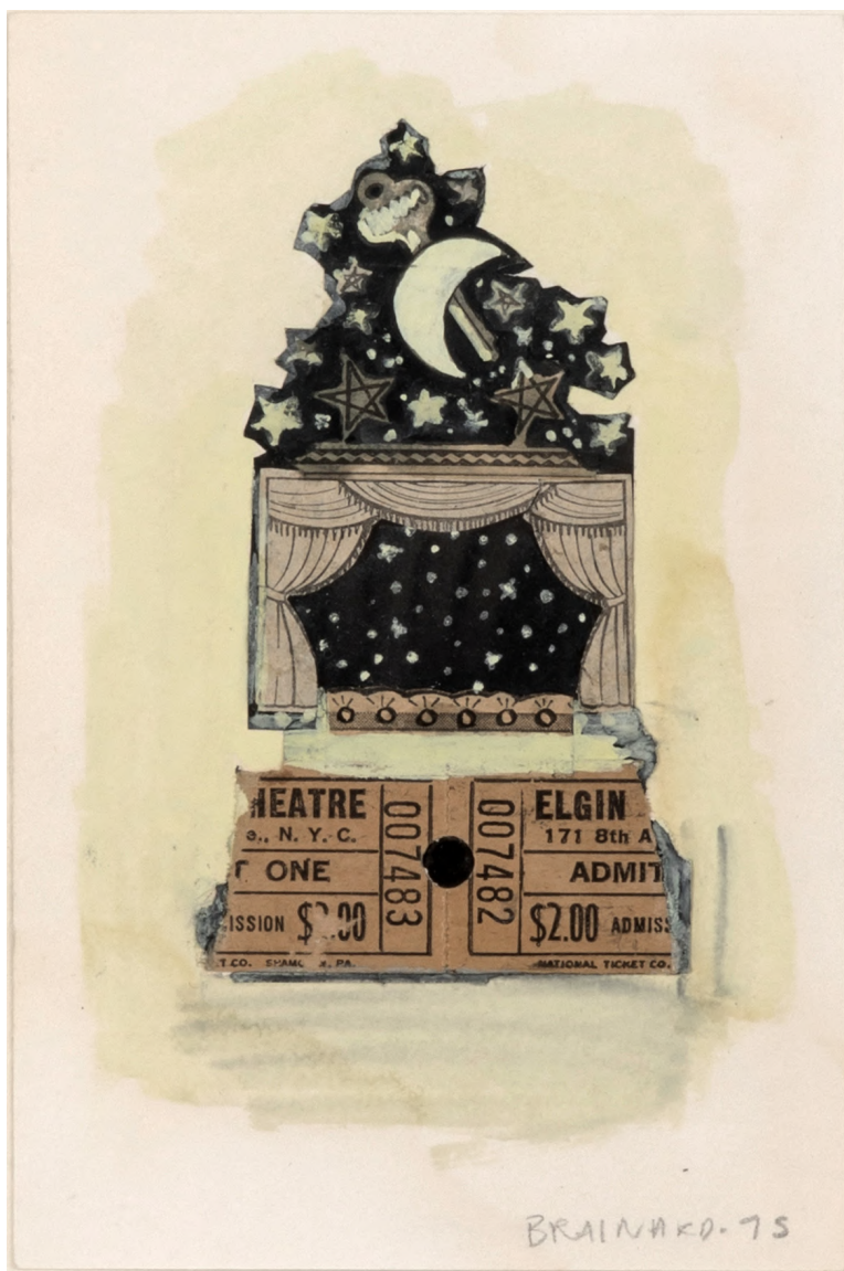
Untitled (Ticket Stub), 1975, 5 7/8 x 4 inches