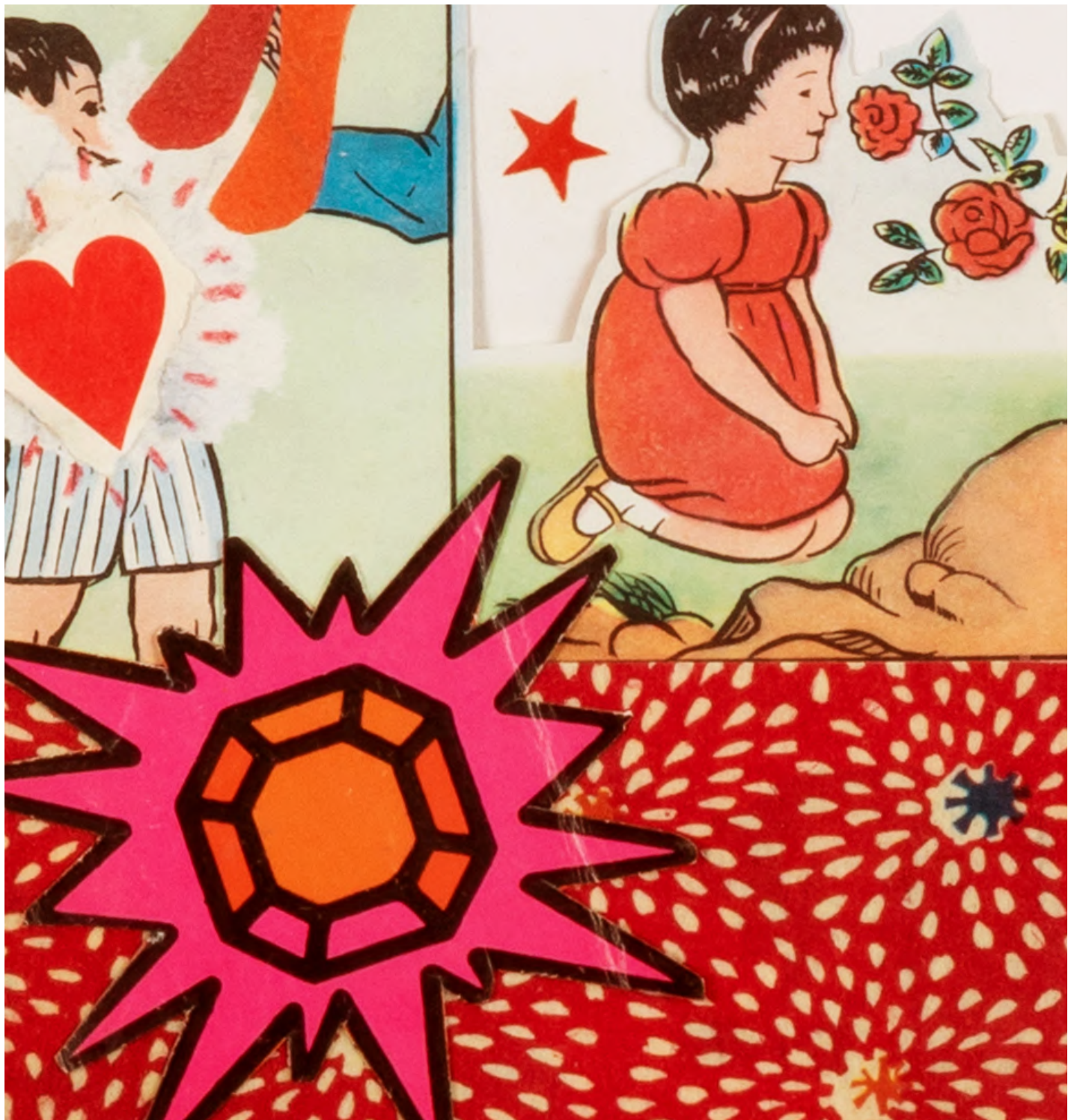
Untitled (Queen for a Day), detail