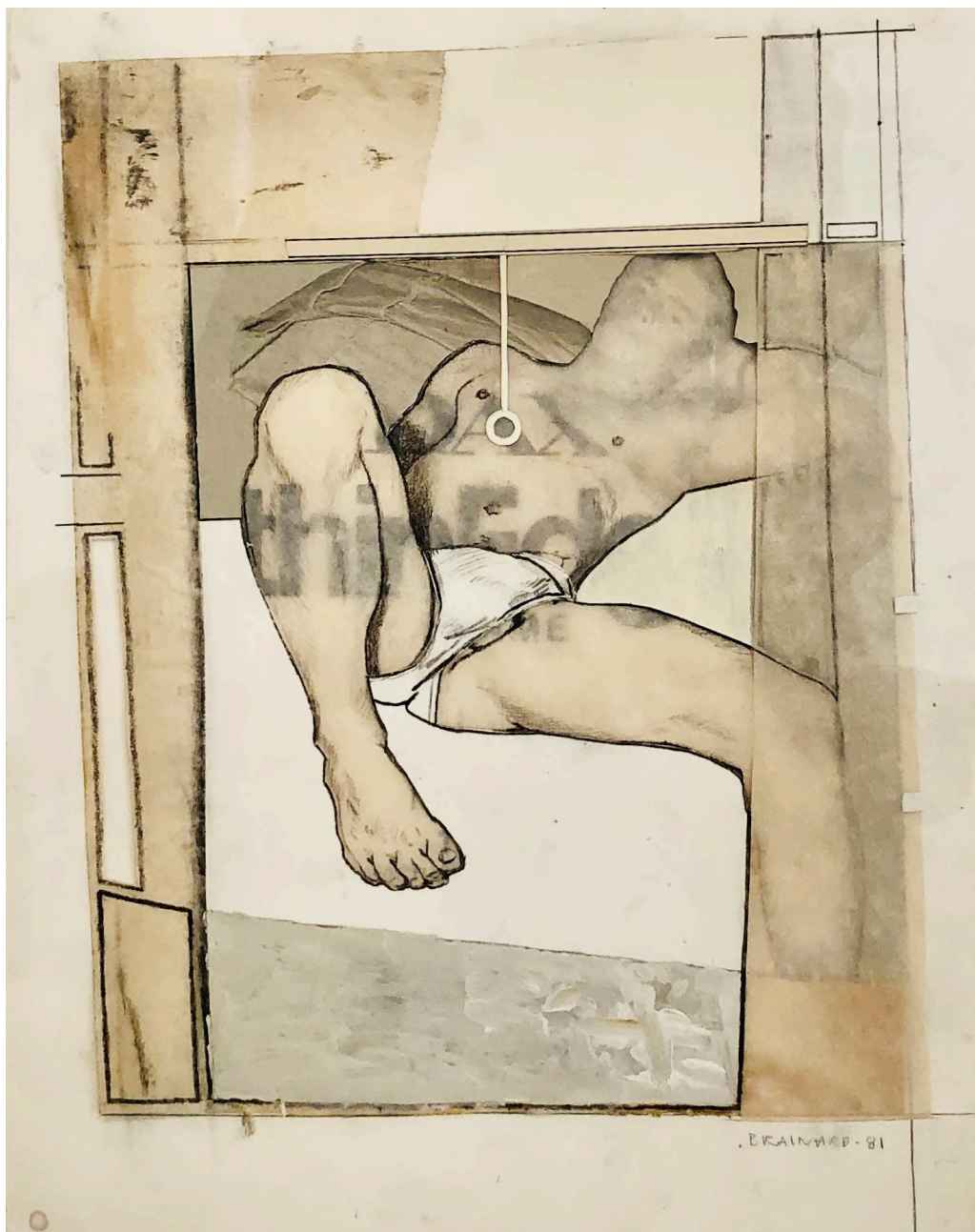
Untitled (Reclining Figure), 1981, 13 x 10 inches