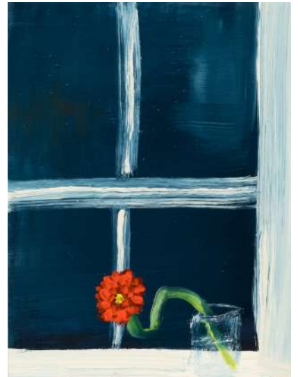
Red Flower in the Night , 2020, oil on board, 12 x 9 inches $3,200