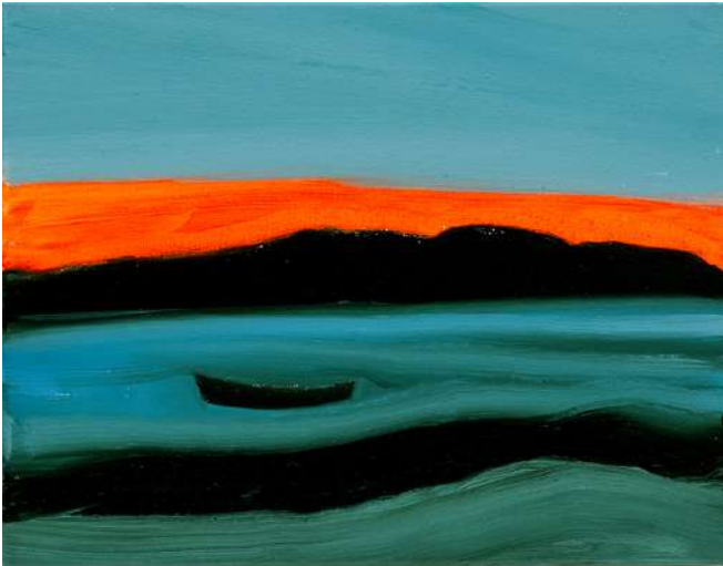
Morning Shine , 2019. oil on canvas, 12 x 15 inches $3,600