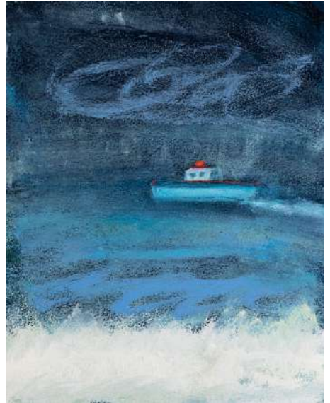
The Captain's Boat , 2021, oil on board, 10 x 8 inches $2,800