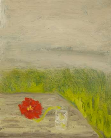
Red Flower in the Fog , 2020, oil on board, 10 x 8 inches $2,800