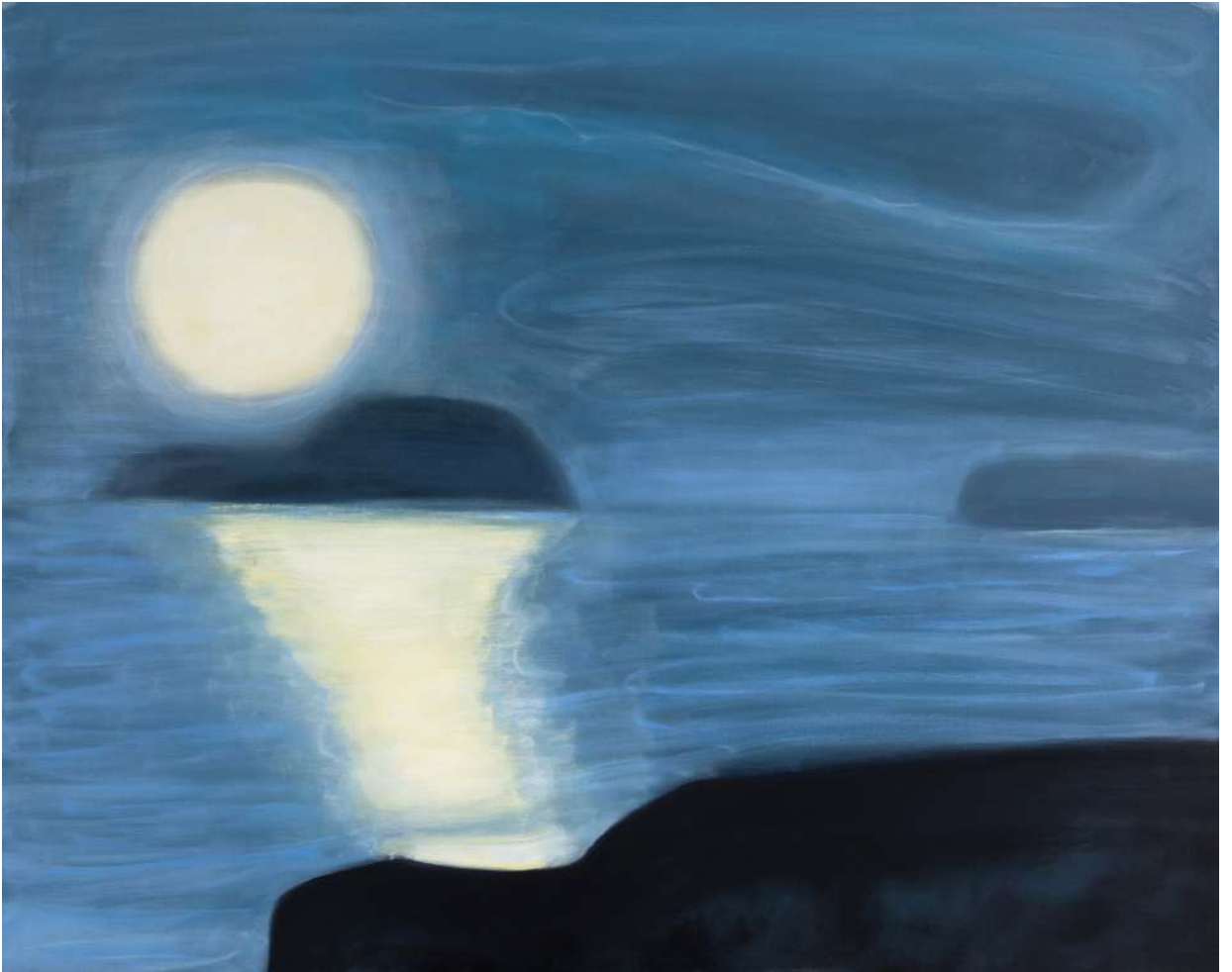
Moon , 2020, oil on canvas, 46 x 60 inches $16,500