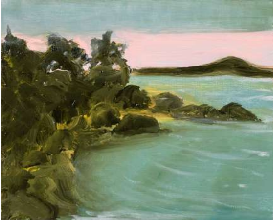
Tides , 2020, oil on board, 8 x 10 inches $2,800