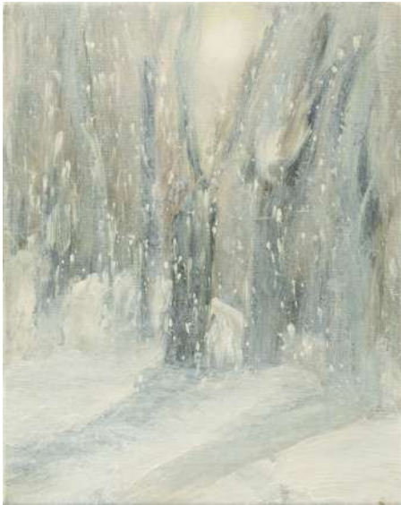
Winter , 2019, oil on canvas, 10 x 8 inches $2,800