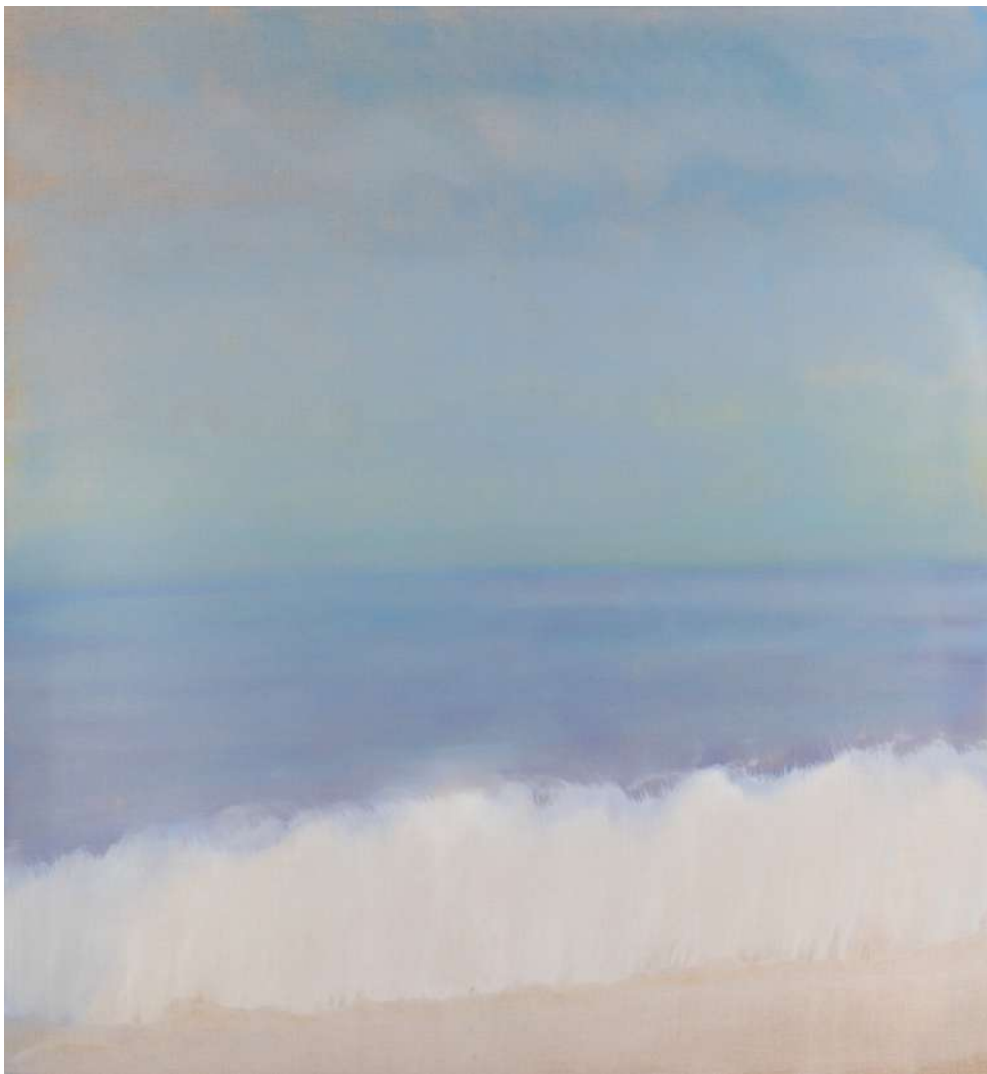
Wave , 2021, oil on canvas, 53 x 48 inches $14,500