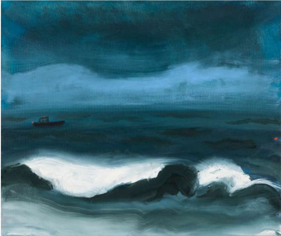
Boat in the Ocean , 2020, oil on canvas, 20 x 24 inches $4,200