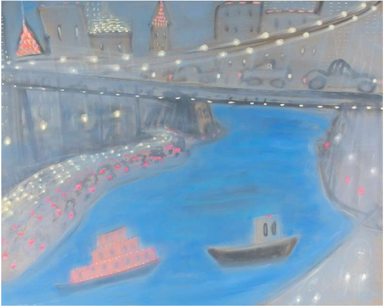
East River , 2021, oil on canvas, 48 x 60 inches $16,500