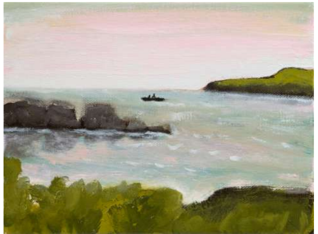
Boat in Pink Light , 2020, oil on canvas, 9 x 12 inches $3,200