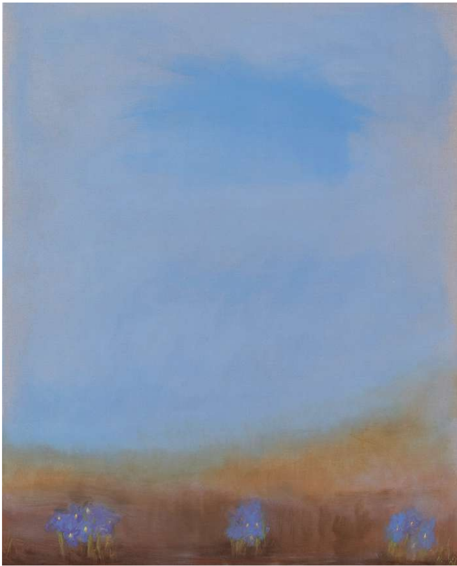
Sagaponack Spring, 2021, oil on canvas, 60 x 48 inches $16,500