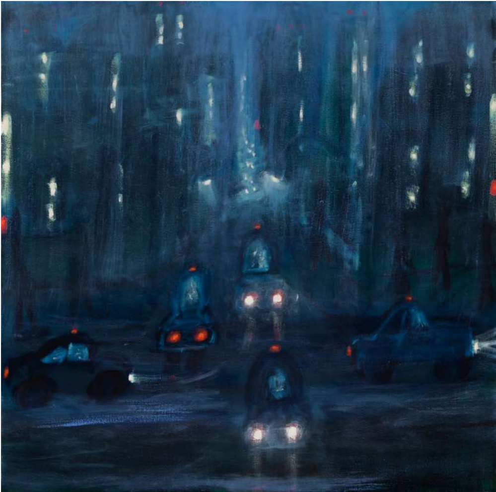
Intersection , 2020, oil on canvas, 48 x 48 inches $14,000