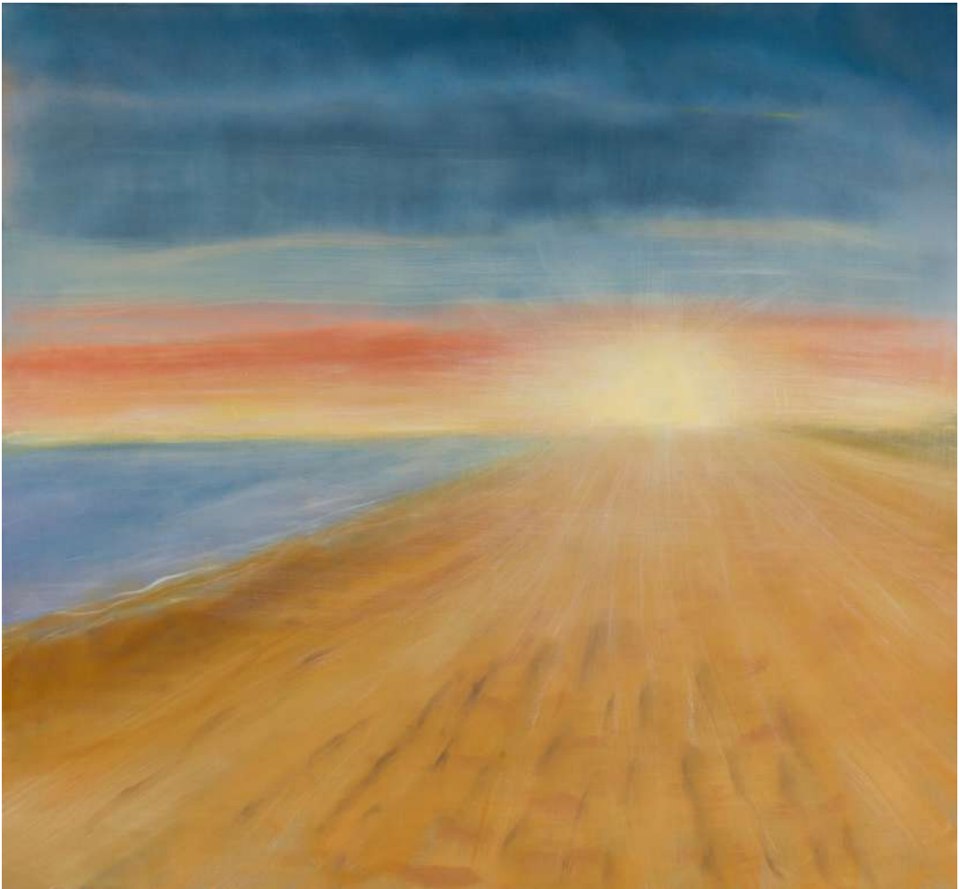
Sun on Sagaponack , 2020, oil on canvas, 48 x 53 inches $14,500