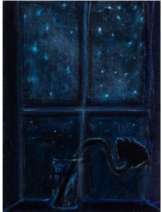
Flower and Stars , 2020, oil on canvas, 16 x 12 inches $3,600