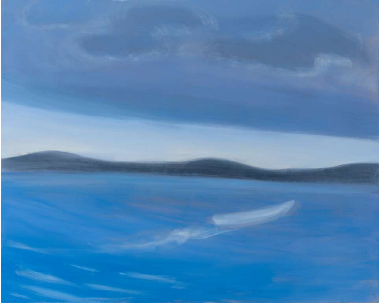
Boat, Shelter , 2020, oil on canvas, 48 x 60 inches $16,500