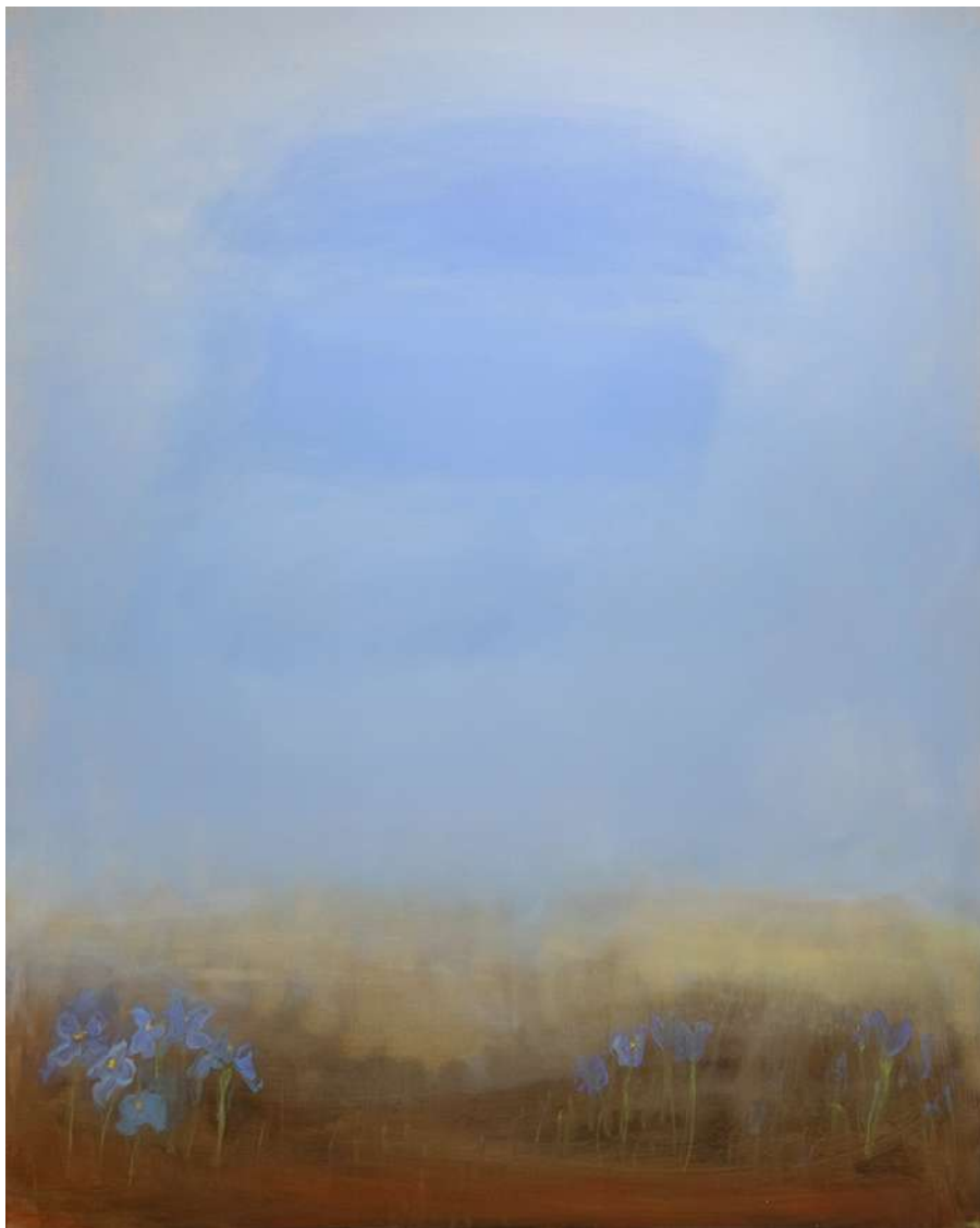
Crocuses , 2021, oil on canvas, 60 x 48 inches $16,500