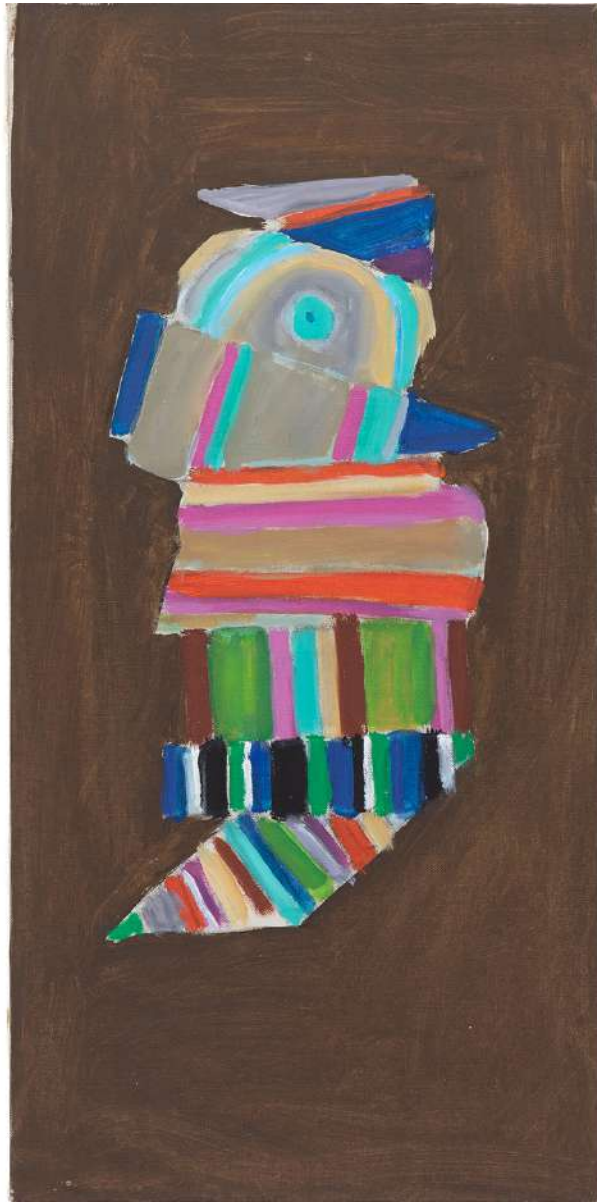
BETTY PARSONS Untitled (Puppet) , 1978, 32 x 16 inches