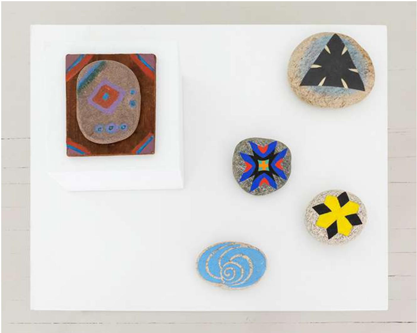
Clockwise from left: BETTY PARSONS, untitled , n.d., stone and wood with acrylic, 6 3/4 x 6 x 1 inches. JACK YOUNGERMAN, Stone Sign (VII) , 2013, acrylic on stone, 5 3/4 x 6 3/4 x 2 inches; Stone Sign (IX) , 2014, acrylic on stone, 4 1/2 x 4 1/2 x 1 3/4 inches; Stone Sign (XI) , 2014, acrylic on stone, 4 1/8 x 4 3/4 x 2 3/8 inches; Stone Sign (IV) , 2013, acrylic on stone, 4 3/4 x 5 1/2 x 1 3/8 inches