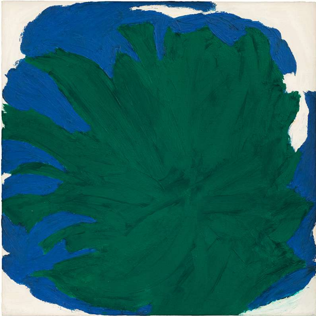
JACK YOUNGERMAN Untitled Green/Blue , 1959, oil on canvas, 21 x 21 inches