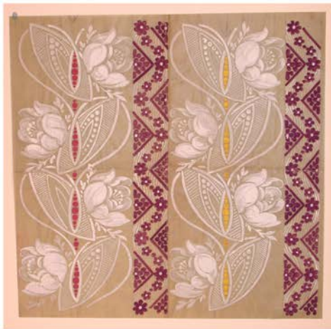
Ecole Lyonnaise, Wallpaper design with Flowers and Purple Strips c. 1900, gouache on paper

Organized within loose thematic groupings, each wall offers a fresh context for experiencing contemporary art and material culture from distant periods.