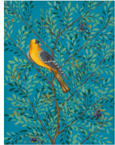
Antonia Munroe, The American Goldfinch and Acacia with Black Berries , 2015, pigment dispersion on panel

The Drawing Room is pleased to present its second annual Winter Salon, an eclectic installation of contemporary works by many gallery artists juxtaposed with 18 th and 19 th century natural history drawings, European plein air studies, decorative arts designs, herbaria and Beaux Arts watercolors. The curatorial perspective of pairing traditional art forms on paper with contemporary artistic practice is one that has been central to the gallery's program since its inception in 2004.