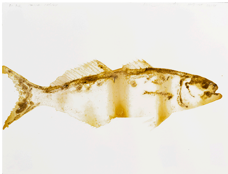
Alexis Rockman, Weakfish (Lynoscion regalis) Northwest Harbor, 11/13/10 , sand and acrylic polymer on paper