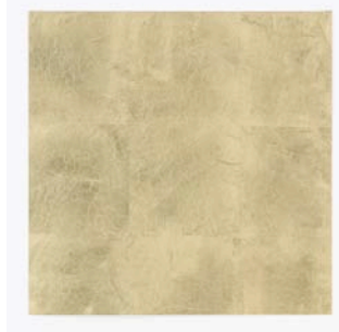
Stephen Antonakos, Field C , 2011 German gold leaf on mylar 20 7/8 x 17 7/8 in