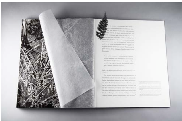
The Island of Rota , 2010, limited edition artist's book Published by The Library Council of The Museum of Modern Art