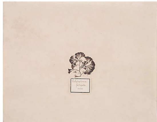
Herbaria: Polysophonica Fastigiata , late 19 th century

The most recent in a series of artist's books produced by the Library Council of The Museum of Modern Art, The Island of Rota unites the work of the photographer Abelardo Morell, the designer Ted Muehling, and the neurologist and writer Oliver Sacks in a limited-edition publication. Inspired by Sacks's observations on color blindness, his descriptions of plant life, and his fascination with nineteenth-century botanical books, Morell and Muehling have created a lush volume in black-and-white and sepia. The books' many layers of fossil-like images of ancient ferns and cycads evoke Sacks' sense of geological time. Morell has made thirteen original photographs for each book in the edition, using plant specimens supplied by The New York Botanical Garden. Muehling's contributions include laser cut images, unique castings of cycads and sea fans in handmade paper and an elegant hand-made box.