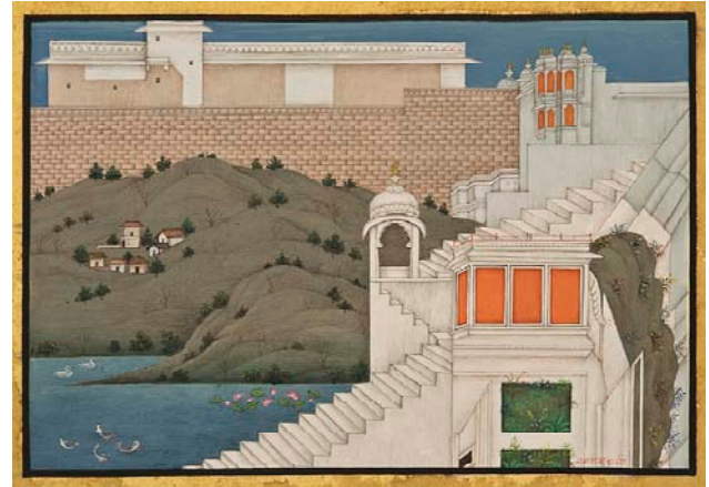
Hillside Palace , 2010, mineral pigments with gum arabic, 6 x 8 "