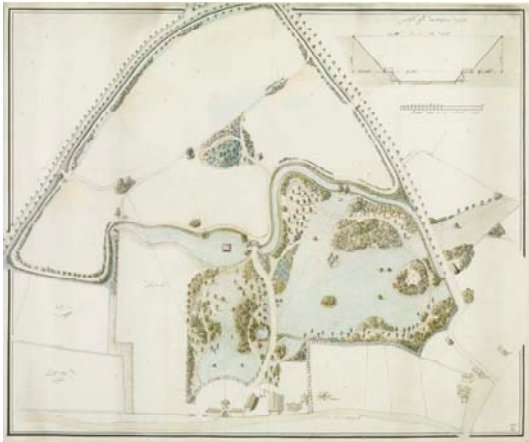
Flemish School, 18 th Century Project for a Landscape Garden near Schellebelle, 18 x 20 1/2"