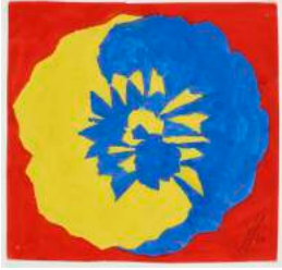
Mixing , 1960 gouache on paper 4 5/8 x 4 3/4 inches 11 1/8 x 10 7/8 inches framed (JY6404)