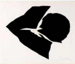
Passing , 1963 ink on paper 20 x 23 1/2 inches 22 1/8 x 26 inches framed (JY9033)