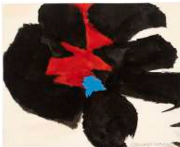
Black/Red/Blue , 1956 gouache on paper 4 1/2 x 5 1/2 inches 12 x 11 7/8 inches framed (JY9050)

55 MAIN STREET EAST HAMPTON NY 11937 T 631.324.5016