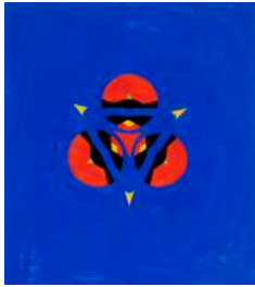
Untitled Blue , 1969 gouache on paper 12 x 10 5/8 inches 13 3/4 x 12 3/8 inches framed (JY9039)