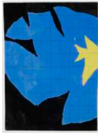
Edge Yellow II , 1964 gouache and pencil on paper 4 3/4 x 3 1/2 inches 11 x 9 inches framed (JY6397)