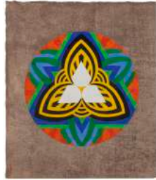
White/Yellow/Black , 2012 gouache on handmade Japanese paper 14 x 12 1/4 inches 16 1/4 x 14 1/4 inches framed (JY6276)