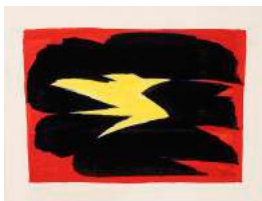
In Black , 1966 gouache on paper 4 3/4 x 6 3/4 inches 11 3/8 x 13 3/8 inches framed (JY9048)