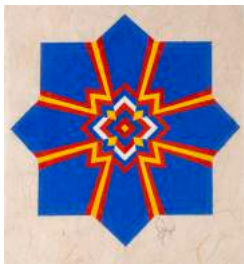
Yellow Red Blue , 2015 gouache on handmade Japanese paper 19 1/2 x 18 inches 21 1/2 x 20 1/8 inches framed (JY9034)