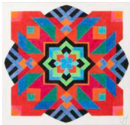
In Blue , 2019 color pencil on paper 16 x 15 inches 17 3/8 x 16 1/4 inches framed (JY9037)