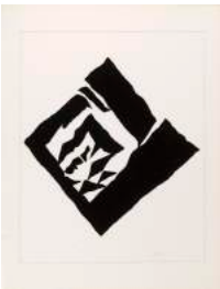
Untitled Ink , 1964 ink on paper 25 1/2 x 20 1/4 inches 28 1/2 x 22 3/4 inches framed (JY9031)