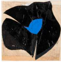
Untitled #619 , 1955 gouache, cut paper 5 3/4 x 5 5/8 inches 12 1/8 x 11 7/8 inches framed (JY8443)