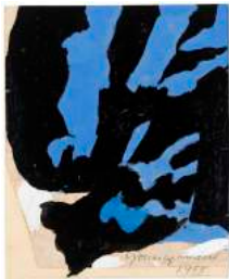
Blue/Black , 1955 gouache and cut paper 4 1/4 x 3 1/2 inches 10 7/8 x 10 inches framed (JY9052)