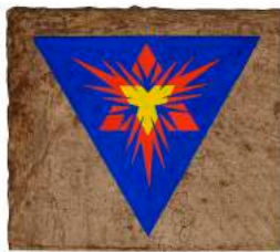
Blue Triangle , 2011 gouache on handmade Japanese paper 9 x 10 inches 11 x 12 1/4 inches framed (JY6362)