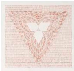
White In , 2010 india ink on paper 11 x 11 3/4 inches 12 3/8 x 13 1/8 inches framed (JY9040)