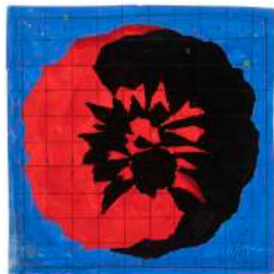
Untitled (#452) , 1960 gouache and pencil on paper 5 1/8 x 4 7/8 inches 12 x 11 1/4 inches framed (JY9051)