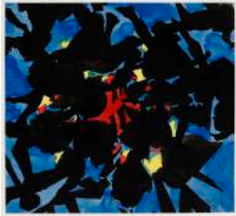
Thicket , 1954 gouache and ink on paper 4 1/2 x 5 inches 11 1/8 x 11 1/4 inches framed (JY6403)

JACK YOUNGERMAN Works on Paper 1954 - 2019 July 5 - August 5, 2019