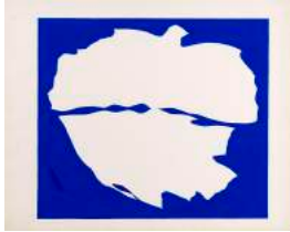
Untitled (#751) , 1964 gouache on paper 21 3/4 x 25 1/4 inches 23 3/4 x 27 inches framed (JY9030)