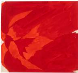
Untitled , 1963 watercolor on paper 7 1/8 x 7 1/2 inches 13 7/8 x 13 3/4 inches framed (JY9043)