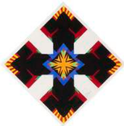
Black/Red Diamond , 2010 gouache on paper 14 1/2 x 14 1/2 inches 16 7/8 x 16 7/8 inches framed (JY9060)