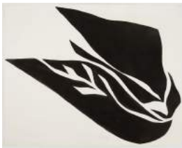
Ink #40 , 1968 India ink on paper 23 x 29 inches 25 1/8 x 31 1/8 inches framed (JY8161)