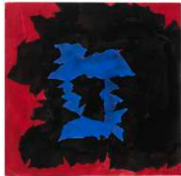
Untitled Crimson/Blue , 1960 gouache on paper 5 7/8 x 6 inches 12 3/8 x 12 1/4 inches framed (JY9049)