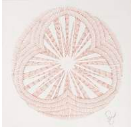
Tondo , 2010 india ink on paper 10 3/4 x 11 inches 12 1/8 x 12 3/8 inches framed (JY9064)