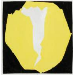
White Up , 1971 acrylic on paper 4 1/2 x 4 3/8 inches 11 x 1/8 x 10 3/4 inches framed (JY6401)