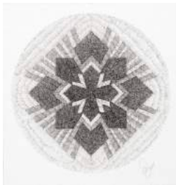
Crux Tondo , 2010 india ink on paper 10 7/8 x 10 1/2 inches 12 3/8 x 11 7/8 inches framed (JY9065)