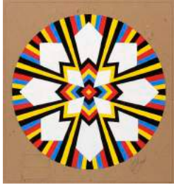
Yellowblack , 2016 gouache on cardboard 18 5/8 x 17 1/2 inches 20 1/4 x 19 inches framed (JY9036)