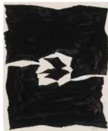
Untitled , 1966 gouache on paper 9 x 7 1/2 inches 15 5/8 x 13 3/4 inches framed (JY9044)