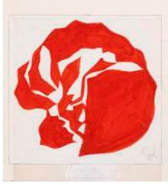
Red Around , 1965-2006 gouache and acrylic on paper 8 1/4 x 7 1/2 inches 11 1/8 x 10 1/4 inches framed (JY9035)