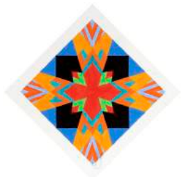
In Red Diamond , 2018 gouache on paper 16 x 16 inches 17 1/2 x 17 1/2 inches framed (JY9061)