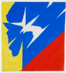
Red Corner II , 1963 gouache on paper 4 1/2 x 4 inches 11 x 10 3/4 inches framed (JY6400)