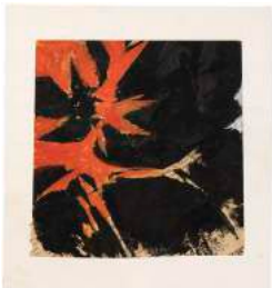
Untitled , 1955 gouache, collage on paper 4 1/2 x 4 1/2 inches 11 x 10 5/8 inches framed (JY8439)