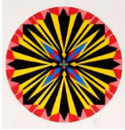
Yellow/Black Tondo , 2007 gouache on paper 12 1/2 x 11 3/4 inches 13 7/8 x 13 1/4 inches framed (JY9028)