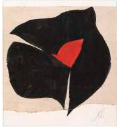
Black/Red Cut Paper , 1961 gouache, cut paper 6 9/16 x 5 7/8 inches 13 1/8 x 12 1/4 inches framed (JY8448)