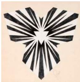
Triangle White , 2009 watercolor on paper 11 7/8 x 11 7/8 inches 13 3/8 x 13 3/8 inches framed (JY9063)