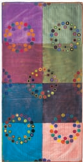
Chance Dance , 1989 acrylic and thread on canvas 75 1/2 x 39 inches signed, dated and titled verso