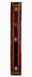
(Bullshit) Walk a Straight Line with It on Your Head, 1987

acrylic, cord, thread and fabric on canvas 74 1/2 x 11 inches titled verso