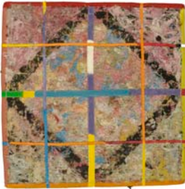
Semi-Perfect , 1979-83 acrylic, thread and fabric on canvas 20 x 20 inches signed, titled and dated verso