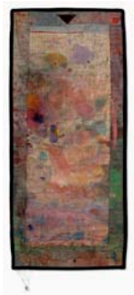
Journey to SJU (Flip) , 1973 acrylic, thread and fabric on canvas 40 1/2 x 18 1/2 inches signed verso and signed and dated in pocket, upper right