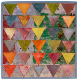
Polo Rollover, 1983

acrylic, cord, thread and fabric on canvas 74 1/2 x 11 inches titled verso