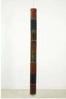
Dramaturgy , 1983 acrylic and thread on canvas 98 x 7 x 7 inches signed top of upper support