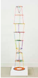
Space Needle , 2000 watercolor on cotton pulp-dipped galvanized steel armature 60 x 13 x 13 inches