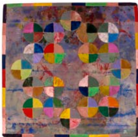
Tap Shoe Count, 1983

acrylic and thread on canvas 20 1/2 x 20 1/4 inches signed, titled, dated verso