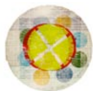
Tombstone Plate , 1978 serigraph and relief print on triple couched Upper U.S. Paper Mill handmade paper 21 inches diameter edition of 21