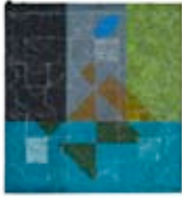
O.J. , 1974 serigraph, etching and relief with vegetable printing on black silk content handmade paper by Lucine Folgueras 6 x 6 inches edition of 28