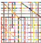
Detroit , 1973 serigraph and lithograph cut up, collaged and stitched into double- sided lattice print 22 1/4 x 22 1/4 inches edition of 13