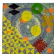
Spear , 1974 serigraph, relief and embossing on double couched Upper U.S. Paper Mill handmade paper with unmacerated cotton threads. The die-cut center extracted from Alan Shields' Shield 8 1/2 x 8 1/2 inches edition of 48