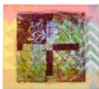
Slopes of Kentucky , 1974 etching and lithograph on dyed Arches Cover 10 1/2 x 12 inches edition of 31