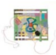
Houston Oil , 1974 serigraph, relief, embossing and vegetable printing on die-cut Arches Cover 8 1/2 x 6 3/4 inches edition of 21