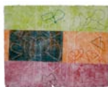
E.A.S.Y. , 1977 wood block relief print on Upper U. S. Paper Mill handmade paper with watermarking 18 x 23 inches edition of 18