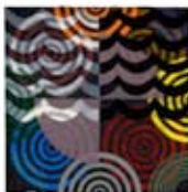
Scaba-Pro , 1974 serigraph, relief, flocking and embossing on black silk content handmade paper by Lucine Folgueras 13 x 13 inches edition of 30