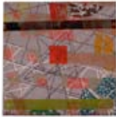
Spruce , 1976 relief print, serigraph, glitter, vegetable print and embossing on Upper U.S. Paper Mill handmade 9 1/2 x 9 1/2 inches edition of 20