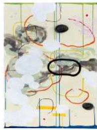
SUE HEATLEY There and Back Again , 2019 acrylic, ink and charcoal on paper 30 x 22 1/4 inches 33 x 25 1/8 inches framed (SH9202)