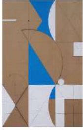
GUSTAVO BONEVARDI W , 2019 acrylic and charcoal on board 32 x 20 1/4 x 2 inches (GB9247)