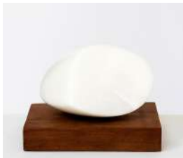
AYA MIYATAKE Danmen , 2018 alabaster, mahogany base 6 1/2 x 9 1/2 x 8 inches 2 x 11 1/2 x 9 1/2 inches (base) (AM8568)