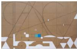
GUSTAVO BONEVARDI R , 2019 acrylic and charcoal on board 16 x 25 1/2 x 2 inches (GB9251)