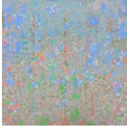
HECTOR LEONARDI Segreto , 2019 acrylic on canvas 36 x 36 inches (HL9262)