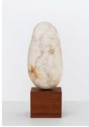
AYA MIYATAKE A , 2019 alabaster 7 3/4 x 4 x 2 3/4 inches 3 x 3 1/2 x 3 inches (base) (AM8995)