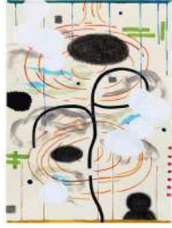
SUE HEATLEY The Road We Took , 2019 acrylic, ink and charcoal on paper 30 x 22 1/4 inches 32 3/4 x 25 1/8 inches framed (SH9201)