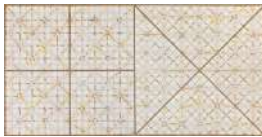
VINCENT LONGO Double Square Syntax , 1978 acrylic on canvas 24 x 48 inches (VL9216)