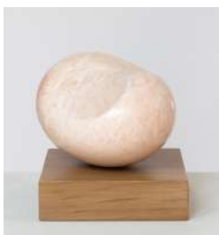
AYA MIYATAKE Sango-Iro , 2018 alabaster 6 3/4 x 9 1/2 x 7 1/2 inches 2 1/2 x 9 x 9 inches (base) (AM8703)