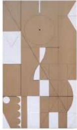
GUSTAVO BONEVARDI U , 2019 acrylic and charcoal on board 27 1/2 x 16 x 2 inches (GB9248)

Gustavo Bonevardi | Sue Heatley | Hector Leonardi | Vincent Longo | Aya Miyatake January 18 - April 12, 2020