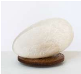
AYA MIYATAKE Mubi , 2018 alabaster 6 1/2 x 10 1/2 x 7 inches (AM8709)