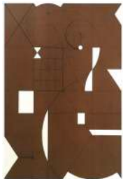
GUSTAVO BONEVARDI Q , 2019 acrylic and charcoal on board 48 x 32 inches (GB9255)