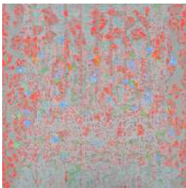
HECTOR LEONARDI Red Rising , 2019 acrylic on canvas 36 x 36 inches (HL9263)