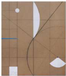
GUSTAVO BONEVARDI S , 2019 acrylic and charcoal on board 16 x 13 3/4 x 2 inches (GB9249)