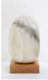
AYA MIYATAKE Kiretsu , 2019 alabaster 14 1/2 x 9 1/2 x 9 1/2 inches 2 1/2 x 9 x 9 inches (base) (AM8998)