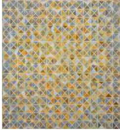
VINCENT LONGO Untitled , 1972 acrylic on canvas 24 x 22 inches (VL9213)