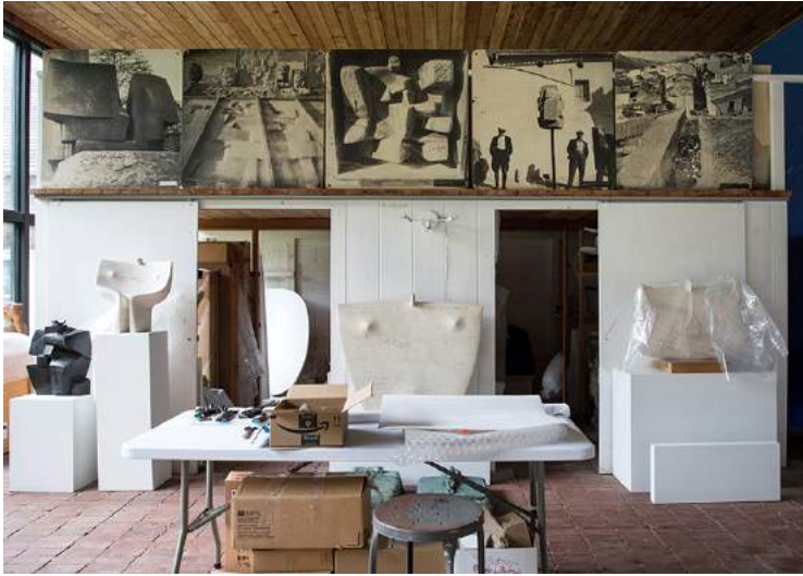
Nivola studio in Springs, NY

For further information and reproduction quality images contact Morgana Tetherow-Keller at 631 324.5016 or morgana@drawingroom-gallery.com