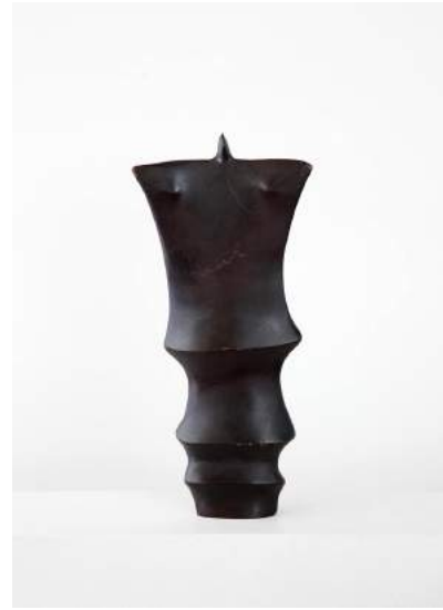
P68 , 1982, 7 ¾ x 3 3/8 x 1 inches

Opening on August 9th and on view through September 9th, The Drawing Room is pleased to present an exhibition of Costantino Nivola's graffiti, sculpture, drawings and prints. Organized in collaboration with the estate of the artist, the selection includes many works which have never previously been exhibited. Sculpture in marble, bronze, and concrete spanning his most prolific years 1962–1982 form the core of the show, while the graphic works add breadth and additional context. Together the works on view highlight Nivola's passion for experimentation, the vigor of his graphic sensibility and the lyrical expression he achieved in diverse sculptural mediums.