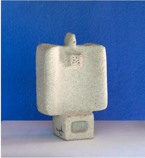
M25 , 1970 7 ½ x 4 7/8 x 3 ¼ inches