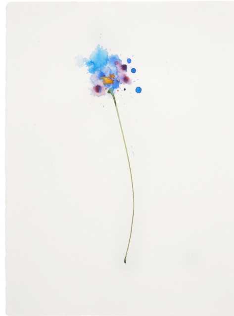
Composition, September 5, 2017

Opening May 11th and on view through June 11th, The Drawing Room in East Hampton is pleased to present GUSTAVO BONEVARDI New Watercolors . A separate press release is available for the concurrent exhibition, JOHN TORREANO Gold Gems Balls . Trained as an architect and living in East Hampton and New York City, Bonevardi's creates sculpture and drawing projects that have been widely exhibited and commissioned. In this first presentation focused solely on his exuberant abstract watercolors that evoke blossoms and constellations, Bonevardi balances a process driven by chance with a meticulously choreographed technique.