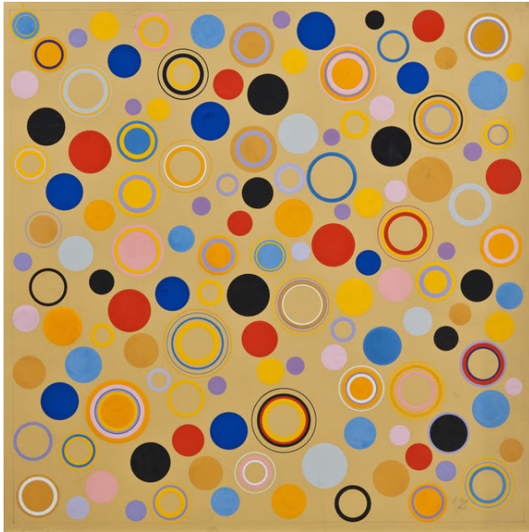
Cercles dans Space Jaune, #3048, 1962, acrylic, 24 x 24"

DRAWING ROOM PROJECTS / NYC is pleased to present two exhibitions at Victoria Munroe Fine Art. A separate press release is available for COSTANTINO NIVOLA (1911-1988): The Modern Figure . Both exhibitions will be on view through April 1, 2017.