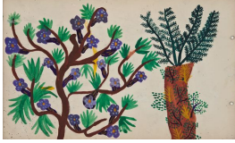
MARTINE LE COURS POUR MAISON PAUL POIRET (1879-1944) Design project for maison Poiret #3, c.1910 pencil and gouache on paper 5 3/8 x 9 inches 15 3/4 x 18 3/4 inches framed ( P5600)