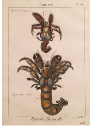
DESEVE BARROIS (19th century) Crustaces, plate 312, c. 1817 etching and engraving with watercolor 11 7/8 x 8 5/8 inches (DB7768)