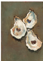
JOHN ALEXANDER Three Mighty Shells , 2015 oil on canvas 14 x 11 inches signed verso (JA7627)