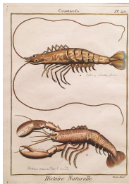
DESEVE BARROIS (19th century) Crustaces, plate 291 , c. 1817 etching and engraving with watercolor 11 3/4 x 8 5/8 inches (DB7764)