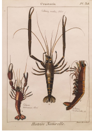
DESEVE BARROIS (19th century) Crustaces, plate 318 , c. 1817 etching and engraving with watercolor 11 7/8 x 8 3/4 inches (DB7766)