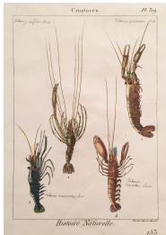
DESEVE BARROIS (19th century) Crustaces, plate 319, c. 1817 etching and engraving with watercolor 11 3/4 x 8 5/8 inches (DB7765)