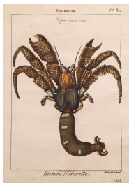
DESEVE BARROIS (19th century) Crustaces, plate 310, c. 1817 etching and engraving with watercolor 11 7/8 x 8 5/8 inches (DB7767)