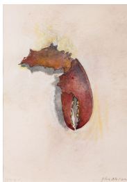
JOHN ALEXANDER Lobster Claw , 2014 watercolor on paper 12 x 9 inches 15 7/8 x 13 3/8 inches framed signed lower right (JA7215)