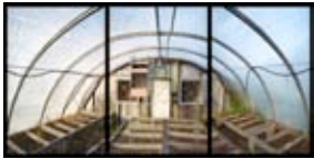
Chapman's Greenhouse, Manchester, MA, June 2007 archival ink jet print triptych: 30 x 20 1/2 inches each (framed) Edition 1 of 5