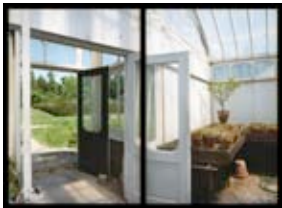
Private Estate Greenhouse, Doors Wellesley, MA, June 2001 C-print diptych: 39 7/8 x 27 1/4 inches each (framed) Edition 3 of 5