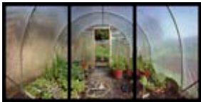
Beverston Castle Greenhouse, Tetbury Gloucestershire, England, June 2004 C-print triptych: 30 x 20 inches each (framed) Edition 2 of 5