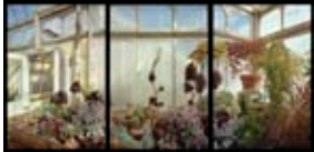
Private Estate Greenhouse, Succulents , Wellesley, MA, April 2003 digital C-print triptych: 24 1/4 x 16 7/8 inches each (framed) Edition 1 of 5