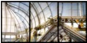
Reynolda House Greenhouse, Winston-Salem, NC, May 2007 archival ink jet print triptych: 30 x 20 1/2 inches each (framed) Edition 1 of 5