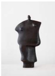
P67, 1982 bronze 8 3/4 x 4 3/8 x 1 1/8 inches Ed. 2/7 signed and dated verso (CN9166.2)