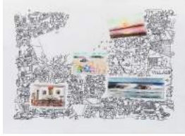
Long Island, New York, 1978 ink and pastel on paper 21 7/8 x 30 inches (CN9009)