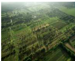
Southeast to Quail Hill Farm, Amagansett, 2016 archival pigment print 38 5/8 x 48 5/8 inches 45 x 55 inches framed Ed. 1/5 signed, dated and numbered on artist's label verso (ML9220.1)