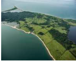
Gardiner's Island Northeast, 2016 archival pigment print 23 1/2 x 29 1/2 inches 29 x 35 inches framed Ed. 1/5 signed, dated and numbered on artist's label verso (ML8949.1)