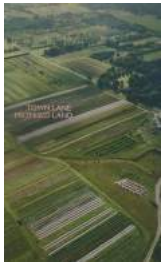
Town Lane/Promised Land, 2017 Hand-made book of 20 aerial images photographed by Michael Light in 2016. Printed on Epson Enhanced Matte paper using Epson Ultrachrome 3 pigment inks. Binding by John DeMerritt Bookbinding and Magnolia Press, Emeryville, CA. 35 1/4 x 22 1/2 inches (book) 35 x 43 1/2 inches (interior images) Ed. 1/10 signed, dated and numbered on rear endpaper (ML8974.1)