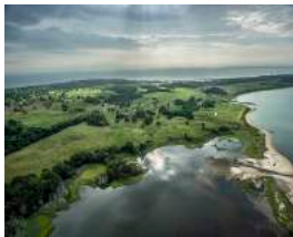
East from Home Pond, Gardiner's Island, 2016 archival pigment print 23 1/2 x 29 1/2 inches 29 x 35 inches framed Ed. 2/5 signed, dated and numbered on artist's label verso (ML9224.2)