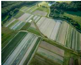
Northwest Across 100 Acres Preserved by Deborah Ann Light, Amagansett, 2016 archival pigment print 38 5/8 x 48 5/8 inches 45 x 55 inches framed Ed. 1/5 signed, dated and numbered on artist's label verso (ML9074.1)