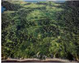
South Across Gardiner's Island, 2016 archival pigment print 23 1/2 x 29 1/2 inches 29 x 35 inches framed Ed. 1/5 signed, dated and numbered on artist's label verso (ML9072.1)