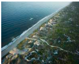
Dunes at Napeague State Park, 2016 archival pigment print 38 5/8 x 48 5/8 inches 45 x 55 inches framed Ed. 2/5 signed, dated and numbered on artist's label verso (ML9176.2)