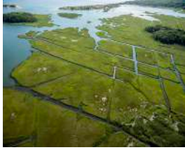
Accabonac Wetlands, Springs, 2016 archival pigment print 23 1/2 x 29 1/2 inches 29 x 35 inches framed Ed. 1/5 signed, dated and numbered on artist's label verso (ML9222.1)