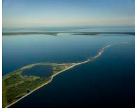
Great Pond Mirroring Napeague Harbor, Gardiner's Island, 2016 archival pigment print 23 1/2 x 29 1/2 inches 29 x 35 inches framed Ed. 1/5 signed, dated and numbered on artist's label verso (ML8952.1)