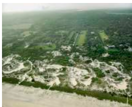
1968 Ward Bennett House and Double Dunes; Further Lane, Amagansett, 2016 archival pigment print 23 1/2 x 29 1/2 inches 29 x 35 inches framed Ed. 1/5 signed, dated and numbered on artist's label verso (ML9225.1)