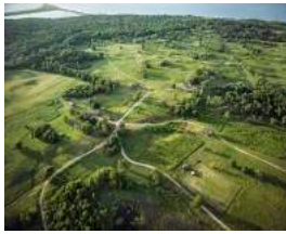
North Across Gardiner's Island, 2016 archival pigment print 23 1/2 x 29 1/2 inches 29 x 35 inches framed Ed. 1/5 signed, dated and numbered on artist's label verso (ML9221.1)