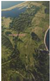
Manchonake/Gardiner's Island, 2017 Hand-made book of 24 aerial images photographed by Michael Light in 2016. Printed on Epson Enhanced Matte paper using Epson Ultrachrome 3 pigment inks. Binding by John DeMerritt Bookbinding and Magnolia Press, Emeryville, CA. 35 1/4 x 22 1/2 inches (book) 35 x 43 1/2 inches (interior images) Ed. 5/10 signed, dated and numbered on rear endpaper (ML9181.5)