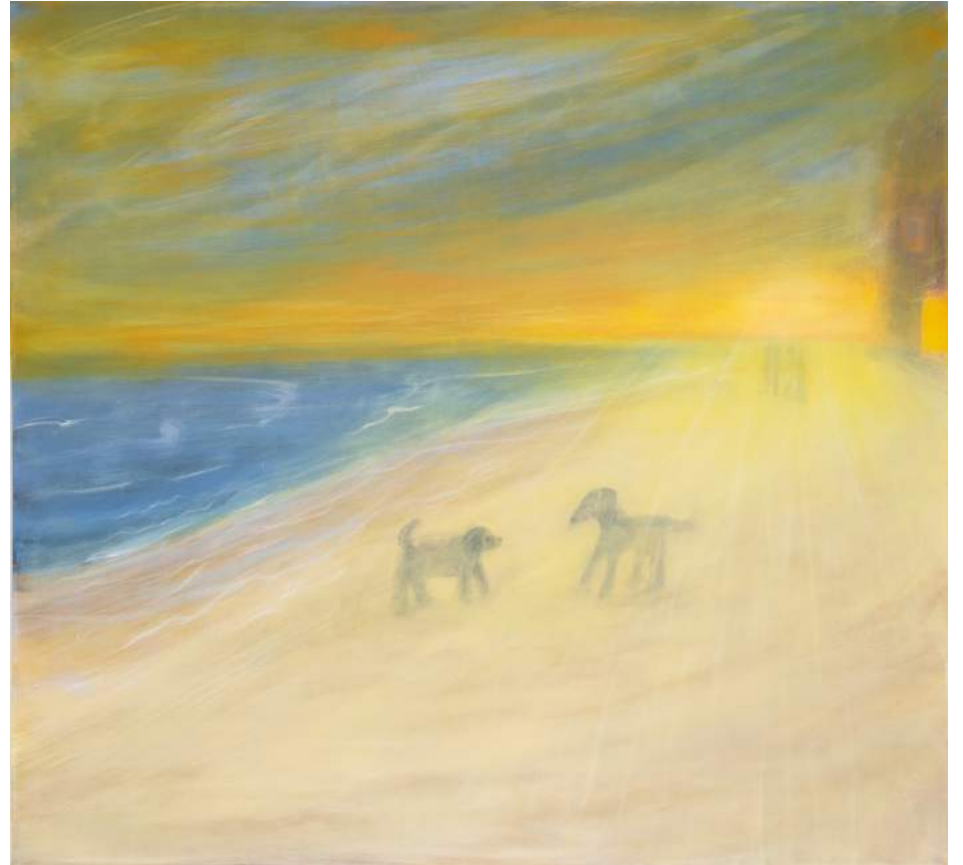
Maine Wild Flowers, 2023, oil on linen, 24 x 18 inches Dogs on Gibson Beach, 2023, oil on linen, 49 x 53 inches