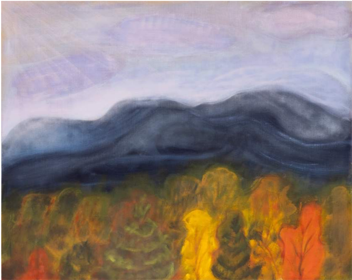
Fall View from Thomas Cole's House, 2022, oil on linen, 48 x 60 inches