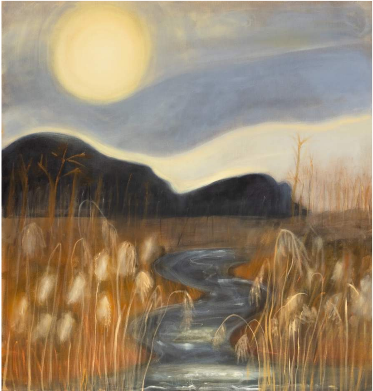
Winter Light, Delhi, 2023, oil on linen, 63 x 60 inches