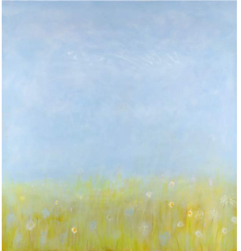
Gowanus out the Window , 2023, oil on aluminum, 20 x 18 inches