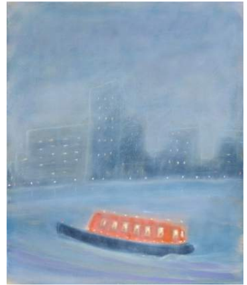
BQE in Blue , 2021, oil on board, 30 x 48 inches