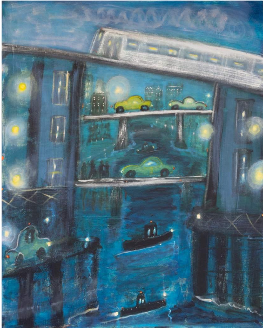
F train over Canal , 2021, oil on canvas, 60 x 48 inches