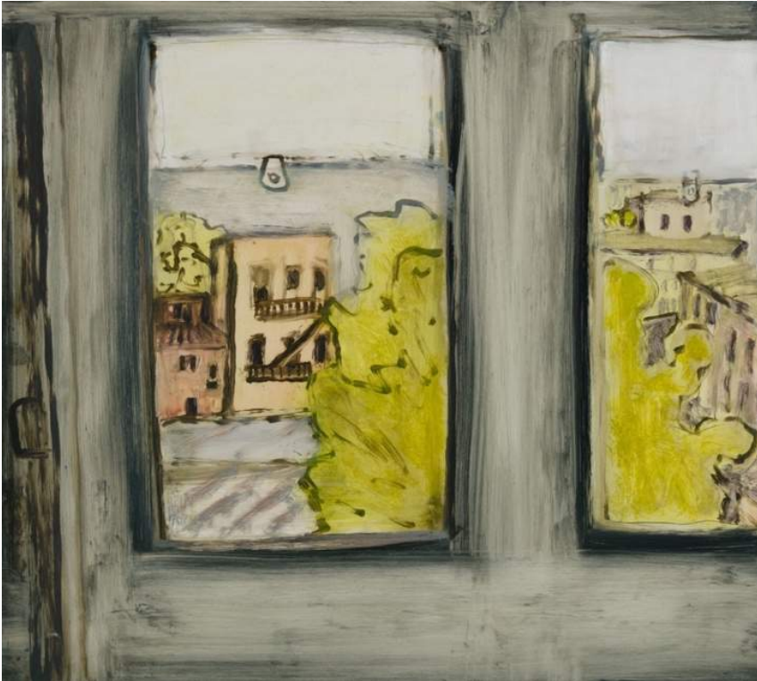
View from Two Windows – Gowanus, 2023, oil on aluminum, 18 x 20 inches