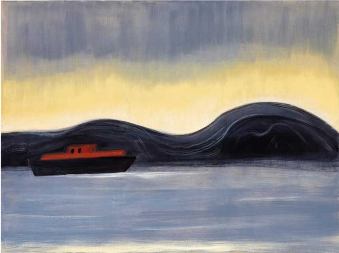
Boat on the Hudson, Dusk, 2022, oil on linen, 36 x 48 inches