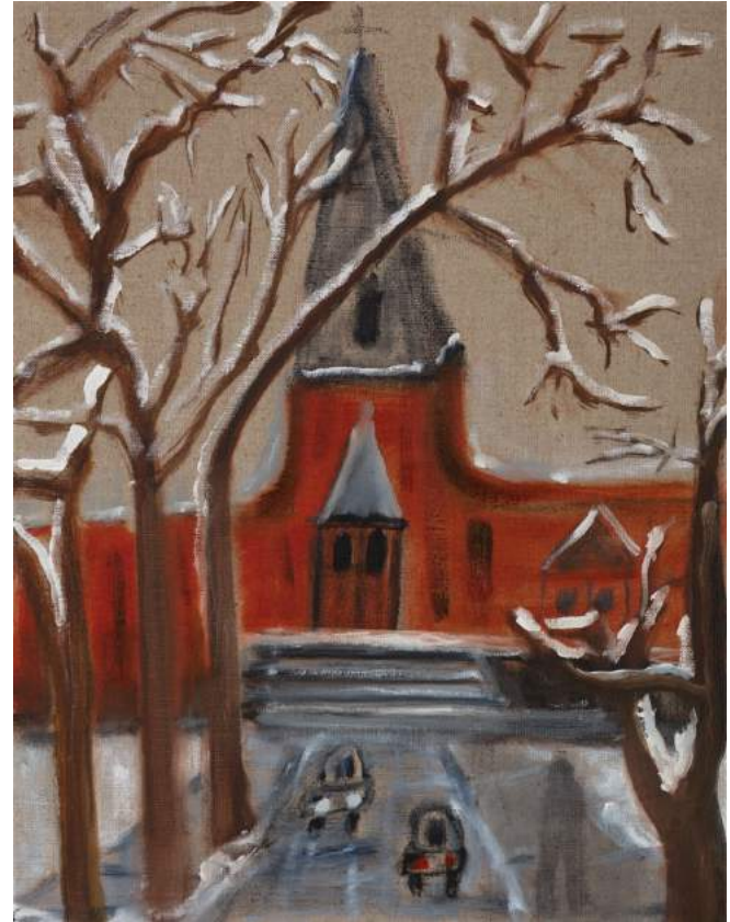
Red Sneakers Walking on Main, 2023, oil on linen, 14 x 12 inches