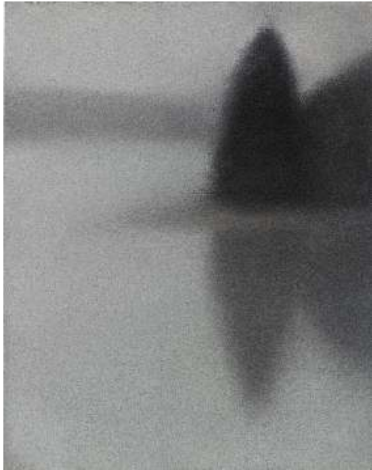
Peconic Bay #1, pastel on paper 14 x 11 inches