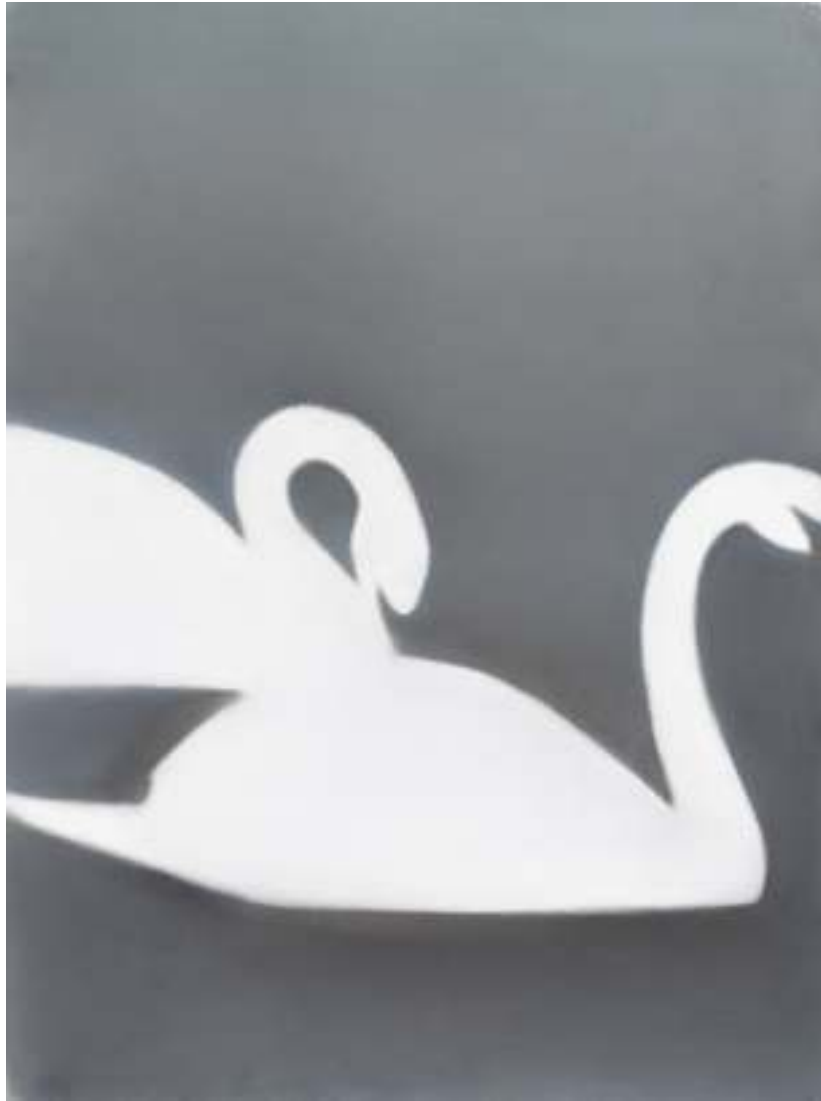
Swan #3, 2009 pastel on paper 47 x 35 inches