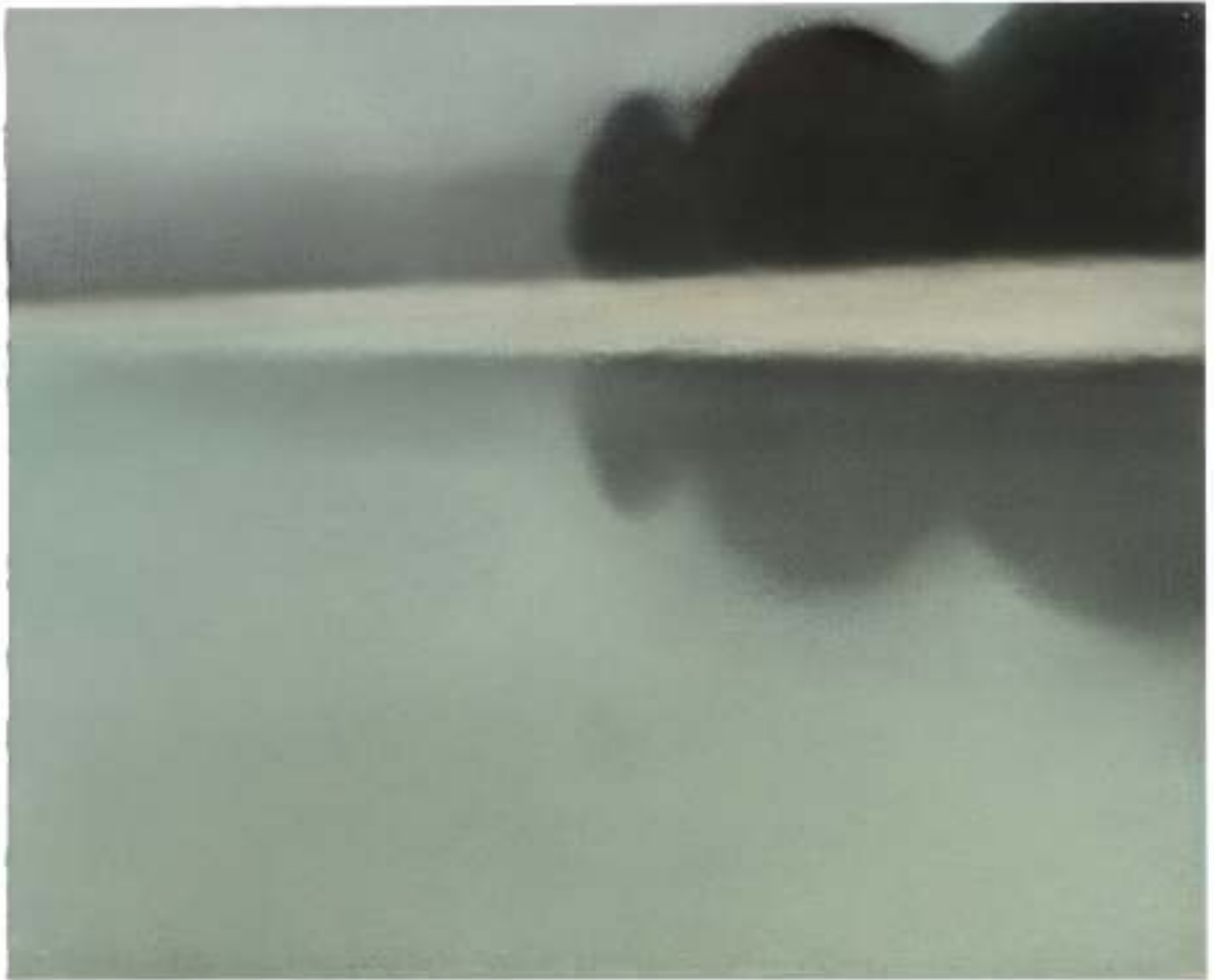
Peconic Bay #14, 2000 pastel on paper 13 3 / 4 x 17 inches