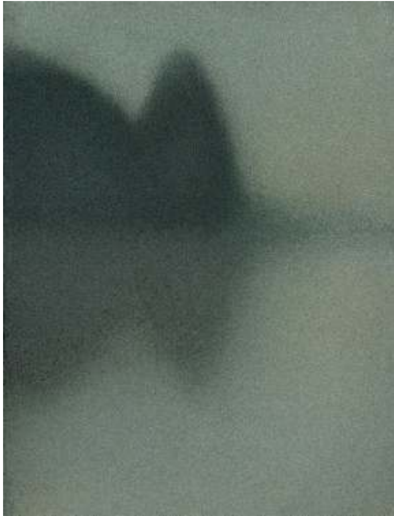
Peconic Bay #8, 1997 pastel on paper 13 x 10 inches