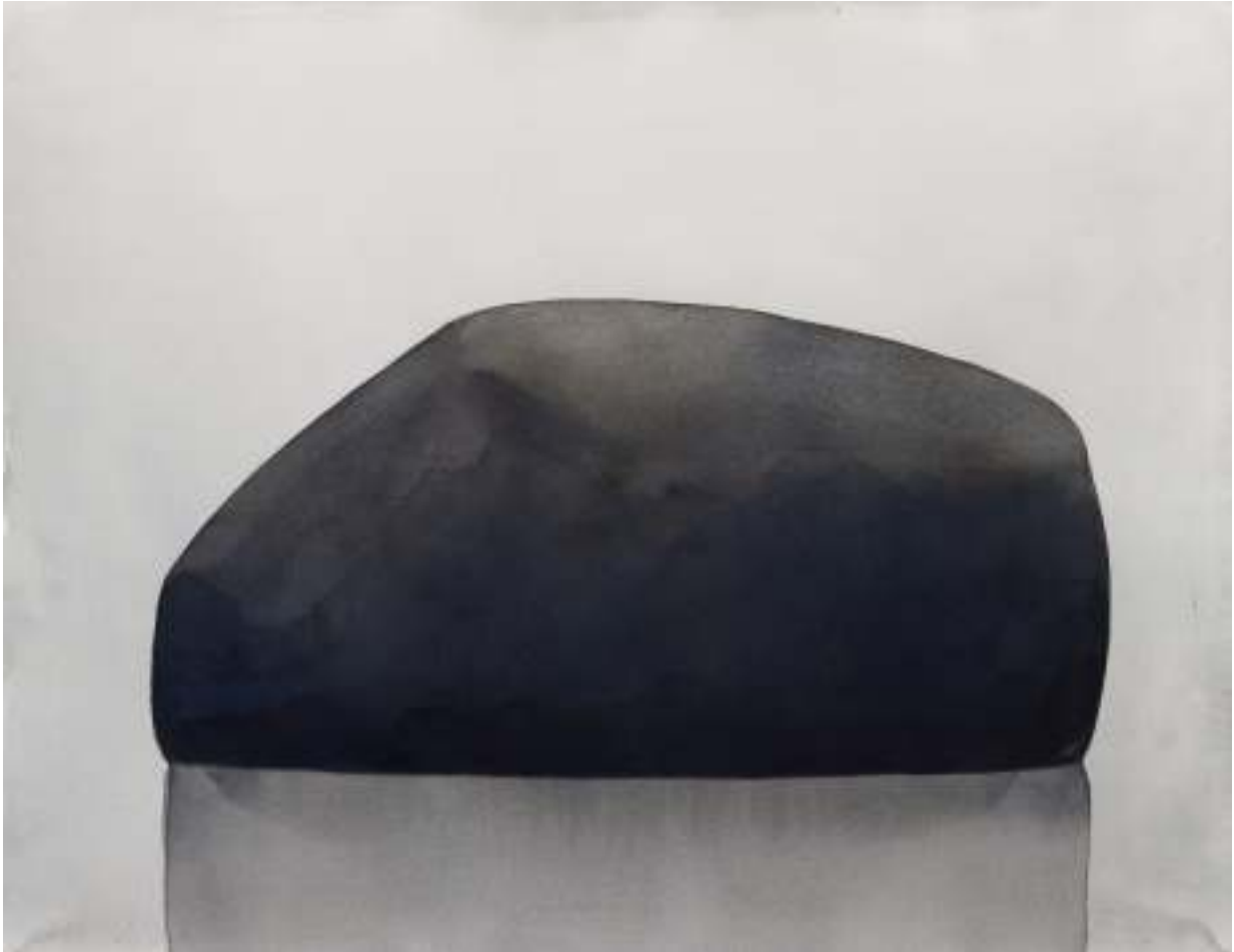
Rock #6, 2006 watercolor on paper 15 x 19 ½ inches