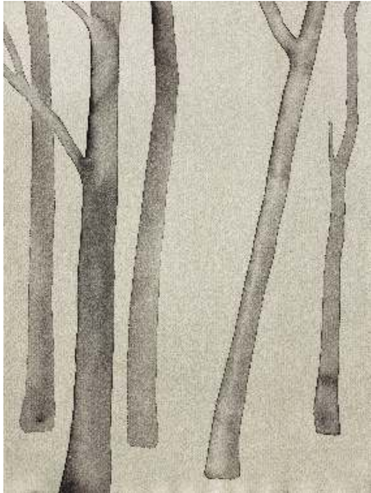
Tree #2, 2004 watercolor on paper 18 ½ x 14 inches