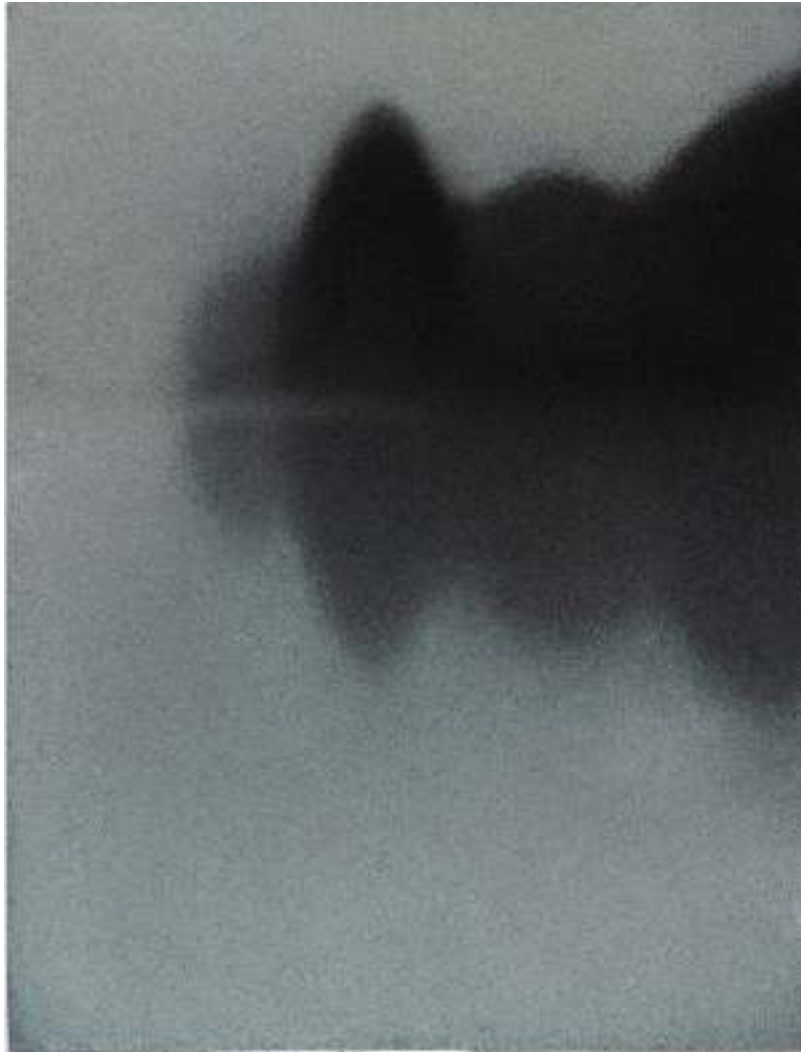
Peconic Bay #4, 1997 pastel on paper 25 1/2 x 19 1/2 inches