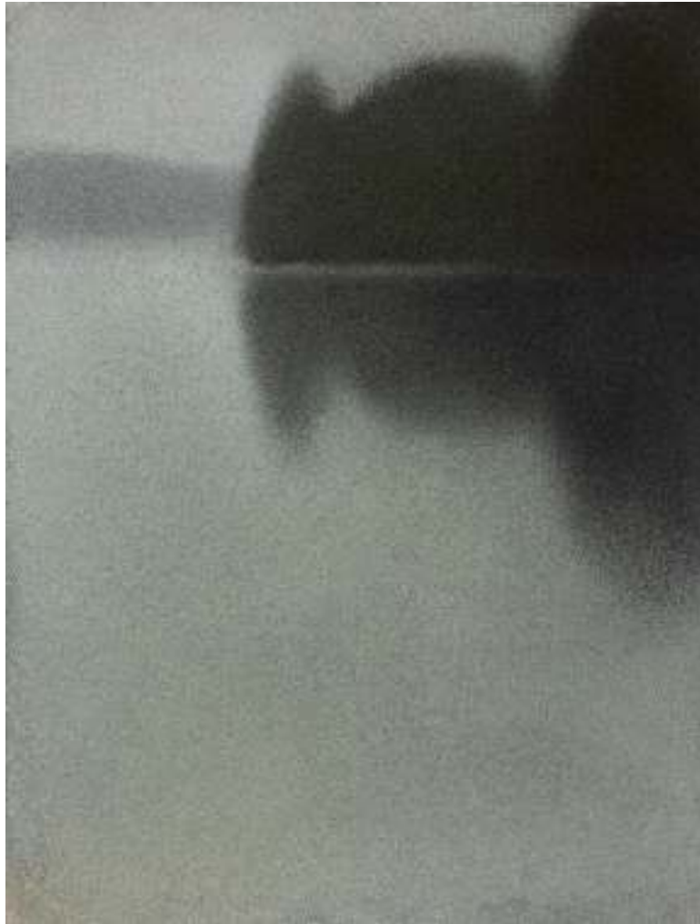
Peconic Bay #3, 1997 pastel on paper 20 x 15 ½ inches