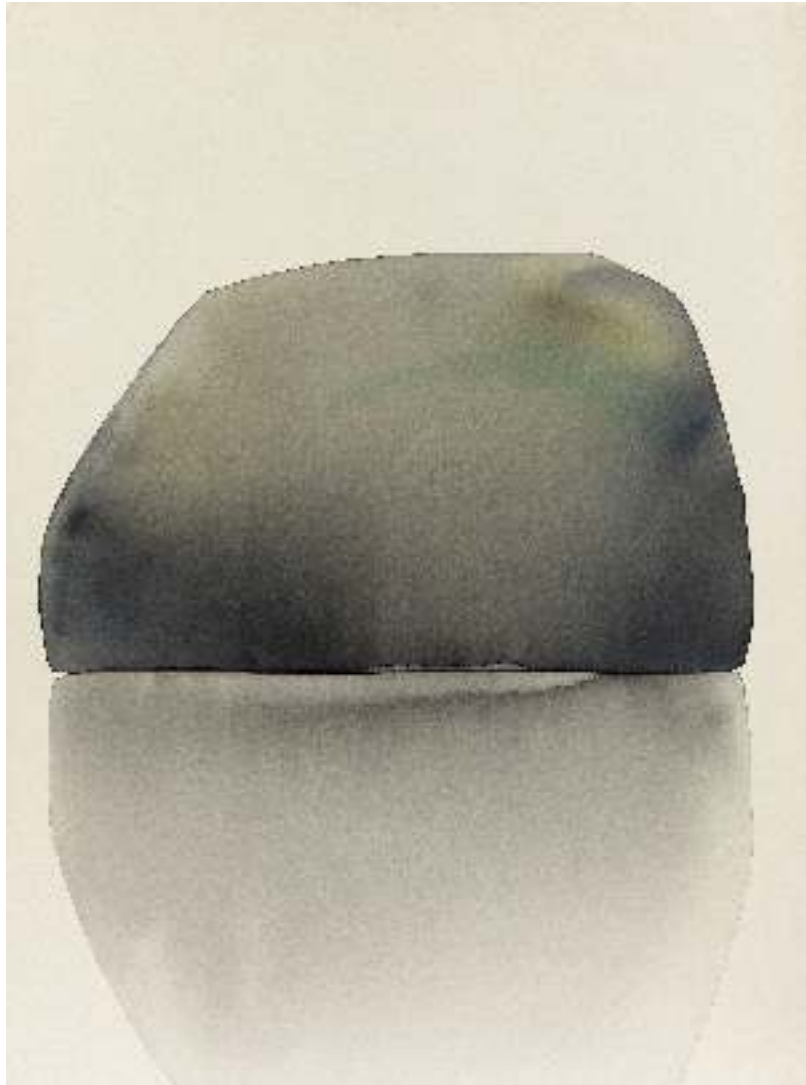
Rock #2, 2006 watercolor on paper 30 x 22 ¼ inches