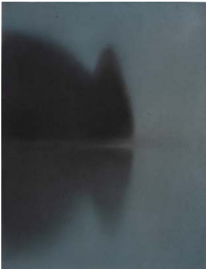
Peconic Bay # 7, 1997 pastel on paper 25 ½ x 19 ½ inches