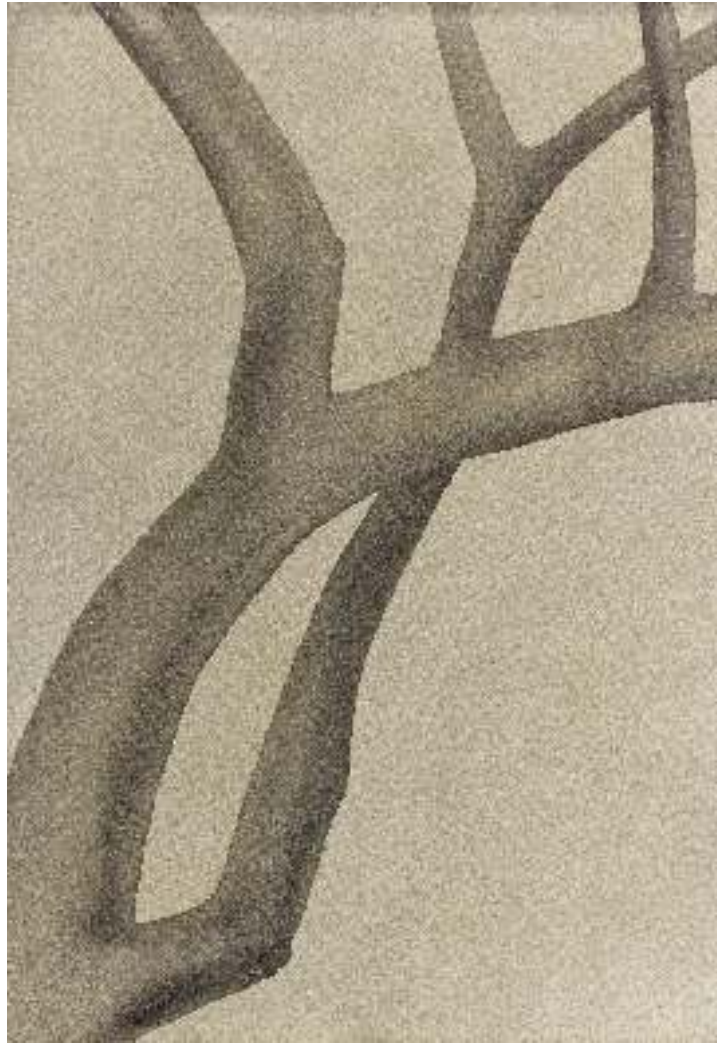
Tree #3, 2002 watercolor on paper 19 x 13 inches