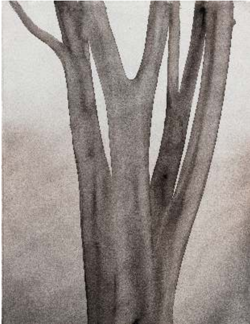
Tree #4, 2004, watercolor on paper 16 3 / 4 x 13 inches