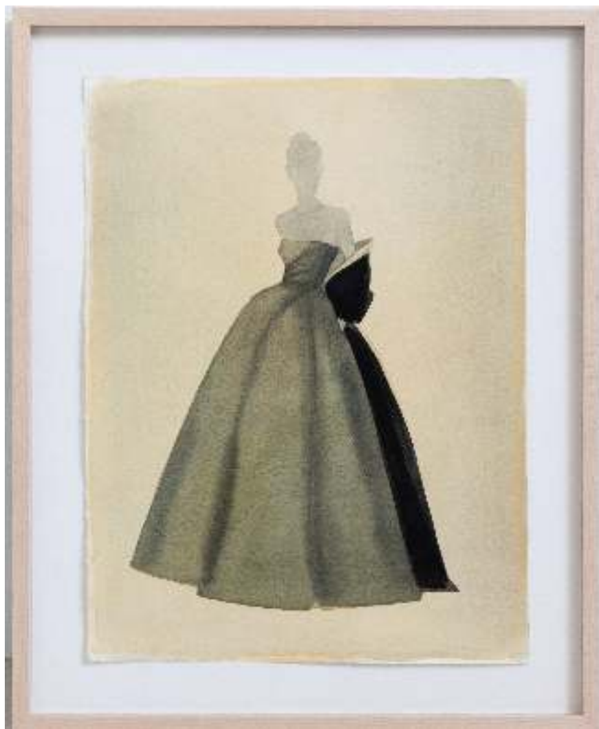
Phantom Thread watercolor on paper 17 x 13 inches