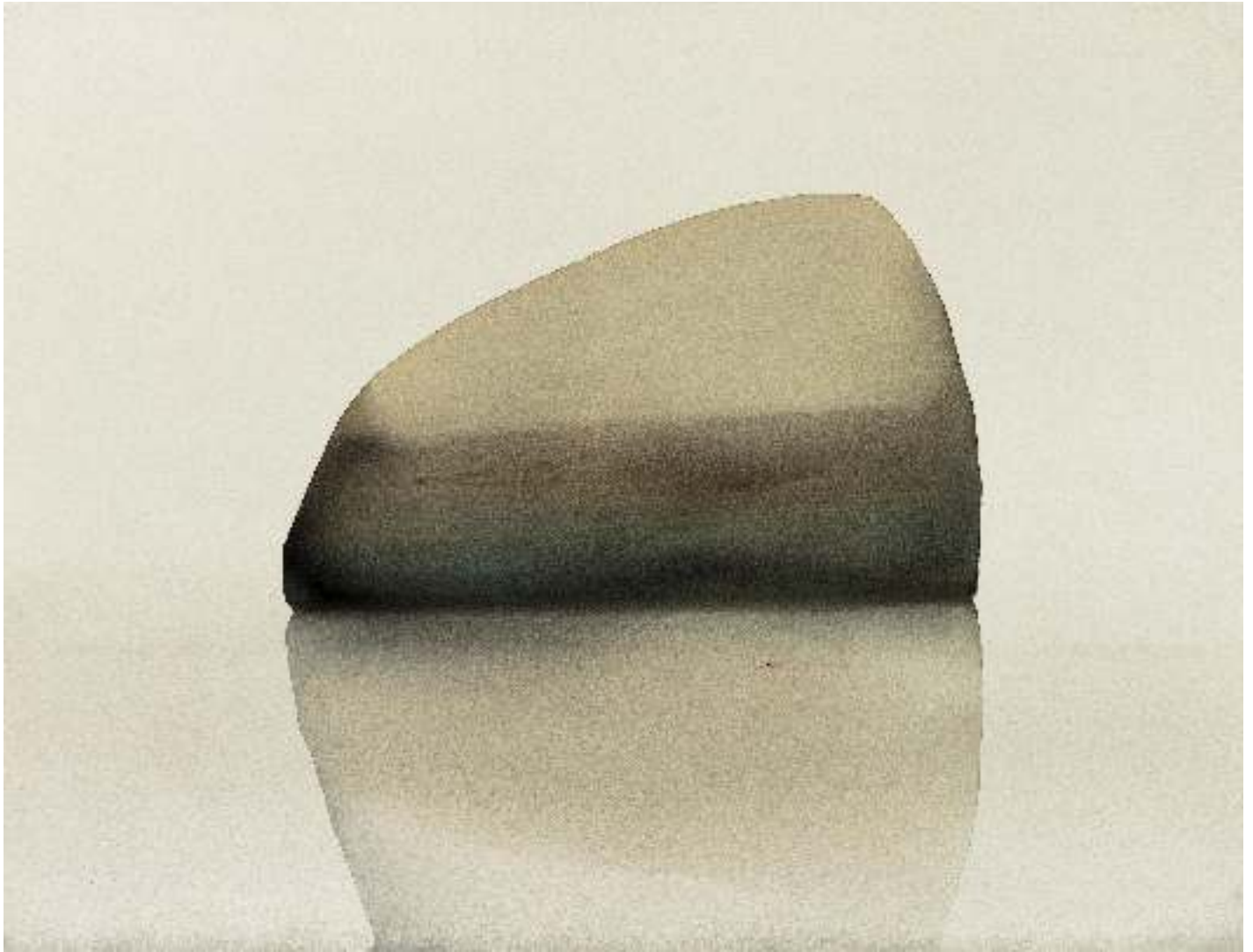
Rock #3, 2003 watercolor on paper 20 x 26 inches