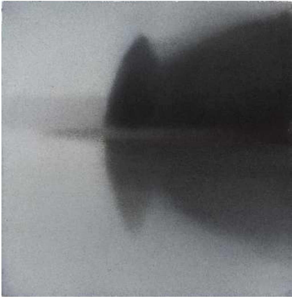
Peconic Bay #5, 1997 pastel on paper 20 x 19 ½ inches