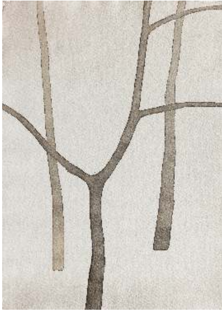
Tree #5, 2004 watercolor on paper 15 1/2 x 11 inches