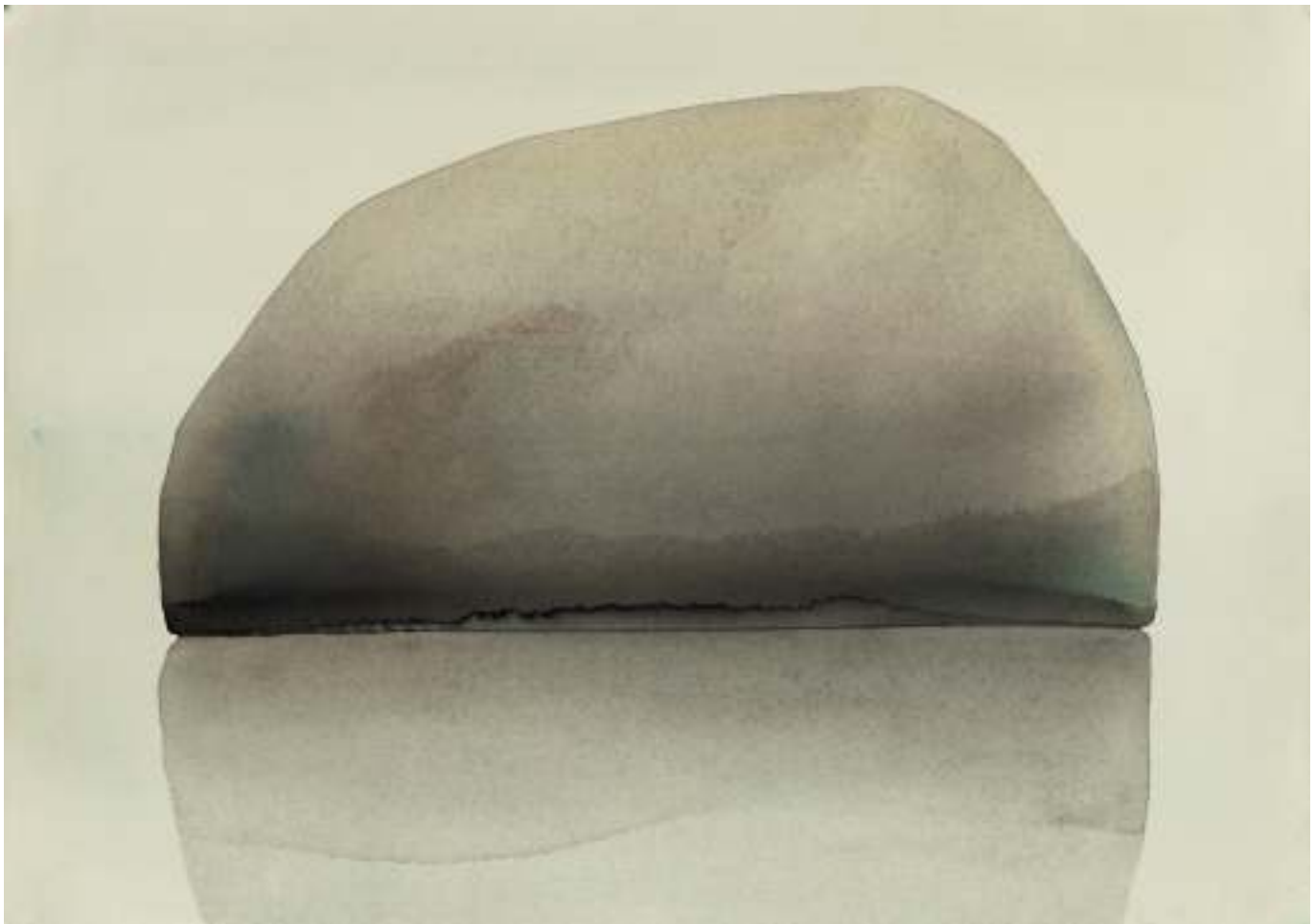
Rock #1, 2003 watercolor on paper 22 ¼ x 29 ¾ inches