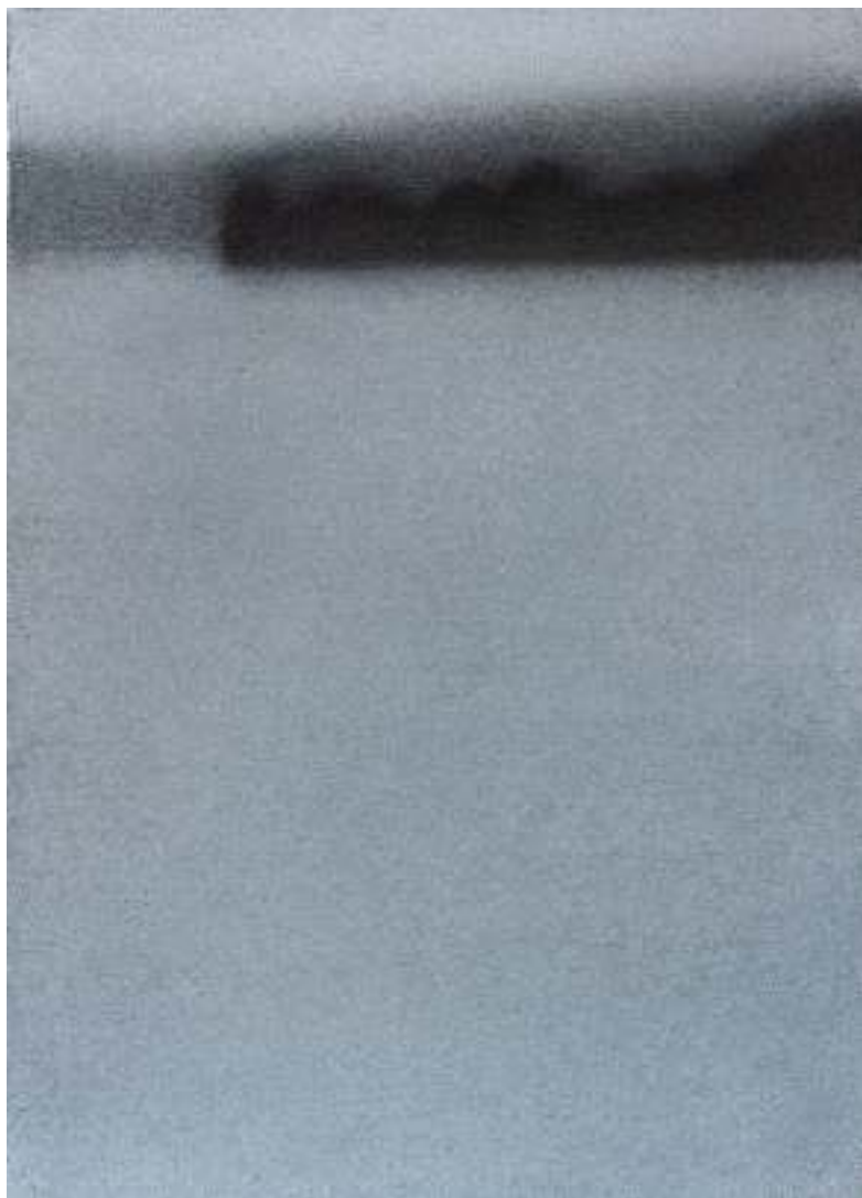
Peconic Bay #13, 2000 pastel on paper 17 1/2 x 12 1/2 inches