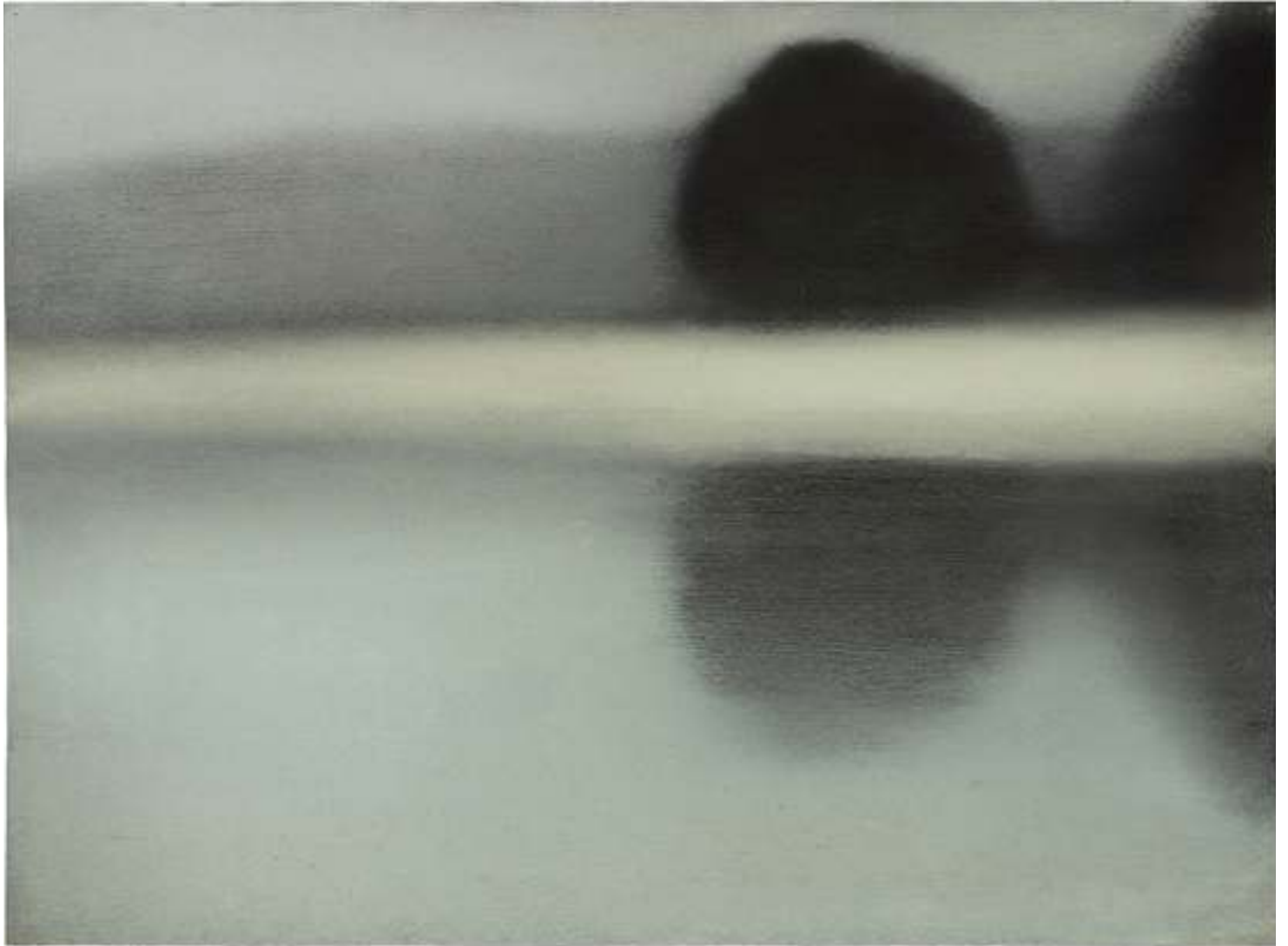
Peconic Bay #15, 2000 pastel on paper 19 3/4 x 25 1/2 inches