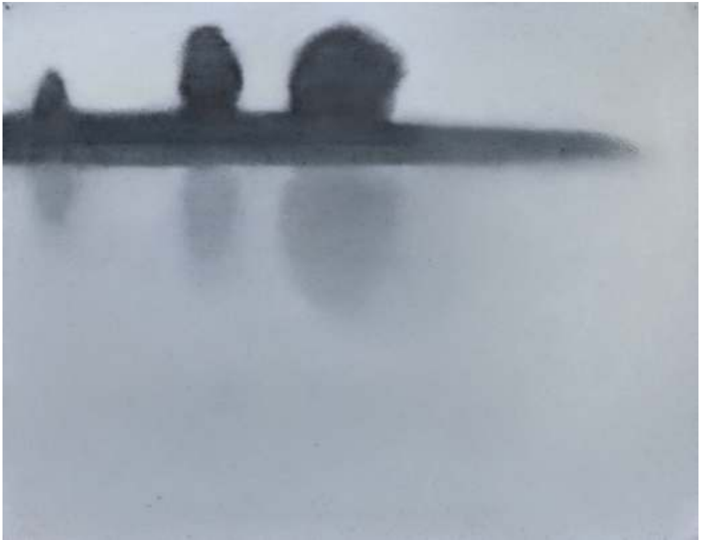
Peconic Bay #12, 2000 pastel on paper 19 3 / 4 x 25 1 / 2 inches