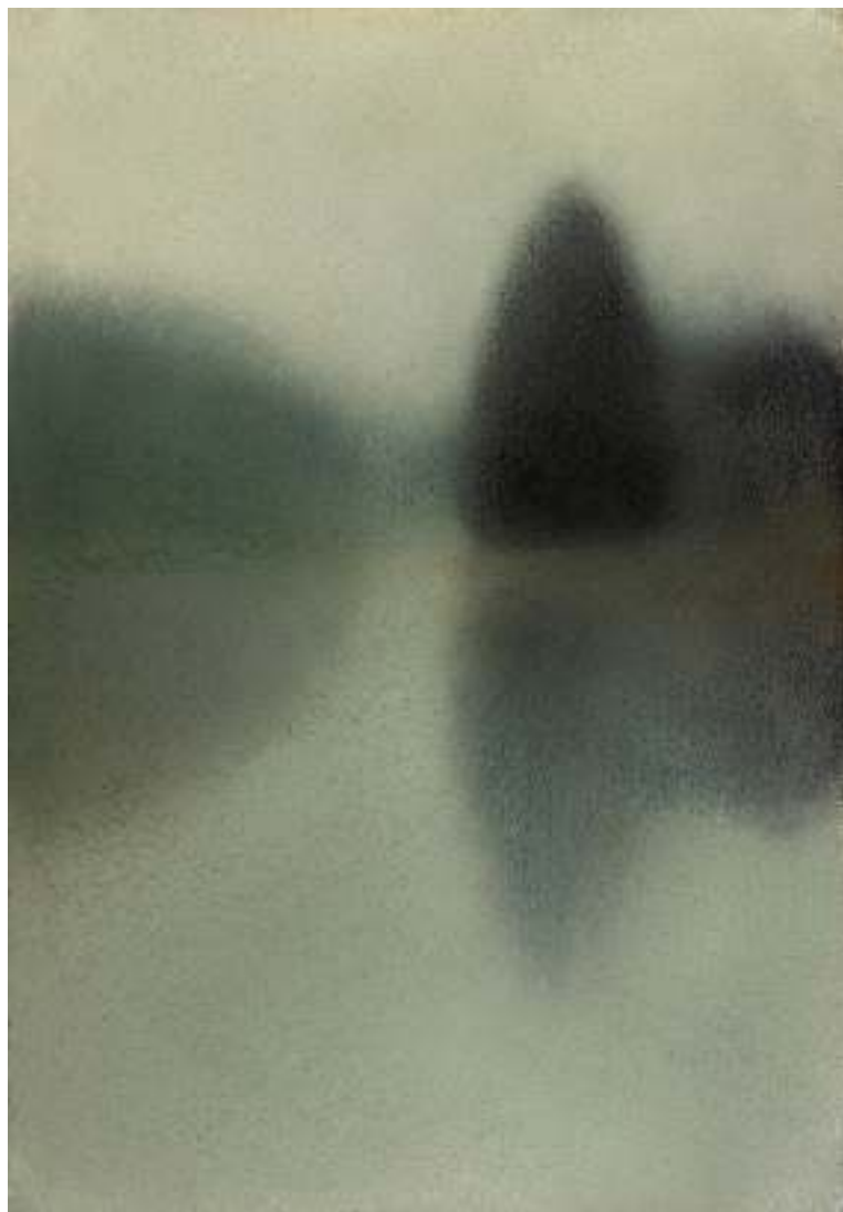
Peconic Bay #10, 1997 pastel on paper 22 x 15 ½ inches