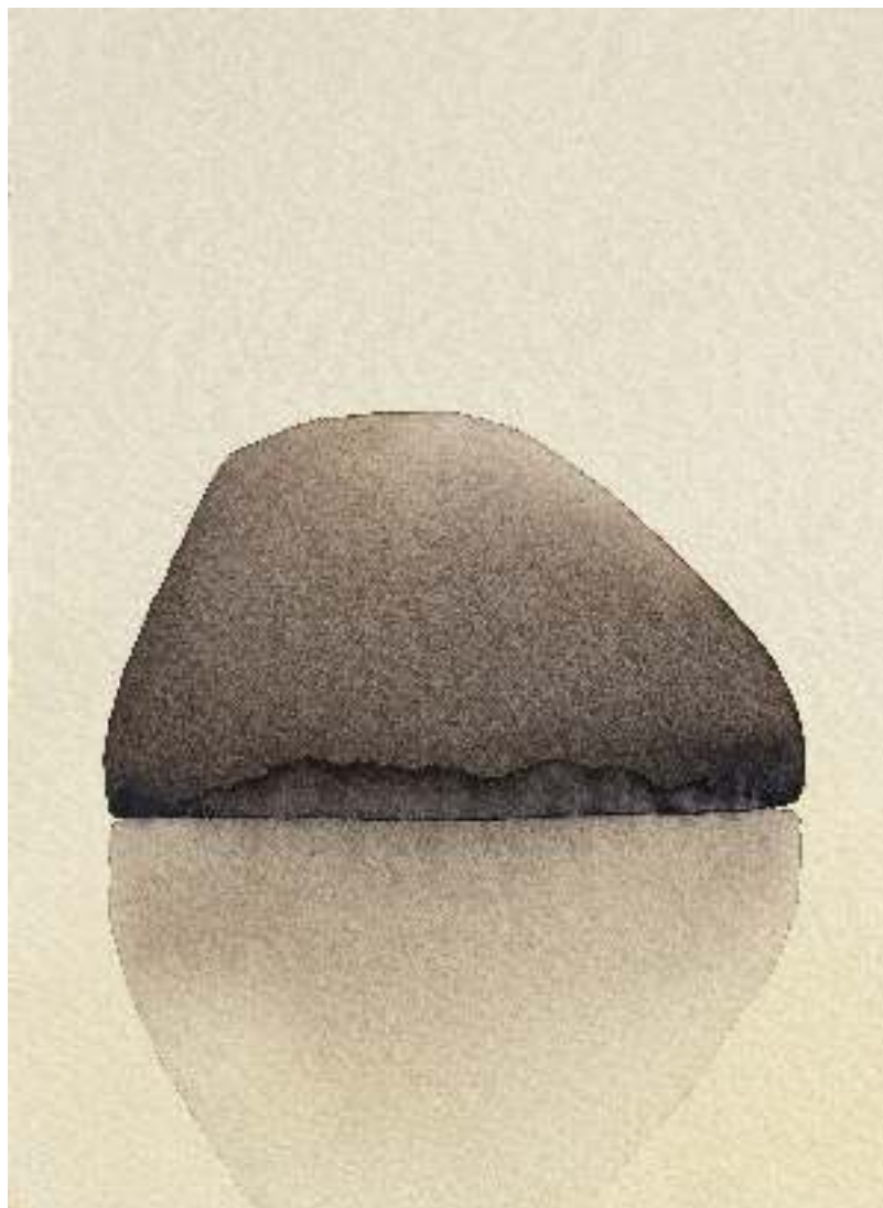
Rock #5, 2003 watercolor on paper 17 x 12 ½ inches